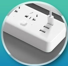
USB POWER STRIP

2-HOUR RAPID CHARGING & OUTLASTS YOUR ADVENTURE