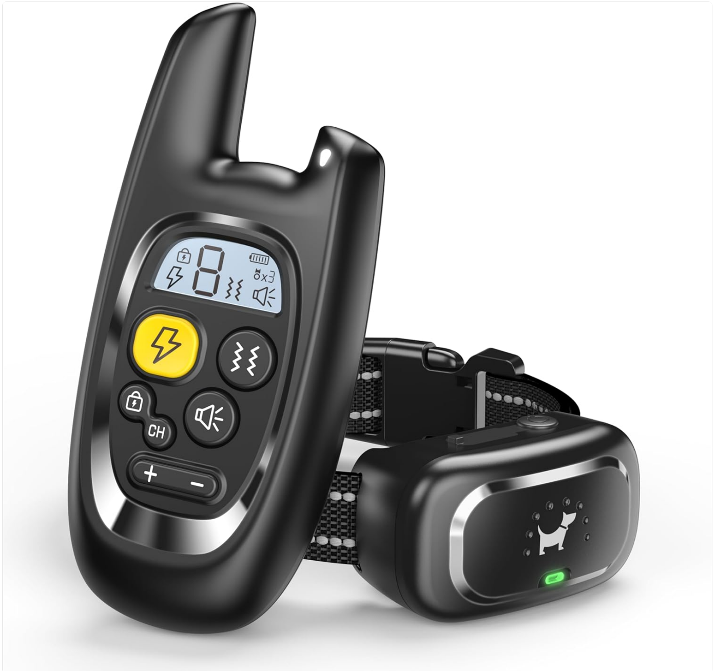
Image: The remote control and receiver collar, highlighting the main components.

The remote control features an intuitive design with a clear display and dedicated buttons for each function. It includes a unique shock-lock keypad to prevent accidental activation of the shock feature.