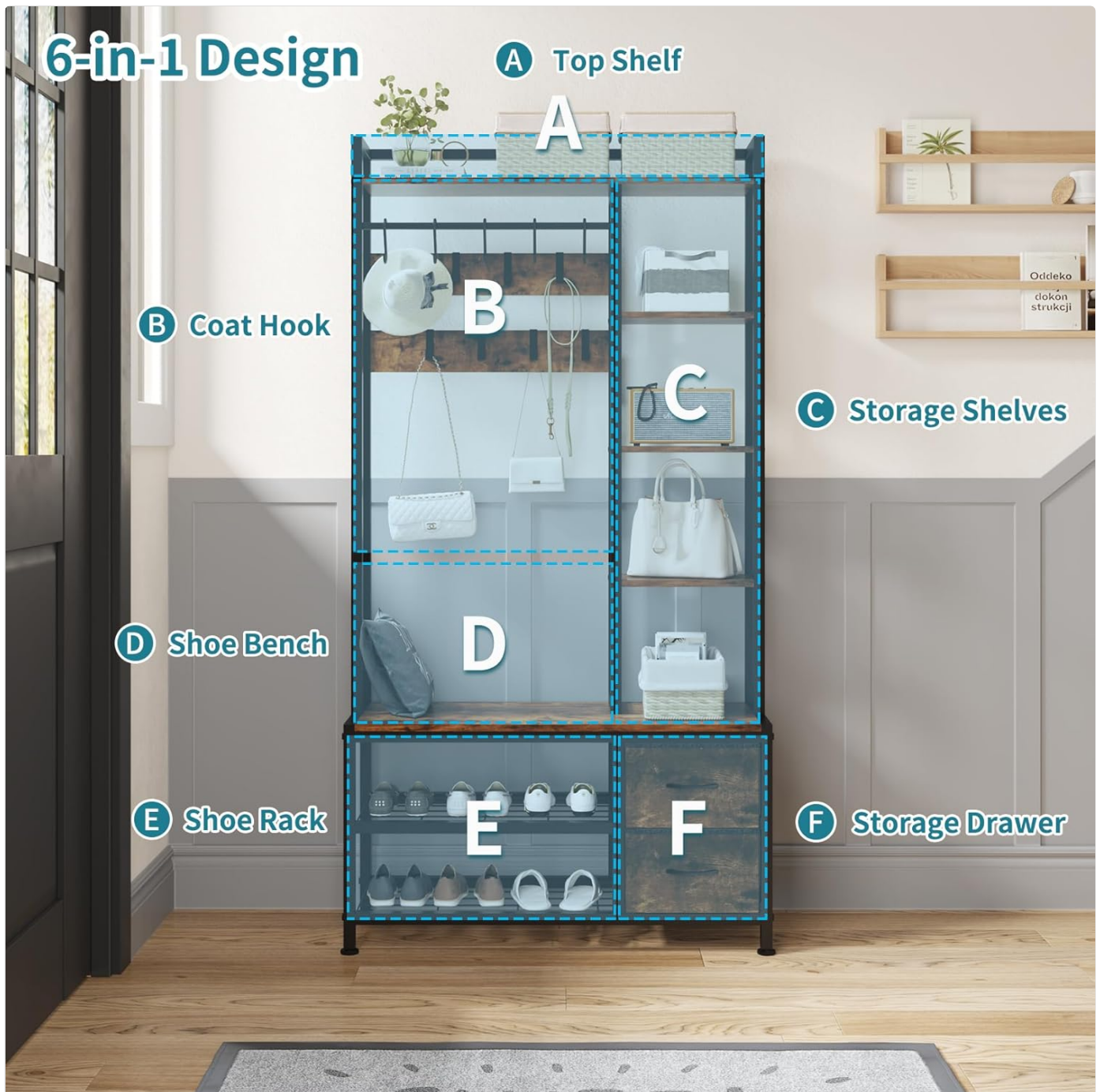
Figure 3: An exploded view illustrating the various functional components of the 6-in-1 hall tree design, including the top shelf, coat hooks, storage shelves, shoe bench, shoe rack, and storage drawers.