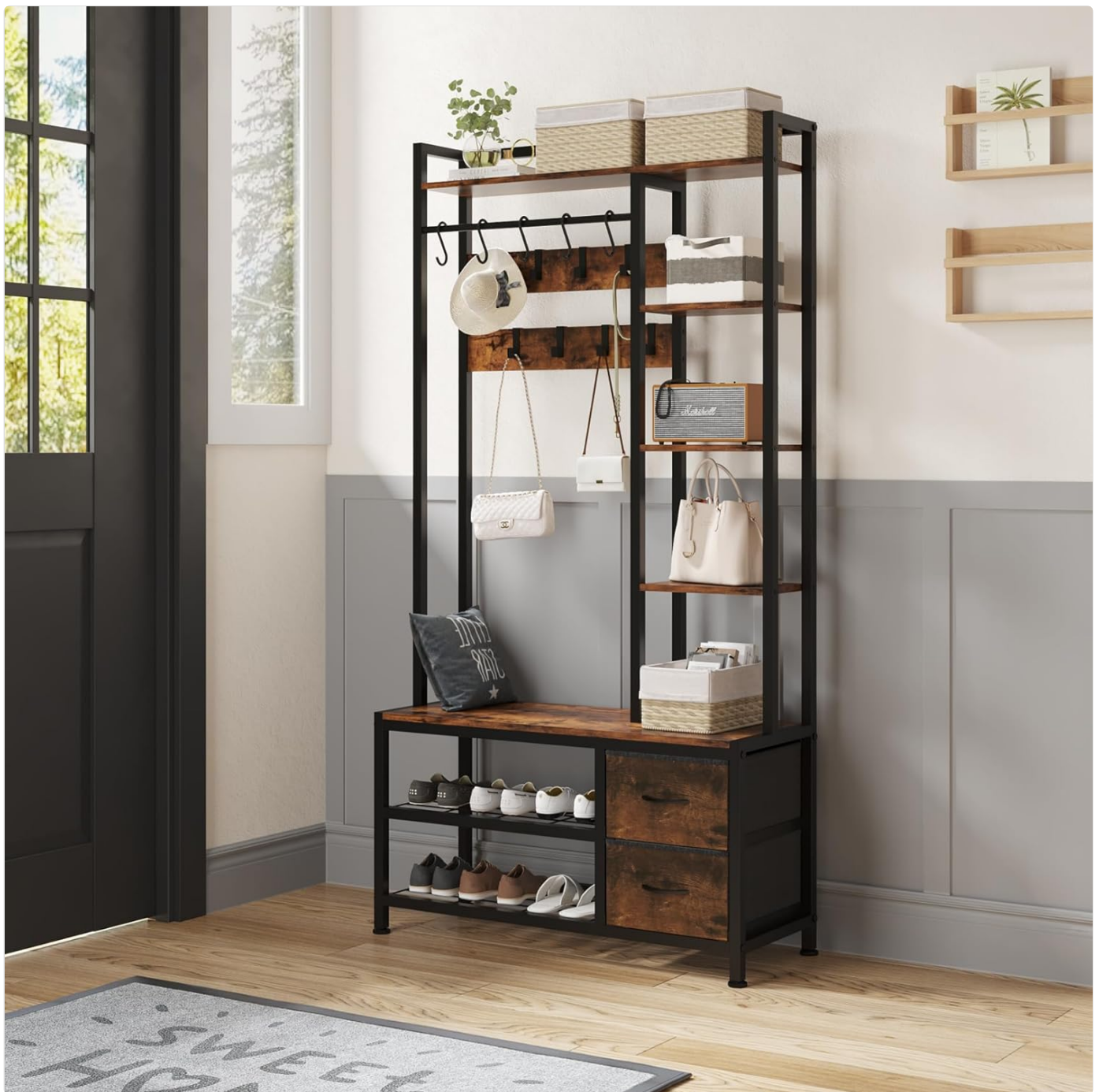
Figure 1: The LUMTOK Hall Tree, showcasing its integrated bench, coat hooks, and various storage shelves, designed for entryway organization.