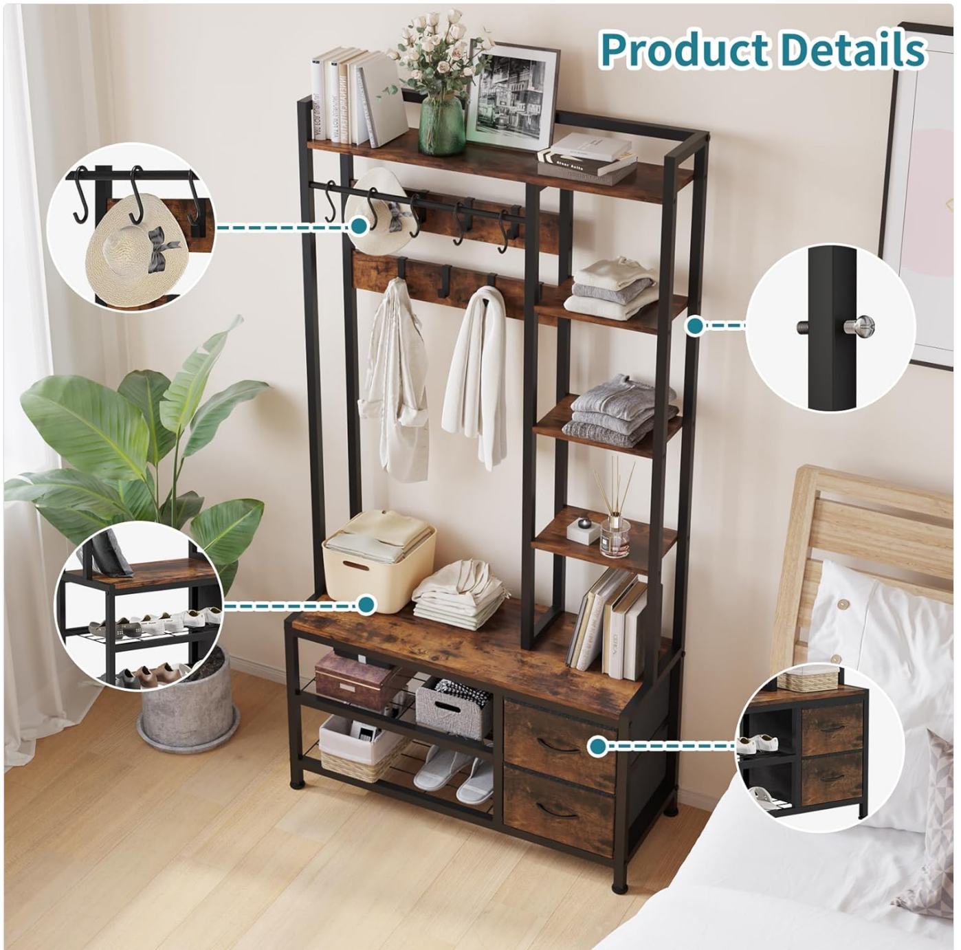
Figure 4: Close-up view highlighting the various storage features, including the coat hooks, side shelves, and fabric drawers, with annotations for product details.