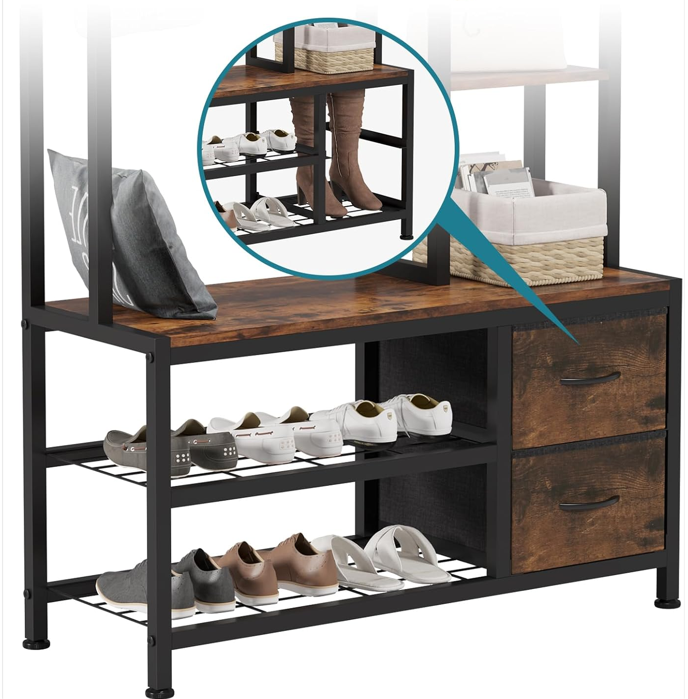
Figure 5: Detail of the shoe storage section, demonstrating the removable shelves that allow for accommodating taller footwear such as boots.