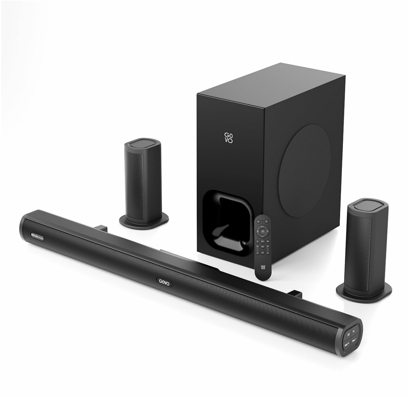
An overview of the GOVO GoSurround 990 system, showcasing the main soundbar unit, the wireless subwoofer, and the two compact satellite speakers, all in black.

The GOVO GoSurround 990 is a 5.1 channel home theatre soundbar system designed to deliver immersive audio. It features a main soundbar, a wireless subwoofer, and two satellite speakers for a complete surround sound experience.