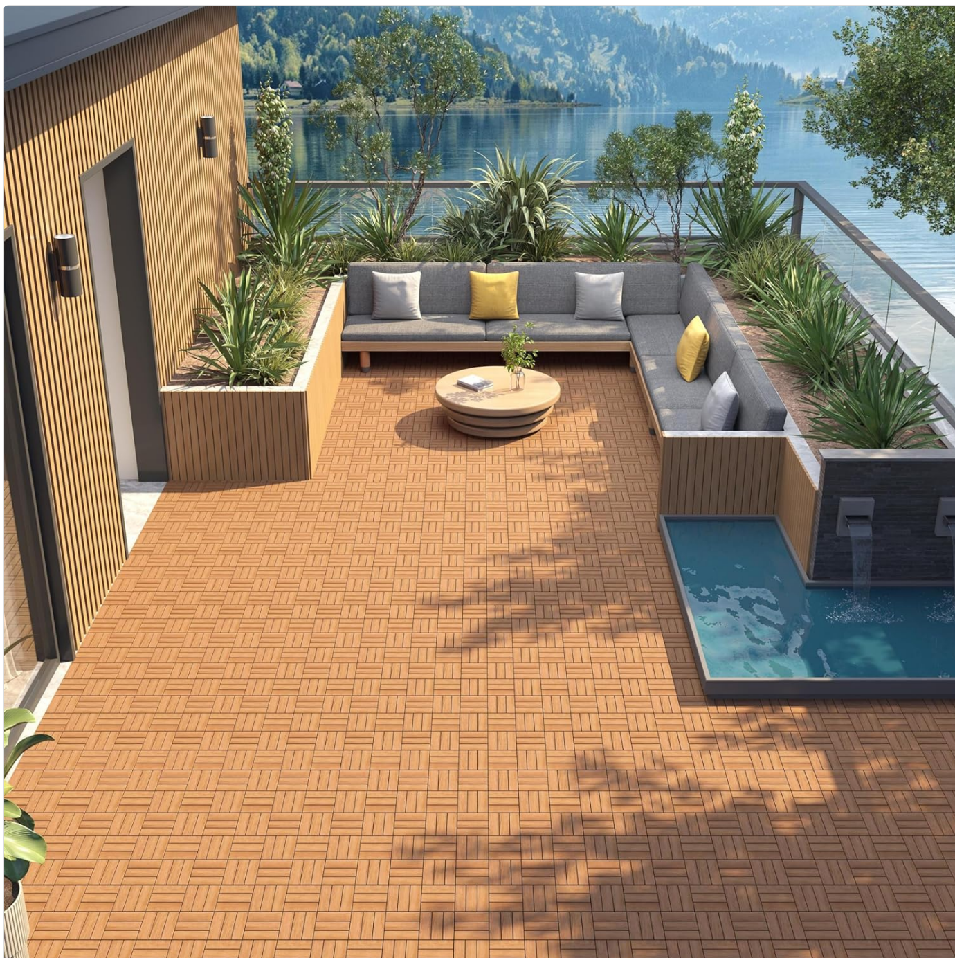
Image: Example of deck tiles used to create a beautiful and functional patio space.