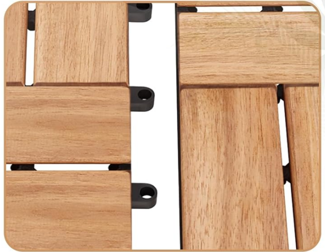
2 Align the grooves on the side