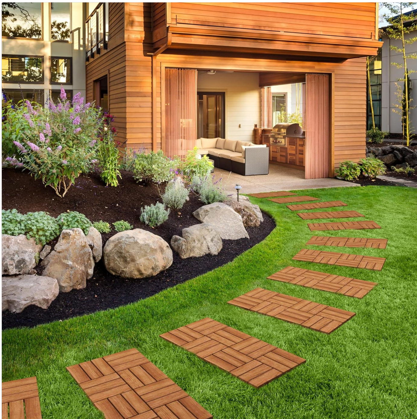
Image: Deck tiles forming a practical and attractive pathway in a garden setting.