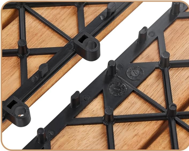
1 Fasteners design to connect firmly