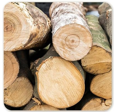
100% Acacia Wood