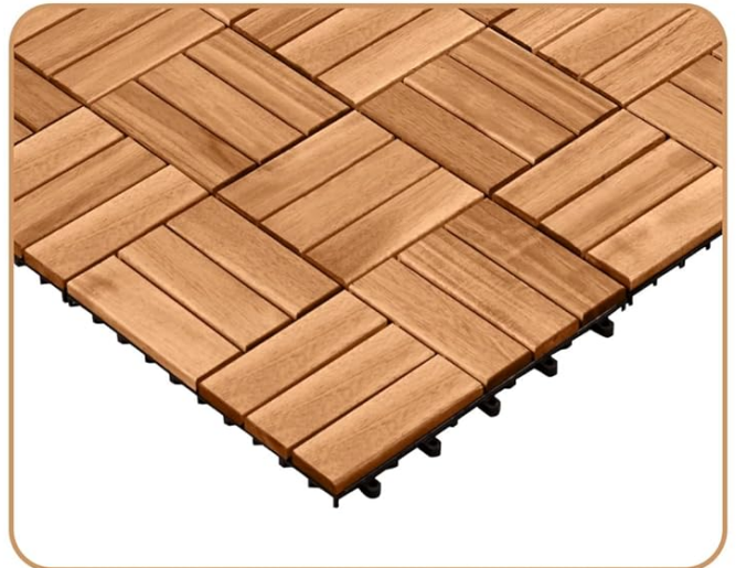
4 Complete assembly

Image: Step-by-step guide on the fast interlock mechanism for easy tile assembly.