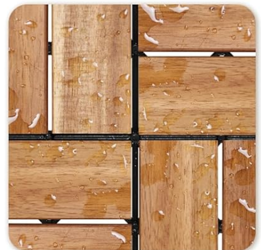
Better Water Resistance

Image: Detailed view of the deck tiles, emphasizing the 100% Acacia Wood composition, higher hardness, and improved water resistance.