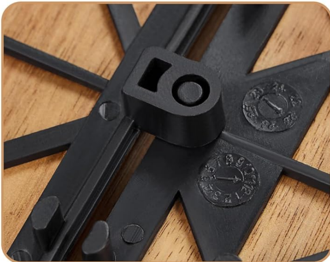
3 Press hard