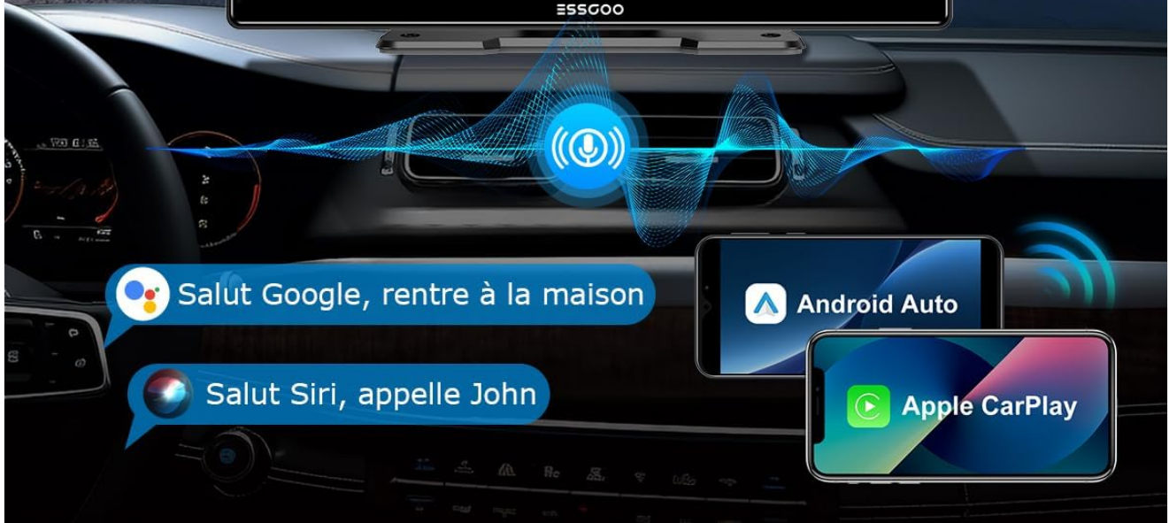
Image: The Mirror Link feature in action, showing content from both iOS and Android devices mirrored onto the car display.