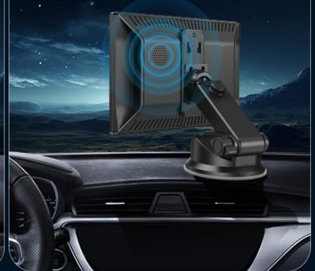
Image: Illustration highlighting the easy and quick installation of the wireless CarPlay display compared to complex traditional car stereo wiring.