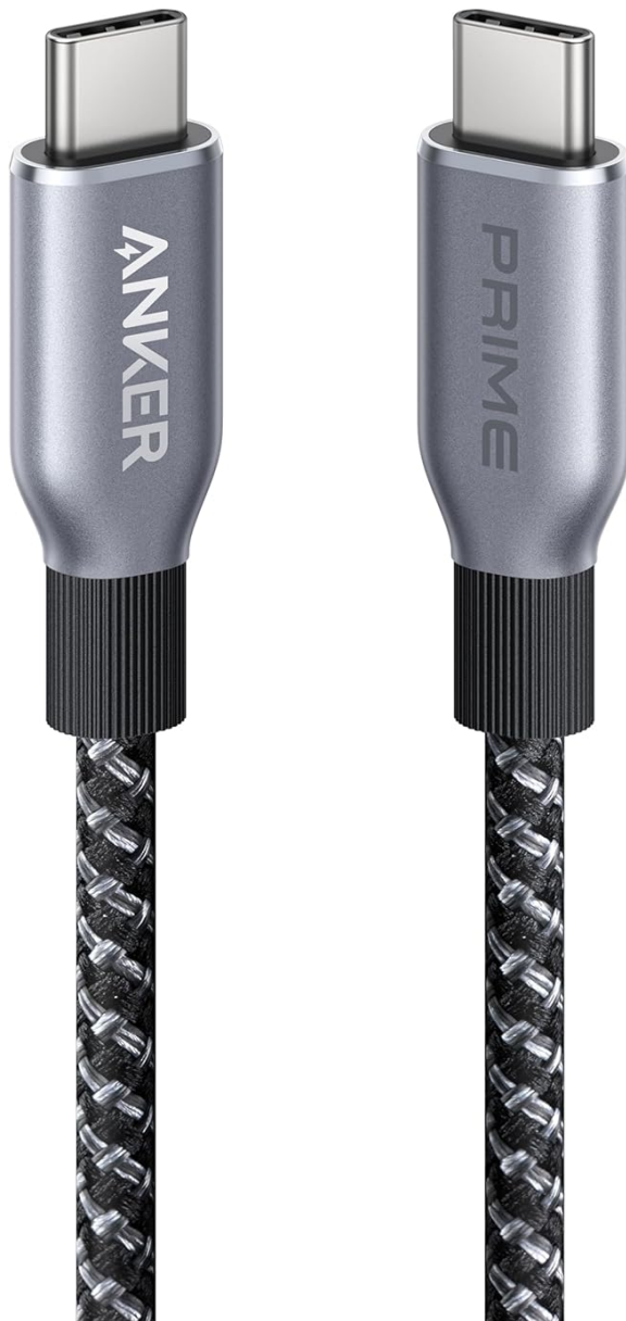
Image: Anker Prime USB C to USB C Cable, showcasing its braided design and USB-C connectors.