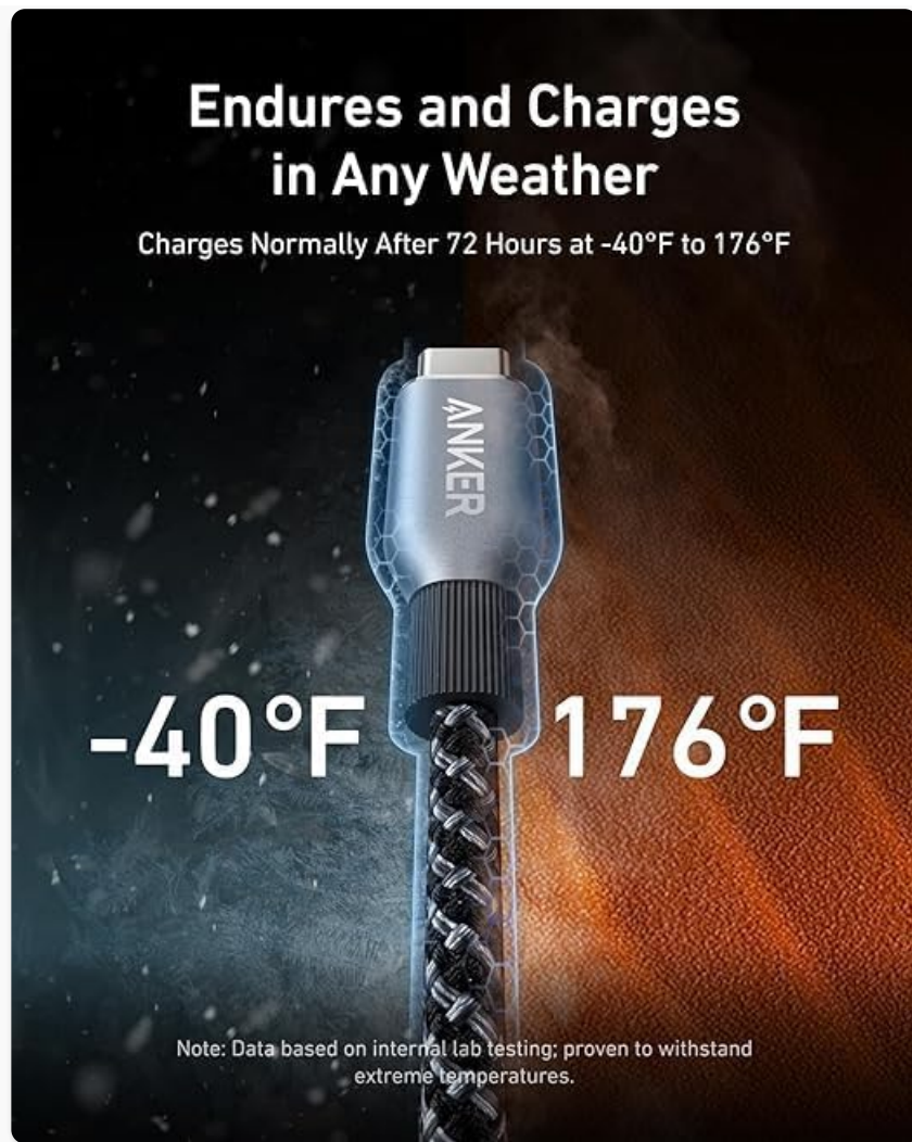
Image: Graphic showing the cable's ability to endure and charge in extreme temperatures, from -40°F to 176°F.