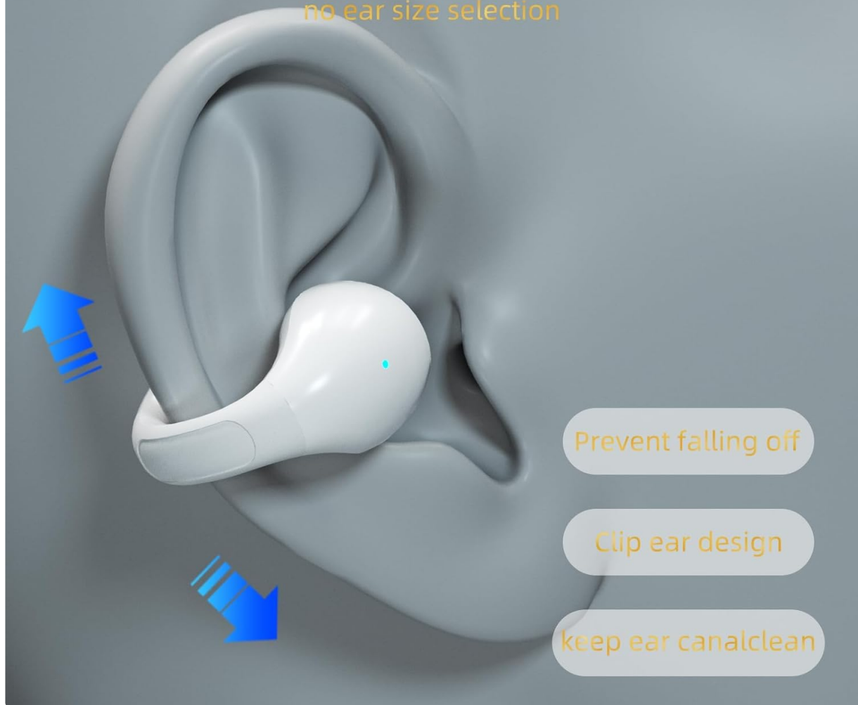
Figure 4: Proper Earbud Placement

No need to enter the ear, protect eardrum from damage no ear size selection