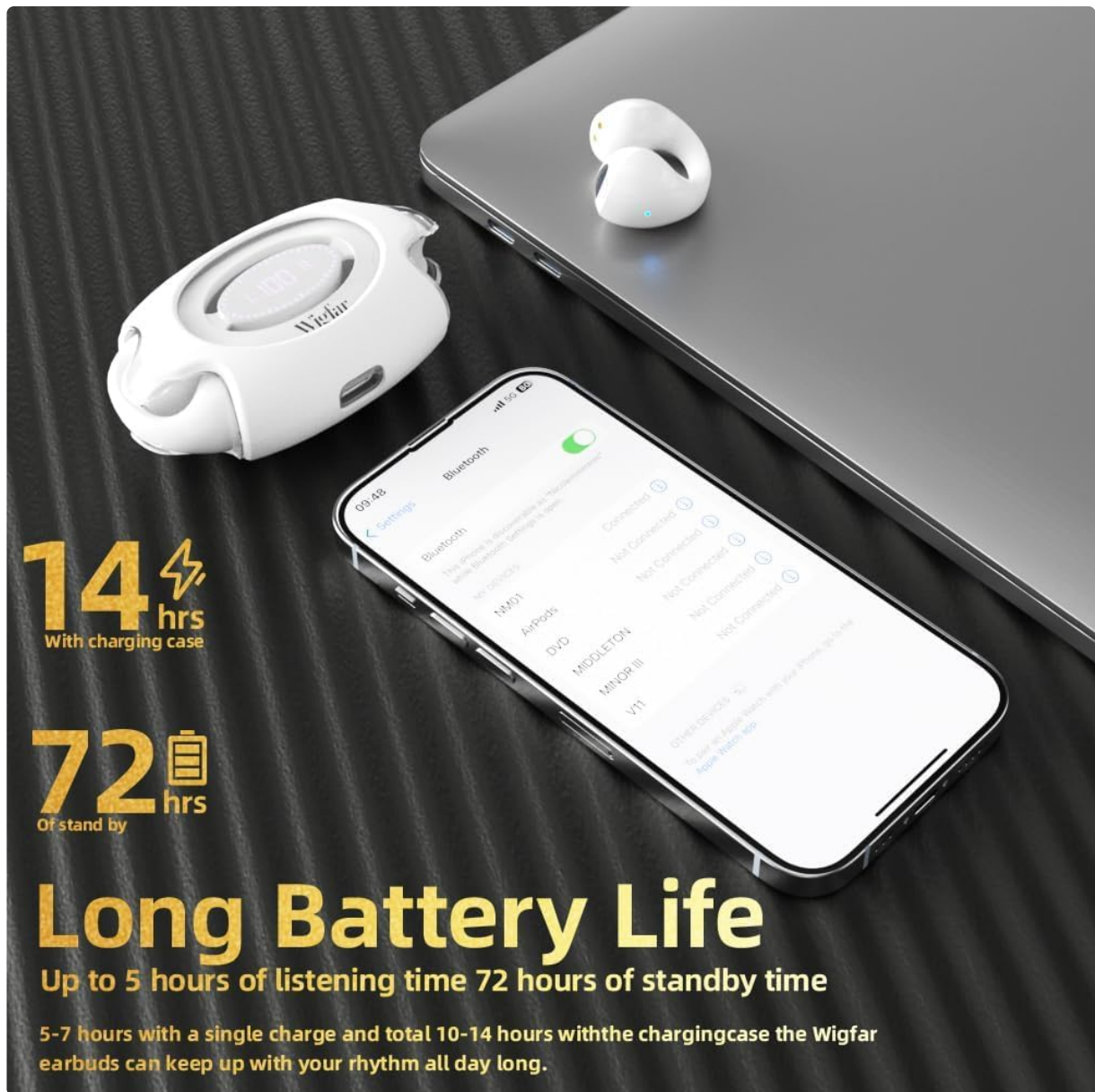
Figure 3: Bluetooth Pairing with a Device