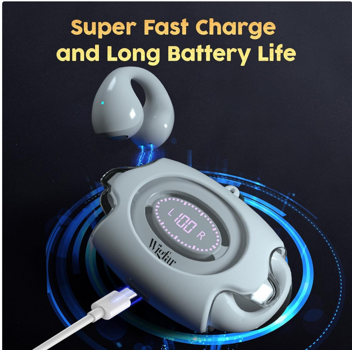
Figure 2: Charging the Earbuds and Case