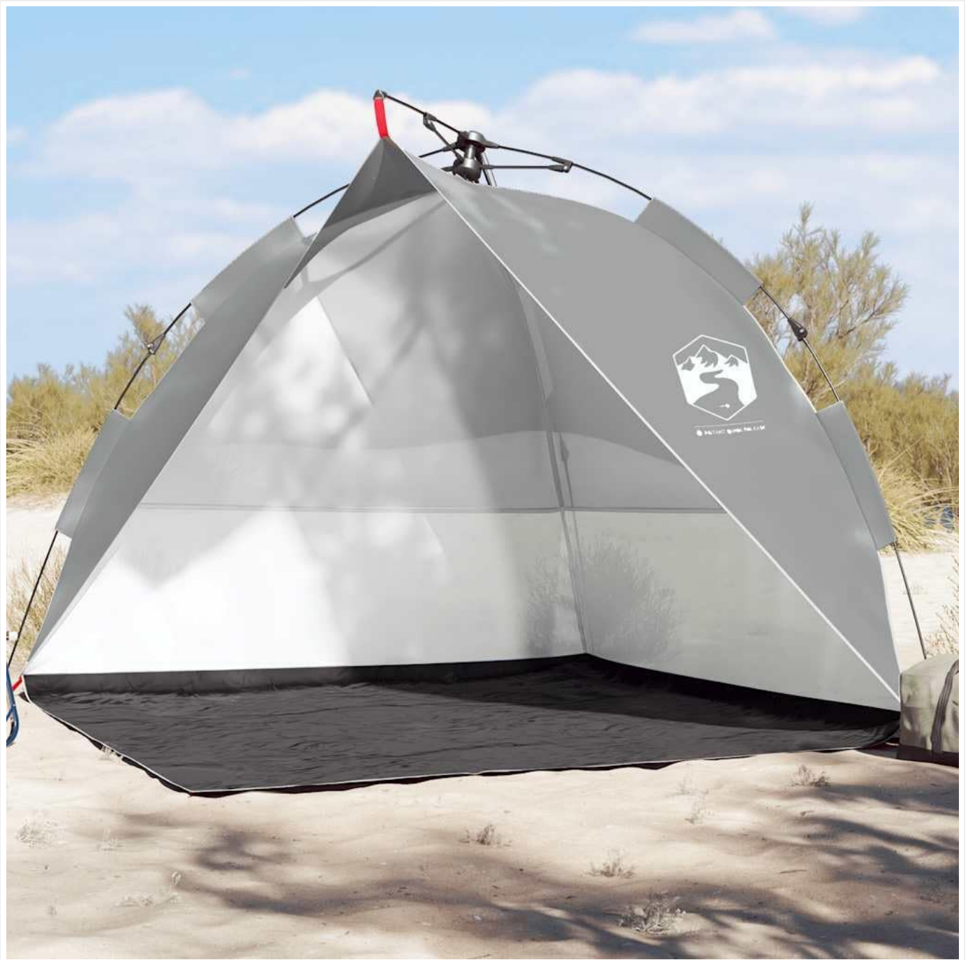
Image: The vidaxL beach tent fully assembled and positioned on a sandy beach, demonstrating its open design and shelter capabilities.