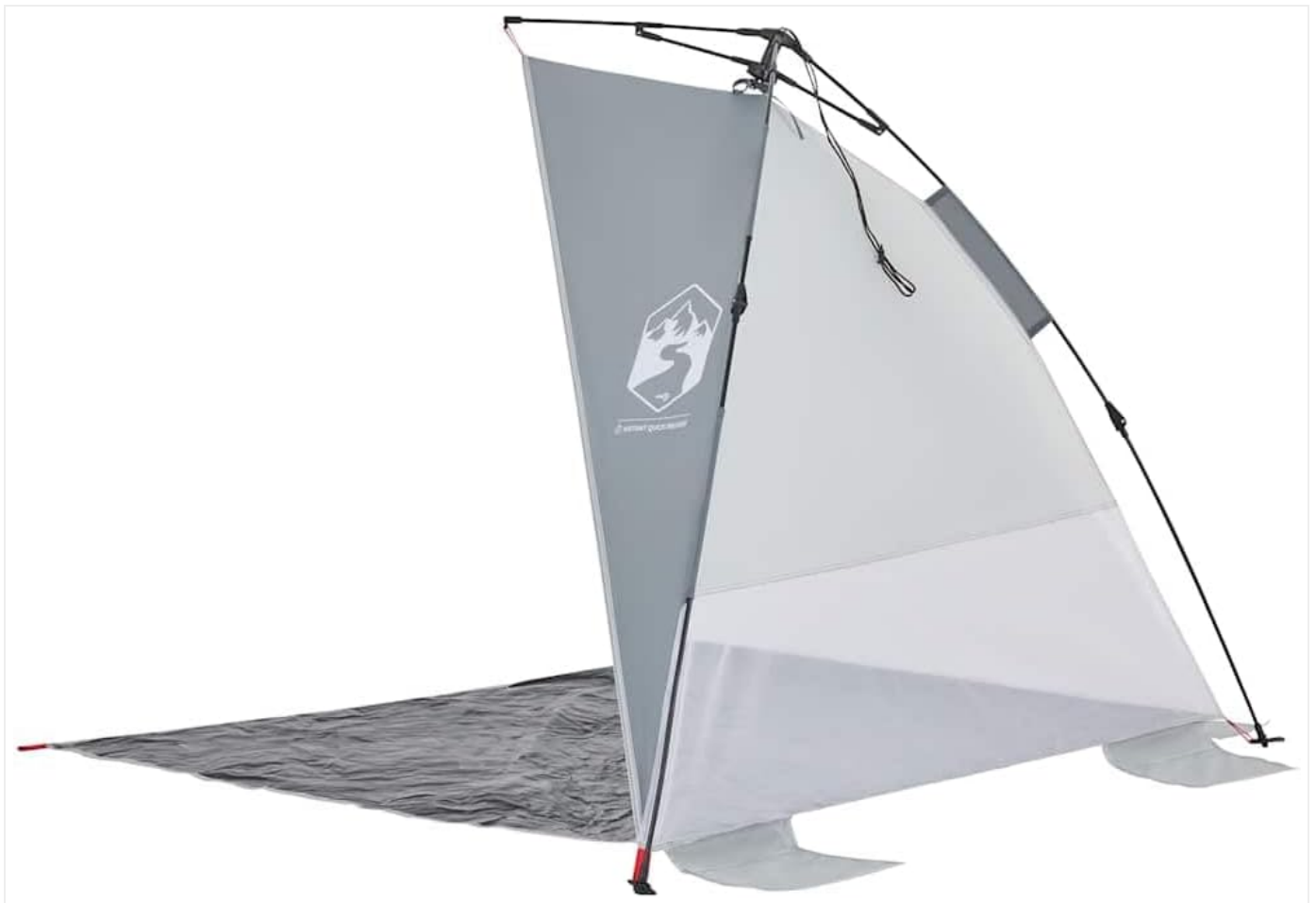
Image: The beach tent configured to provide shelter from the side, illustrating its adaptability as a windbreak or privacy screen.