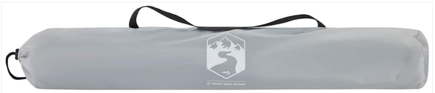
Image: The beach tent neatly folded and stored inside its compact carry bag, ready for transport.