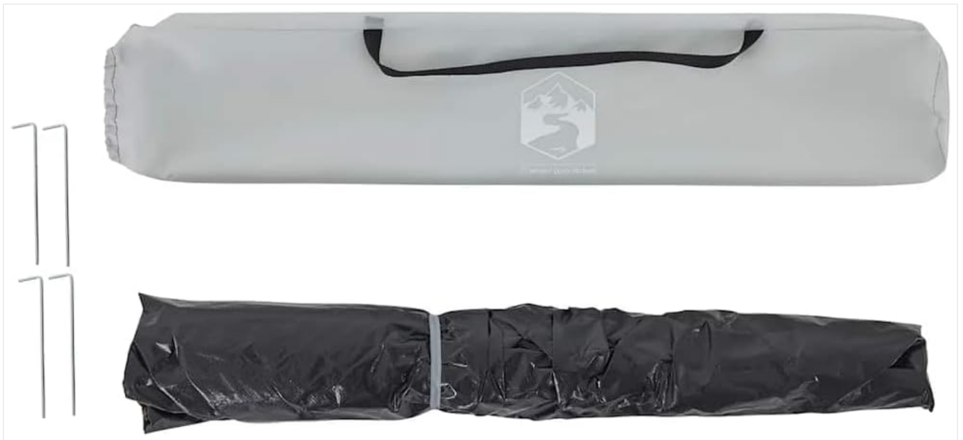
Image: The beach tent carry bag shown alongside ground stakes, indicating the complete package contents.