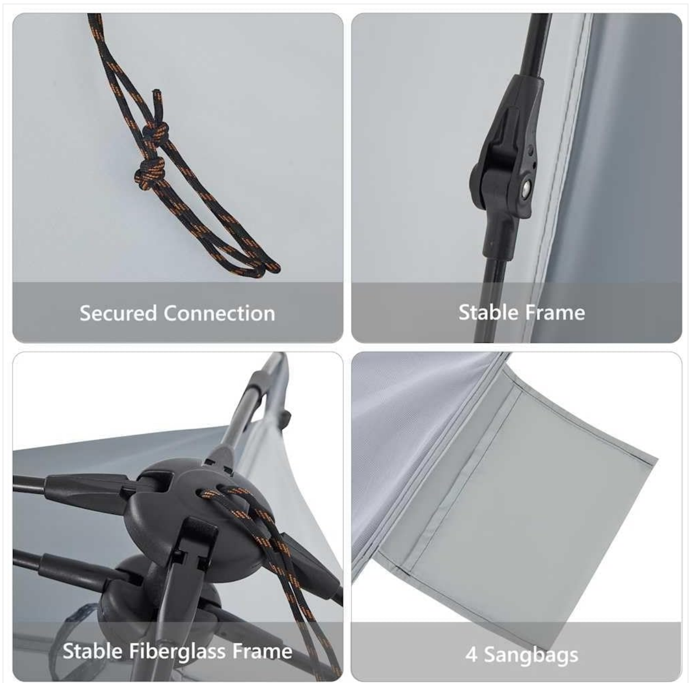
Image: Detailed views highlighting the tent's construction, including secured rope connections, stable frame joints, the robust fiberglass frame mechanism, and the four integrated sandbags for anchoring.