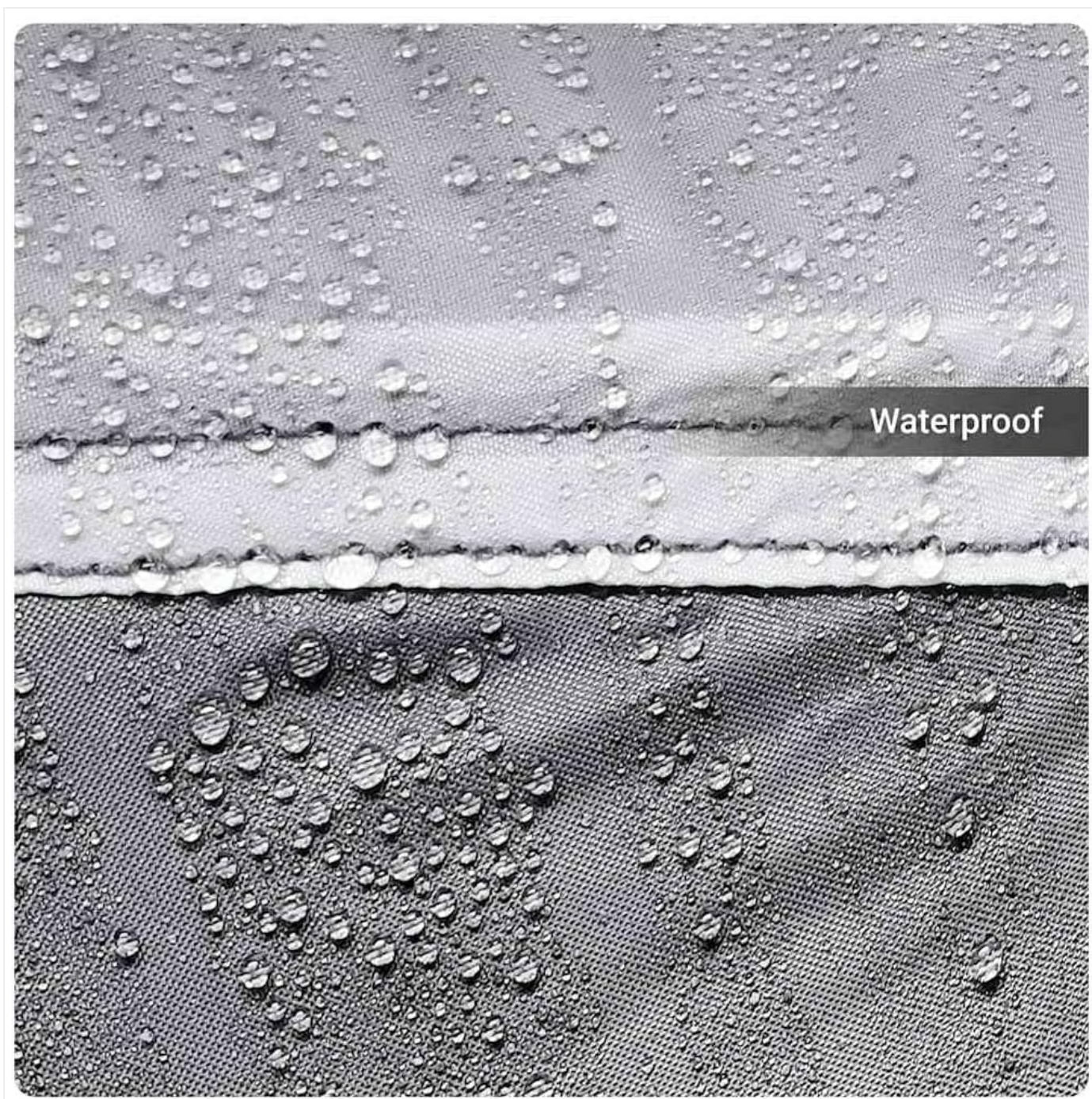
Image: A close-up view of the tent fabric demonstrating its waterproof properties, with water droplets beading on the surface.