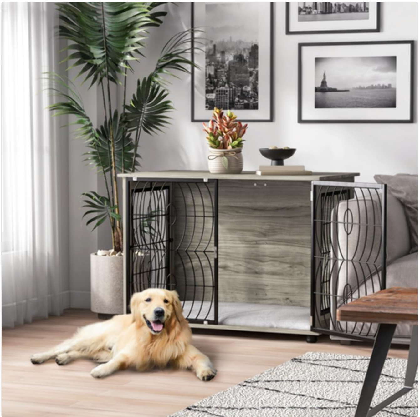
Image 5.1: A dog resting inside the crate, demonstrating its dual functionality in a living space.