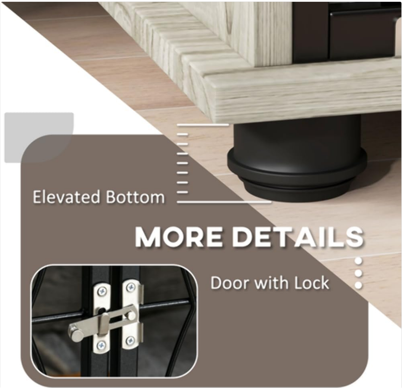
Image 3.2: Detail of the elevated bottom and the secure door lock.