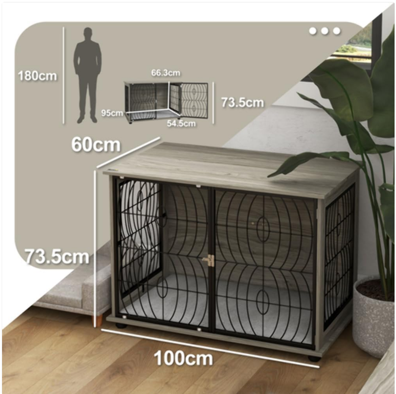
Image 4.1: Visual representation of the product dimensions to aid in placement and assembly.