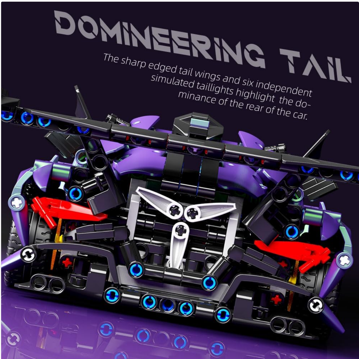
Figure 8.1: The rear section of the car, featuring sharp-edged tail wings and six independent simulated taillights, emphasizing its powerful design.