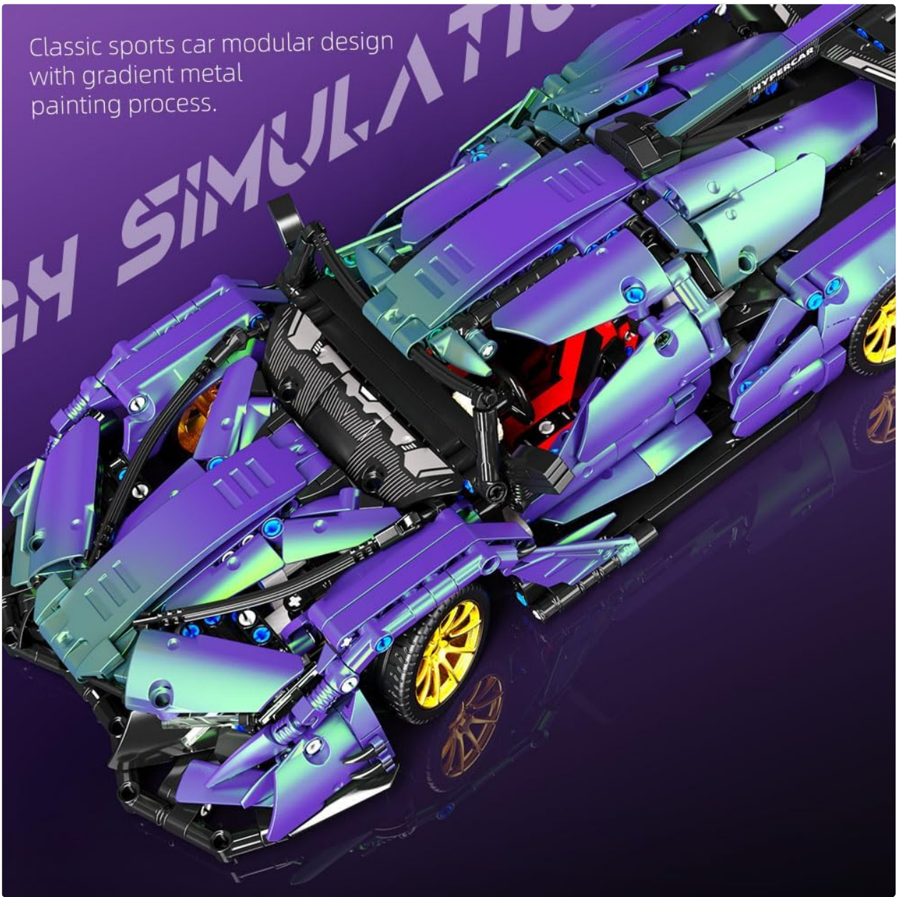
Figure 5.2: This image illustrates the classic sports car modular design with its gradient metal painting process, emphasizing the sleek lines and construction.

Classic sports car modular design with gradient metal painting process.