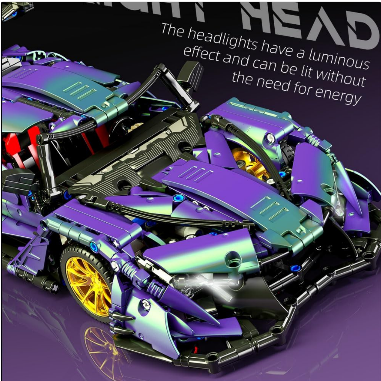
Figure 5.3: A detailed view of the front section, showing the headlights which possess a luminous effect and can be lit without requiring external energy sources.