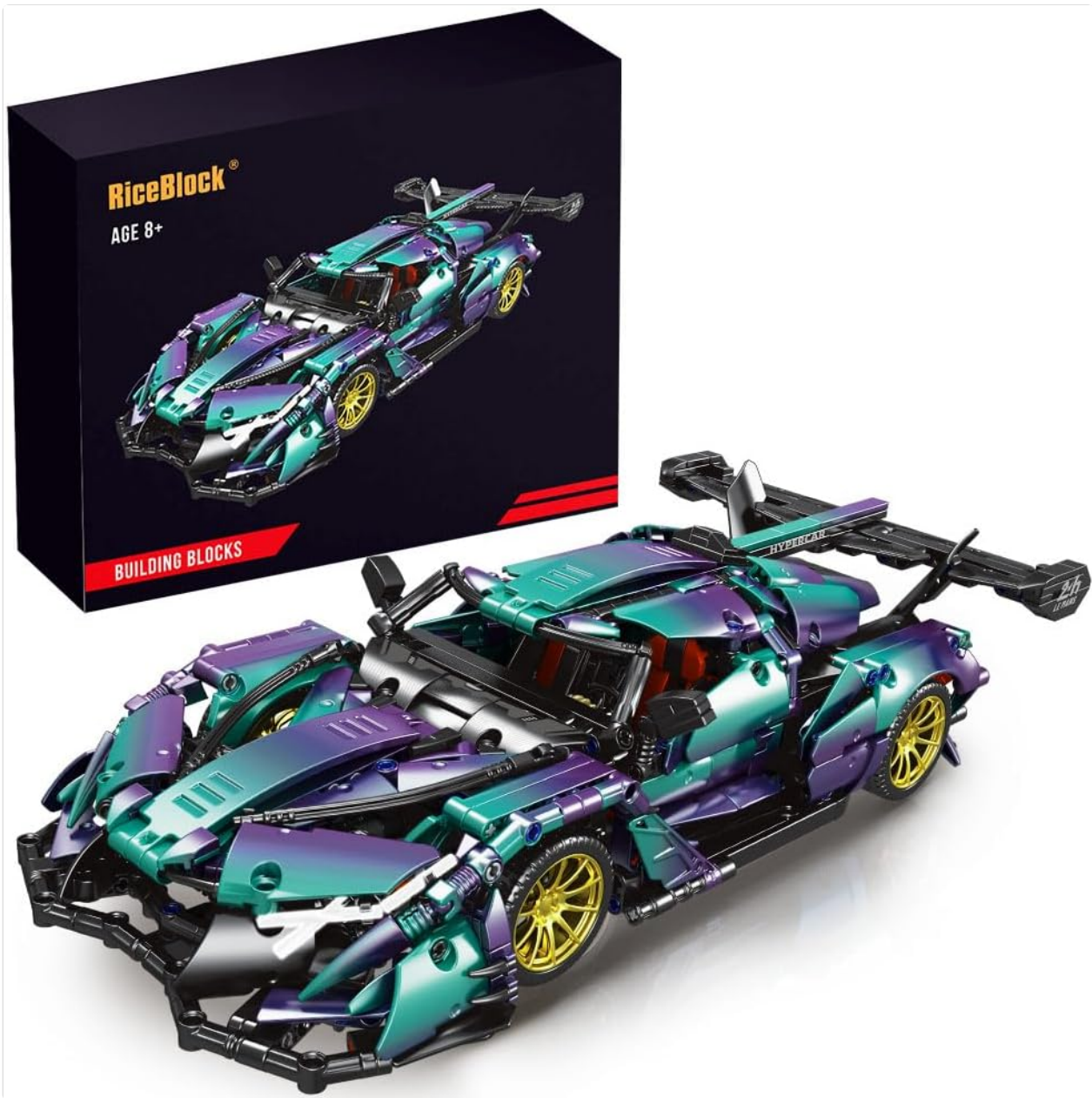
Figure 2.1: The RiceBlock Champion Racing Car Building Kit, showing the assembled model alongside its packaging. The car features a striking color-changing finish and intricate details.