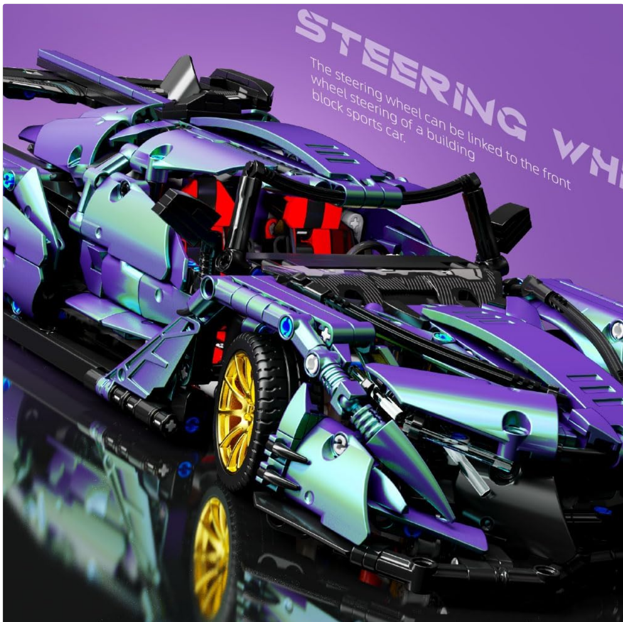
Figure 6.2: A view of the car's interior, highlighting the steering wheel which can be linked to control the front wheels of the building block sports car.