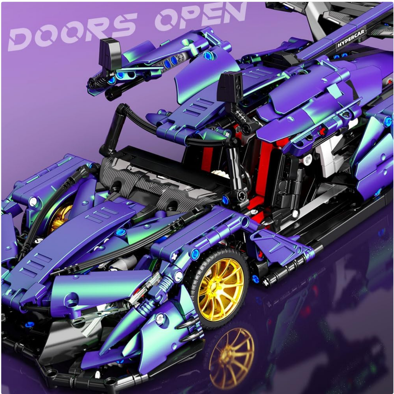
Figure 6.1: The RiceBlock Champion Racing Car with its butterfly doors in the open position, showcasing the interior details.