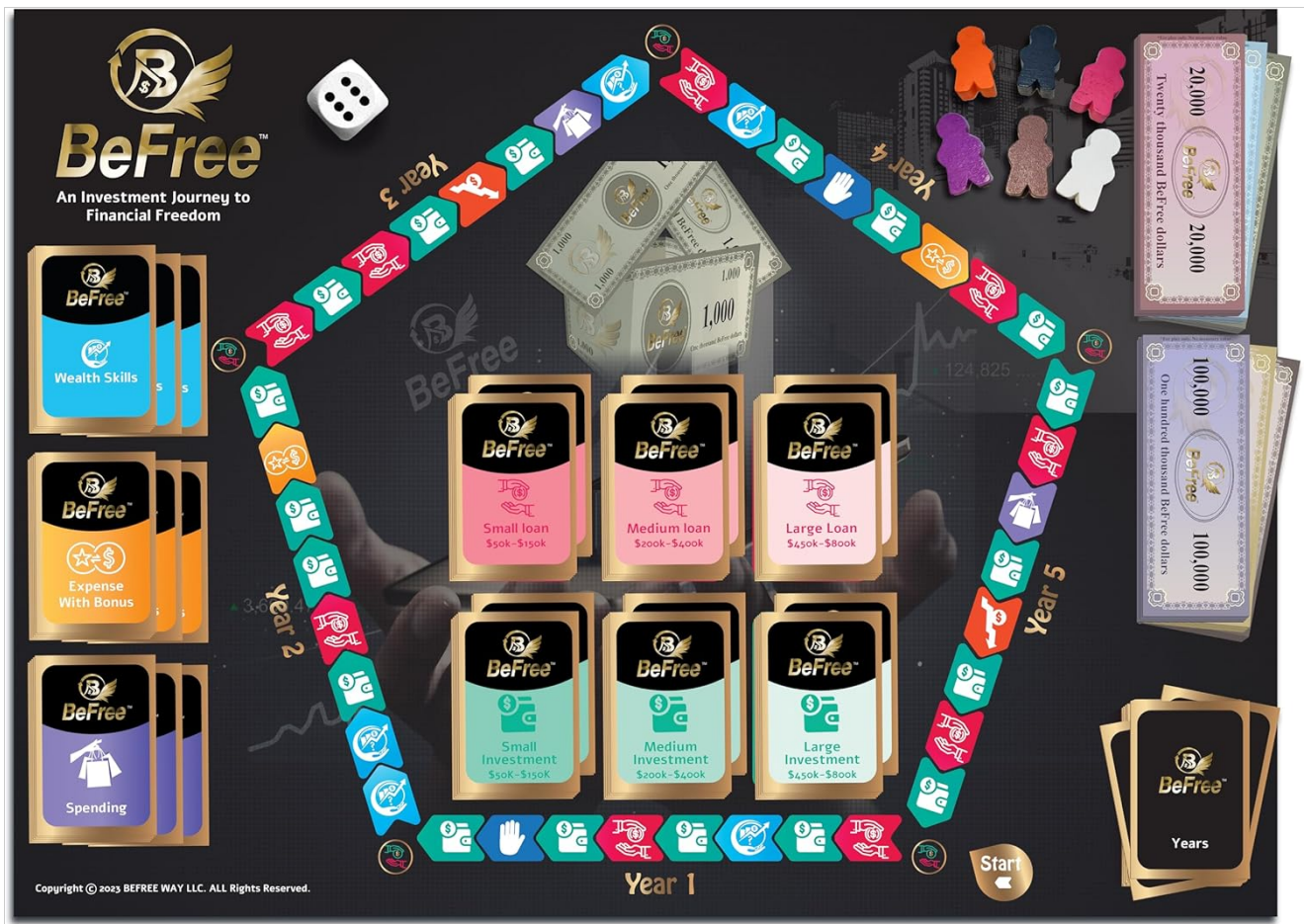
Description: The BeFree game box and a partially set up game board, showing the layout before play begins.