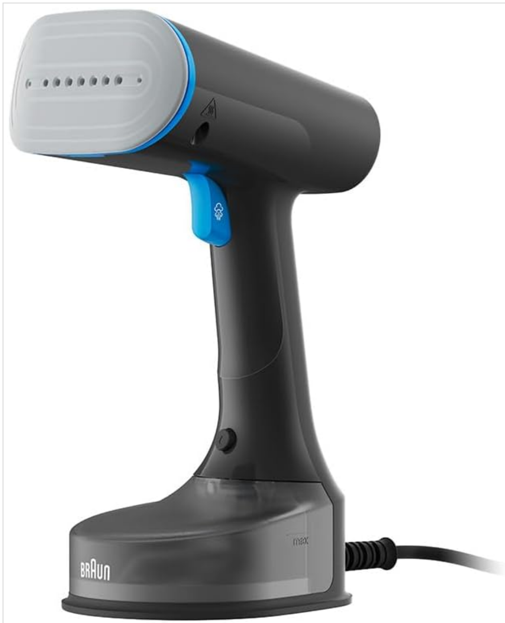
Figure 1: Front view of the Braun QuickStyle 5 GS5031BL handheld garment steamer, showing the steam head and steam trigger.