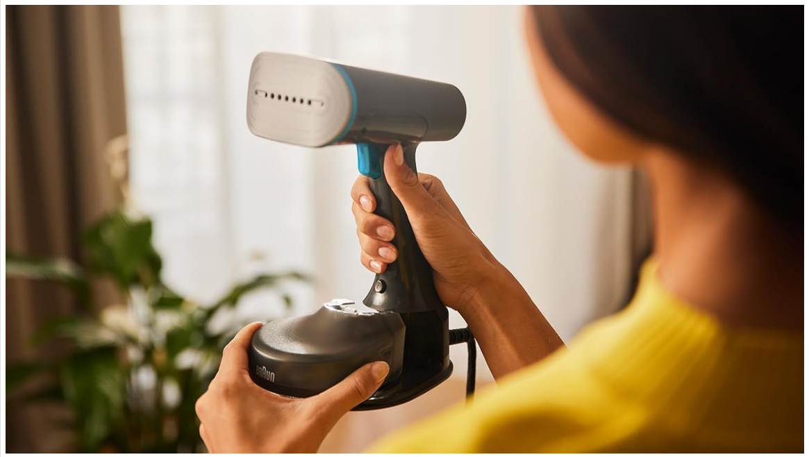
Figure 3: A hand demonstrating the removal of the water tank from the steamer for refilling.