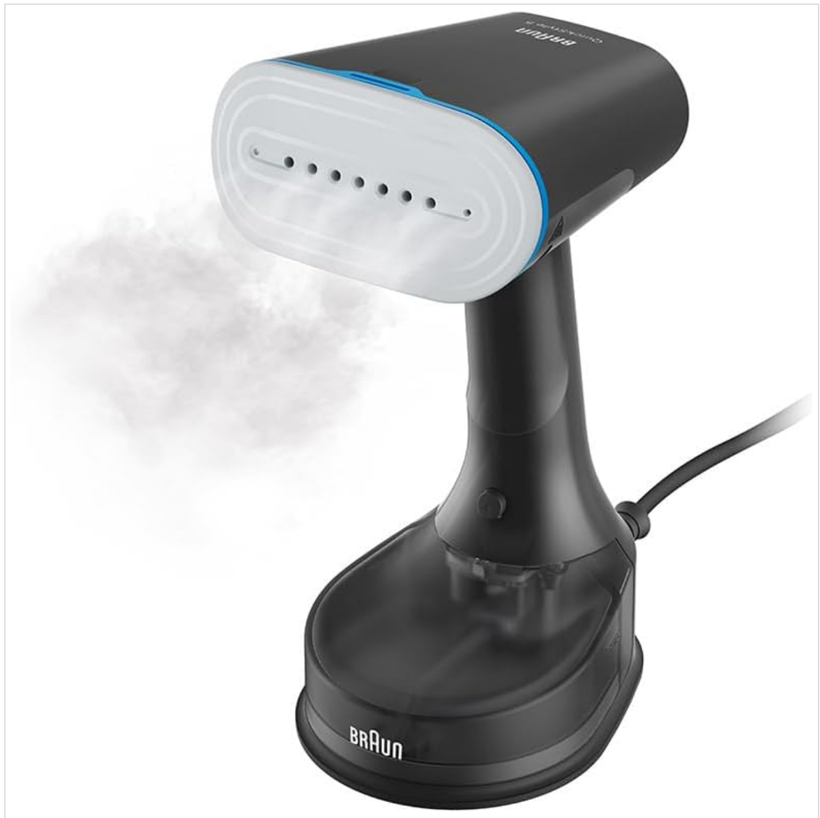
Figure 4: The Braun QuickStyle 5 steamer actively emitting steam from its head.