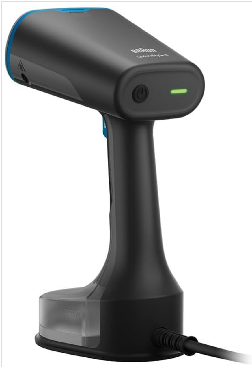
Figure 2: Back view of the steamer, highlighting the power button and indicator light.