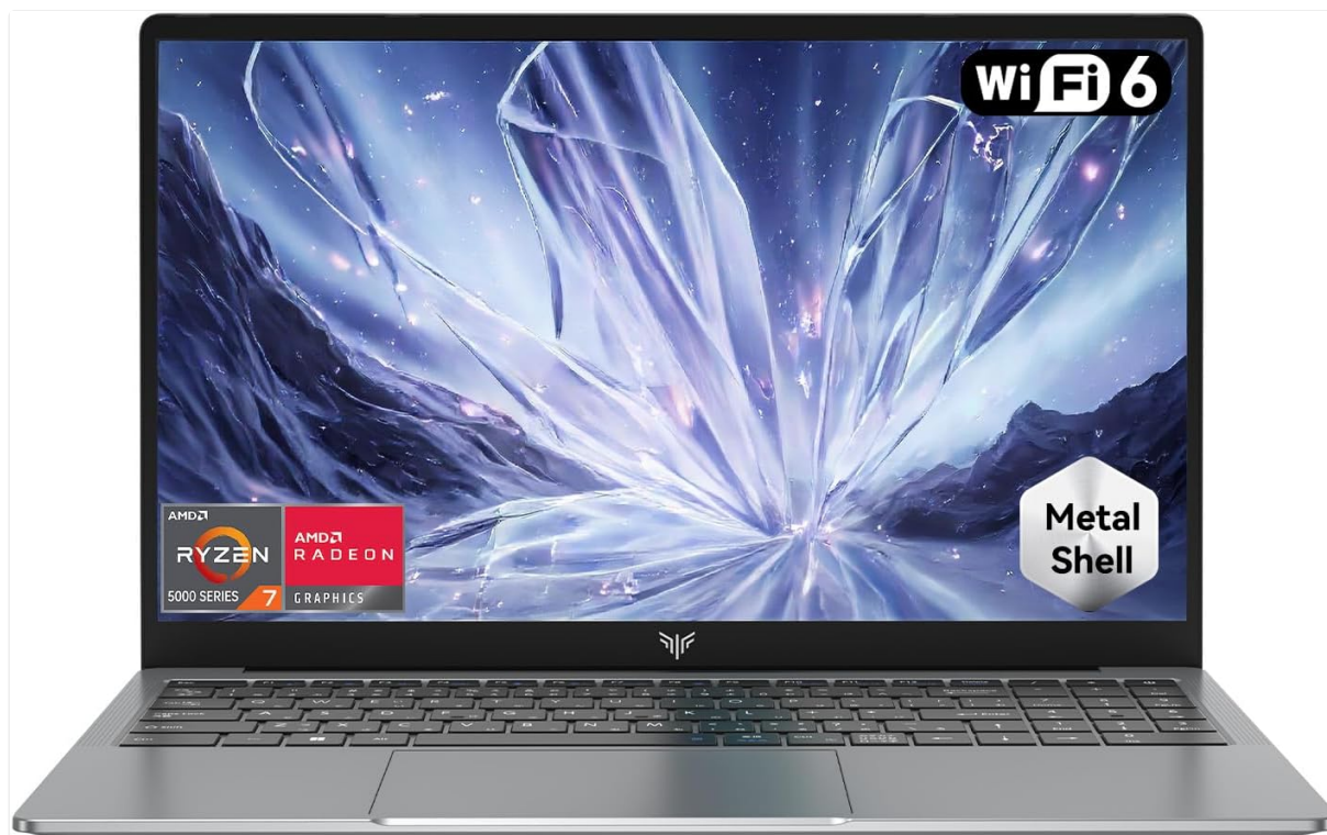
Image: Front view of the ACEMAGIC AX16 Pro laptop.

This manual provides essential information for setting up, operating, maintaining, and troubleshooting your ACEMAGIC AX16 Pro laptop. Please read this guide thoroughly to ensure optimal performance and longevity of your device.