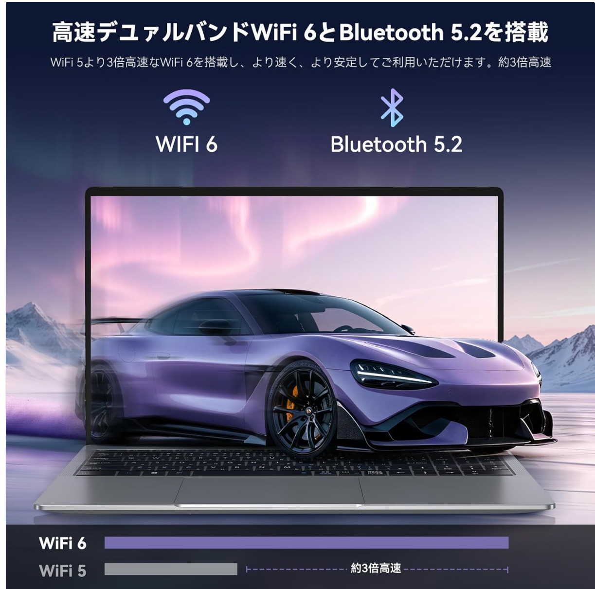
Image: Icons representing WiFi 6 and Bluetooth 5.2, indicating advanced wireless capabilities.

Utilize WiFi 6 for high-speed internet access and Bluetooth 5.2 for connecting wireless peripherals like headphones or speakers. These technologies provide stable and efficient wireless communication.