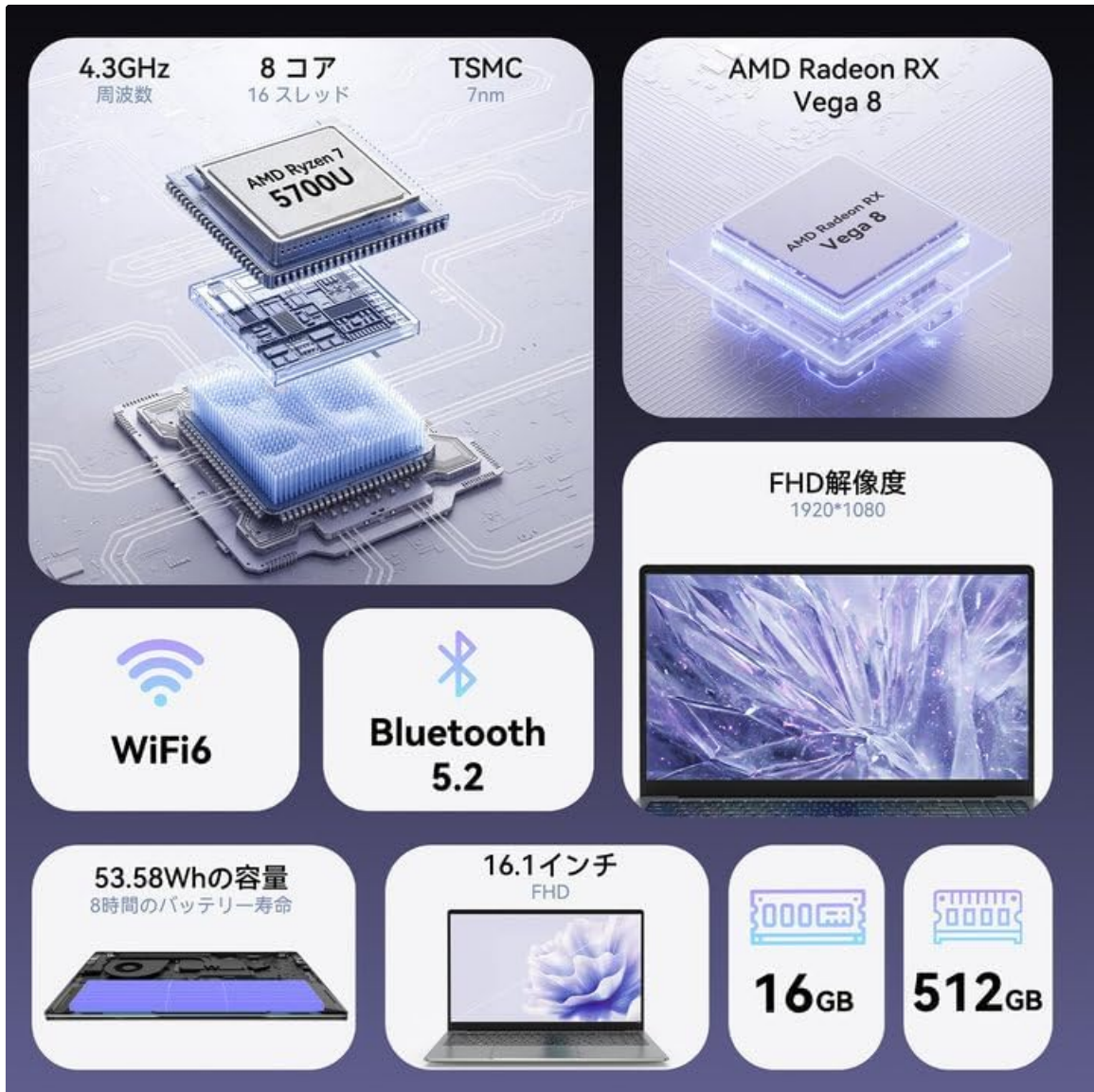
Image: Visual summary of the laptop's core specifications including CPU, GPU, RAM, SSD, display, and connectivity.