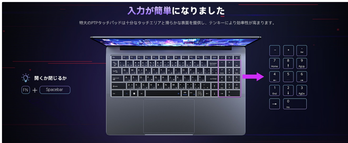
Image: Diagram illustrating the keyboard layout and touchpad area, with a focus on ease of input.

The laptop features a comfortable keyboard and a large touchpad for precise navigation. An included Japanese keyboard cover can be placed over the English layout for localized input.