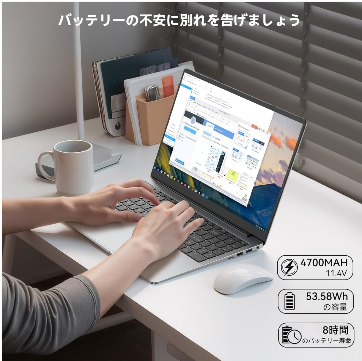
Image: Laptop in use on a desk, with icons indicating 4700mAh, 53.58Wh capacity, and 8 hours of battery life.