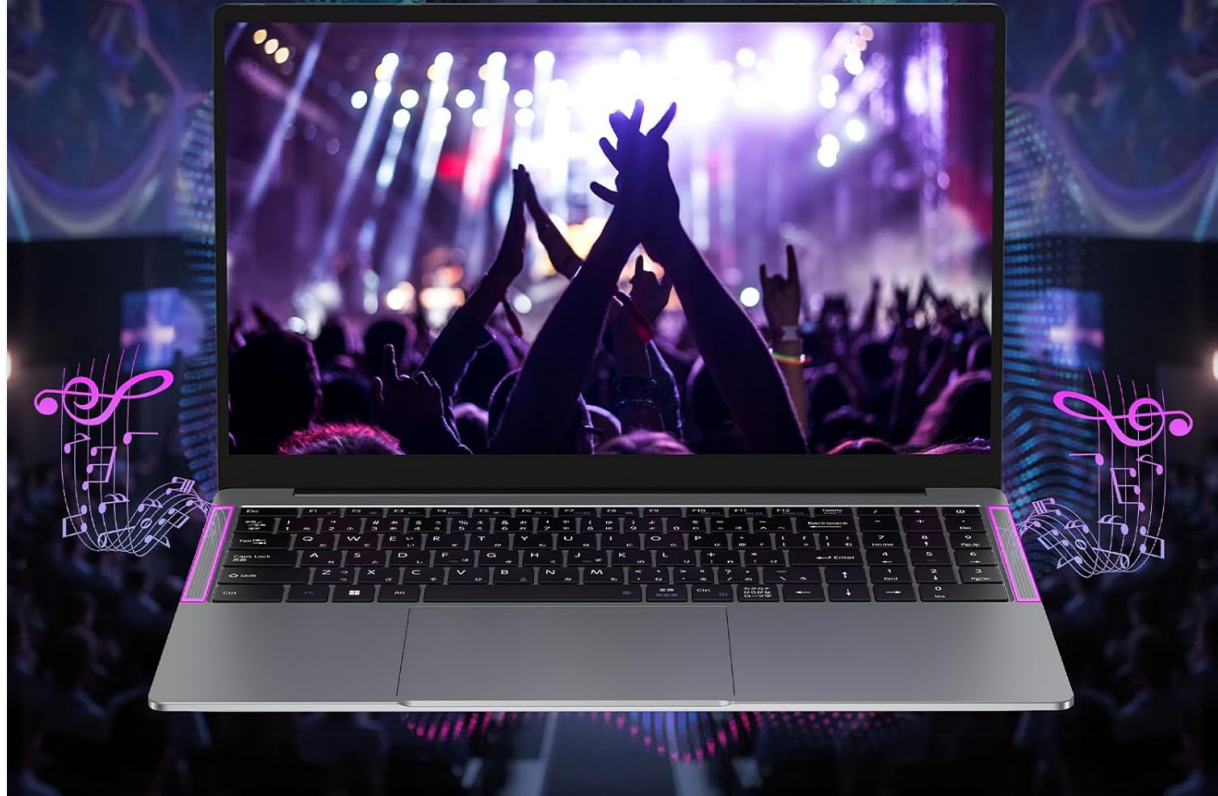
Image: Laptop displaying a concert scene, with visual cues indicating high-quality, immersive sound from dual speakers.