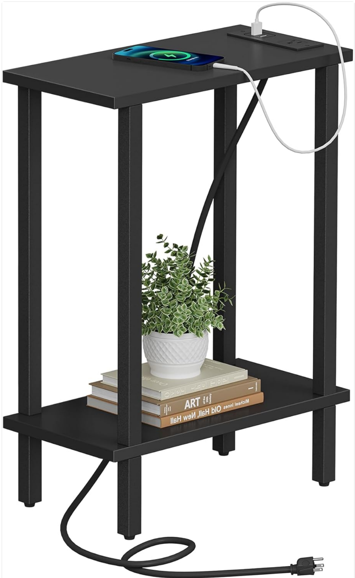
Image: The TUTOTAK Small End Table, featuring a black finish, two tiers, and an integrated charging station on the top surface.