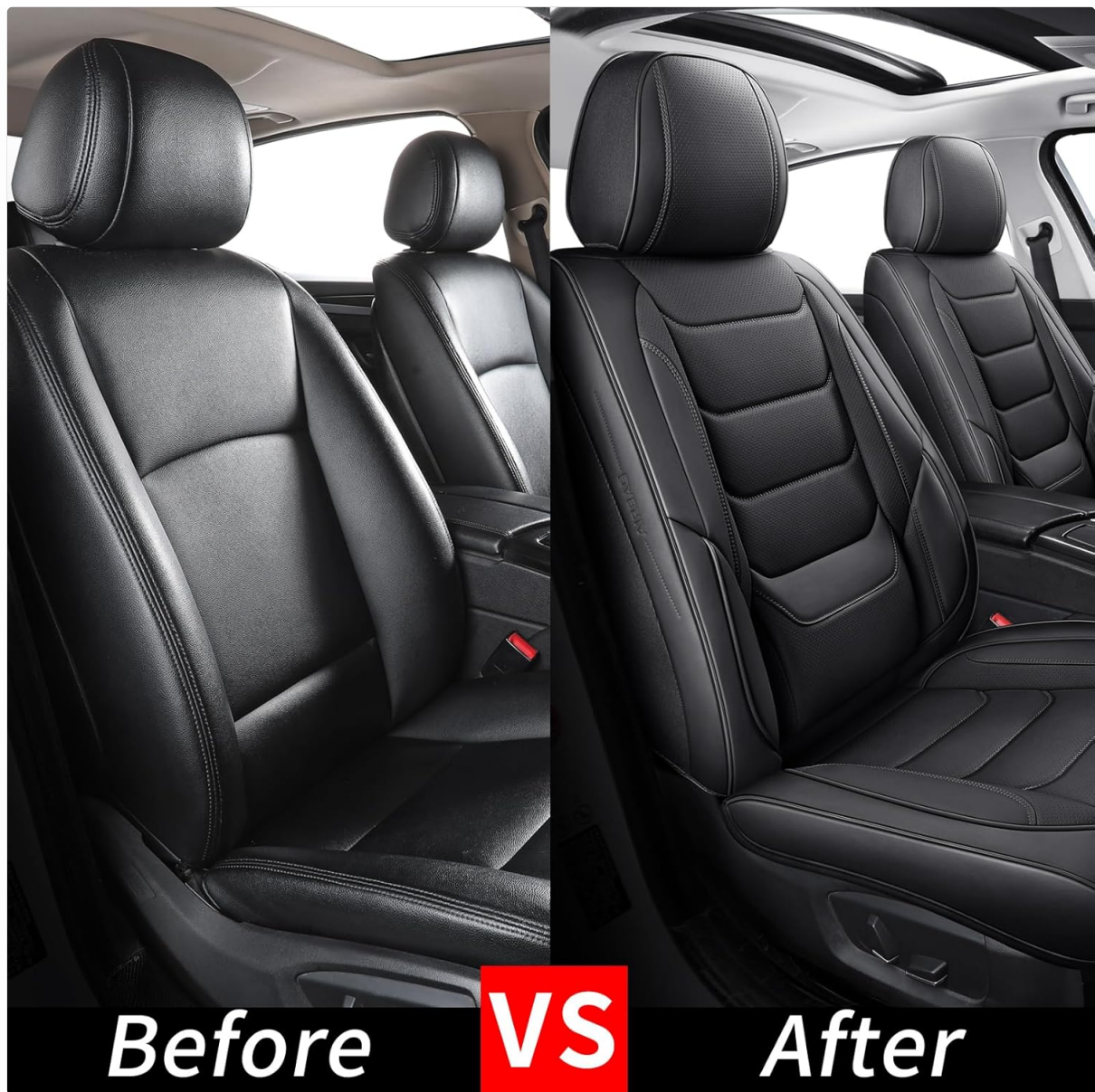
Before and after comparison illustrating the visual transformation upon installation.