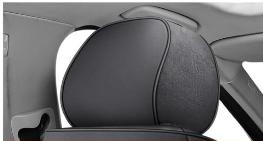
Detachable Headrest Cover