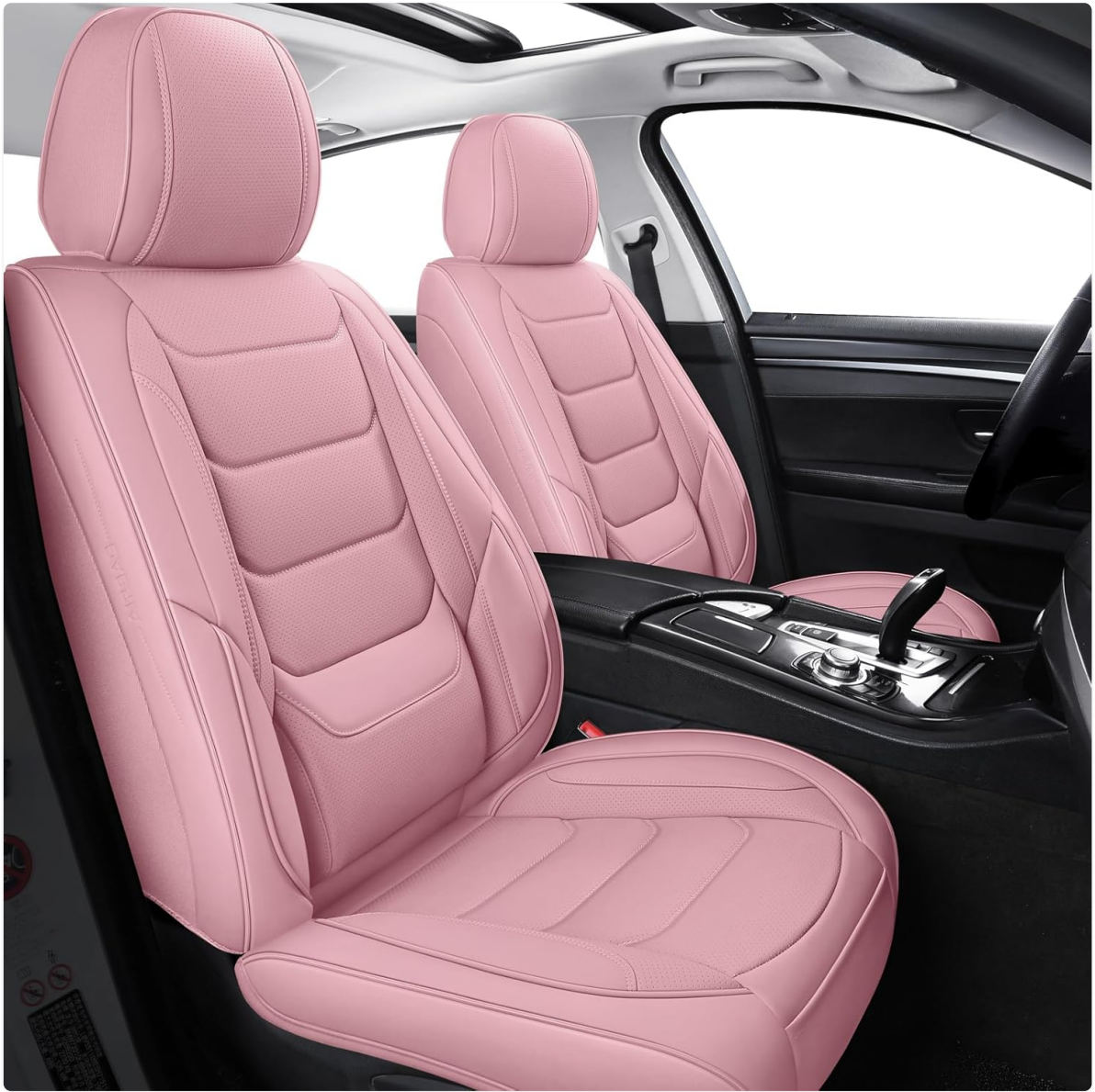
Image 3.3: View of a car interior with the pink hoozoom front seat covers successfully installed, showing a snug and tailored fit.