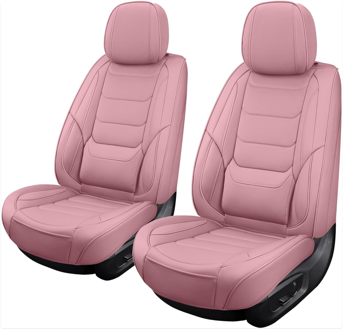
Image 1.1: A pair of hoozoom front seat covers in pink, showcasing their contoured design and perforated surface.