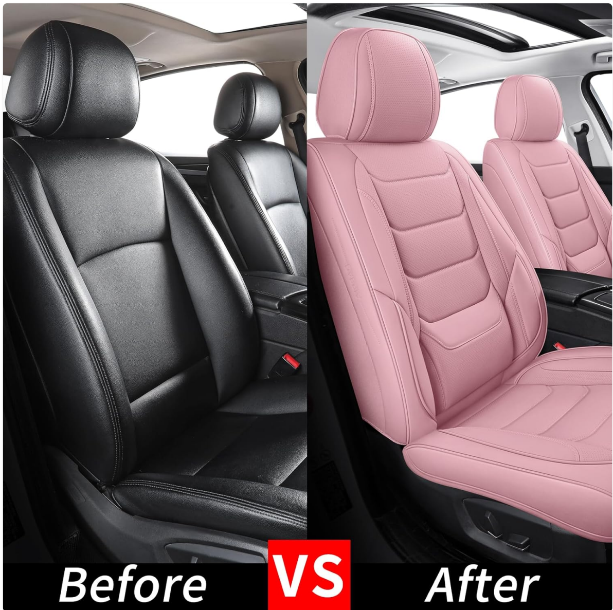
Image 3.6: A comprehensive view of a car interior with a full set of pink hoozoom seat covers installed, including front and rear seats.