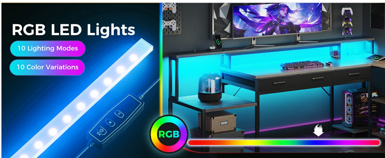
Figure 4: RGB LED Lights. This image illustrates the LED light strip and its controller, highlighting the 10 available lighting modes and 10 color variations for customizable ambient lighting.