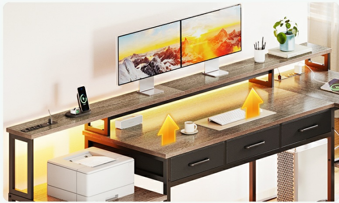
Figure 5: Ergonomic Monitor Stand. This image demonstrates how the elevated monitor stand helps maintain proper sitting posture, contrasting it with poor posture when a monitor is placed directly on the desk. It also shows the spacious design of the monitor stand.