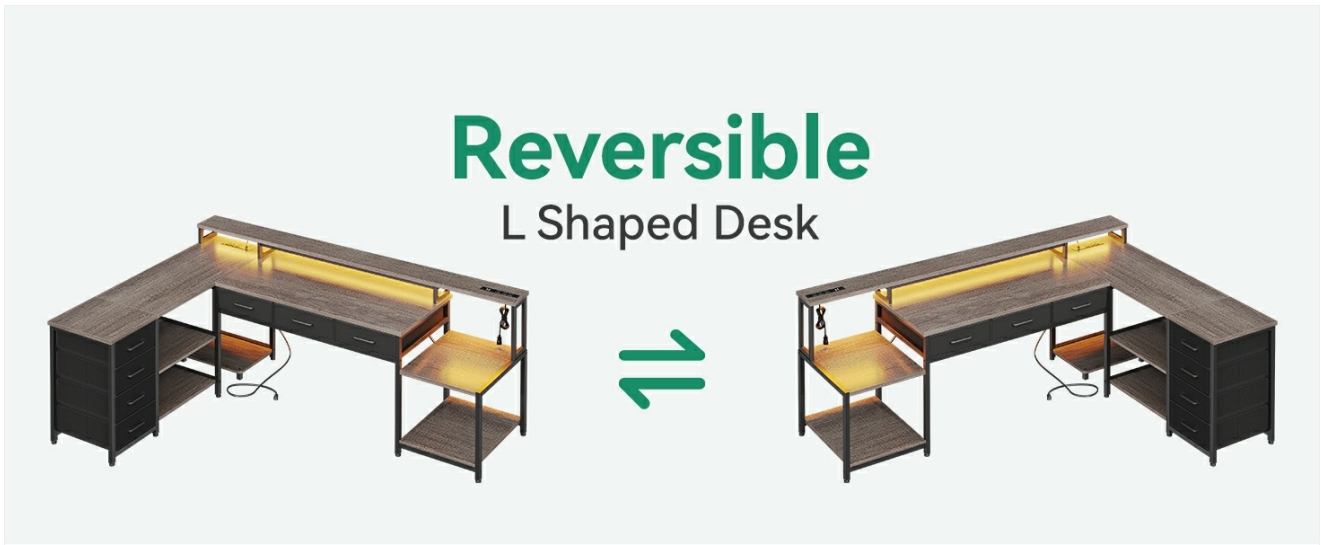
Figure 1: Reversible L-Shaped Desk Configuration. This image demonstrates the flexibility of the desk's design, allowing it to be assembled with the longer section on either the left or right side to fit your space.