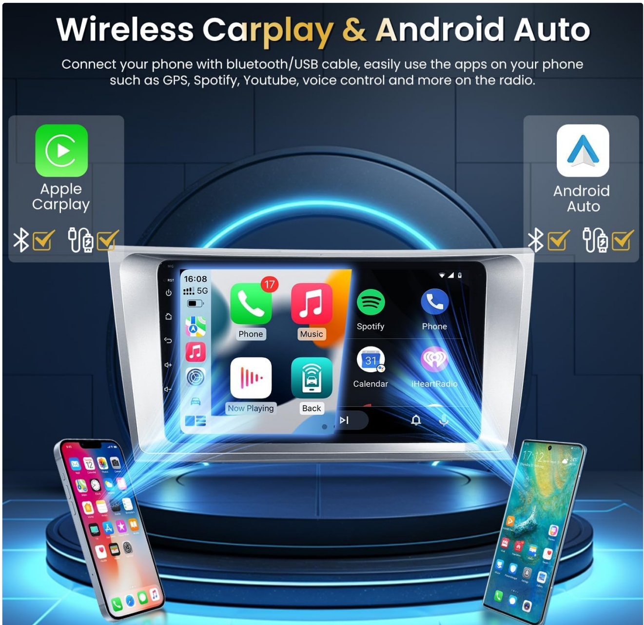
Image: The car radio display showing the Wireless CarPlay and Android Auto interface with various app icons.

Seamlessly integrate your smartphone for access to calls, messages, music, and navigation. Connect via Bluetooth or USB cable. Use Siri or Google Assistant for hands-free control.