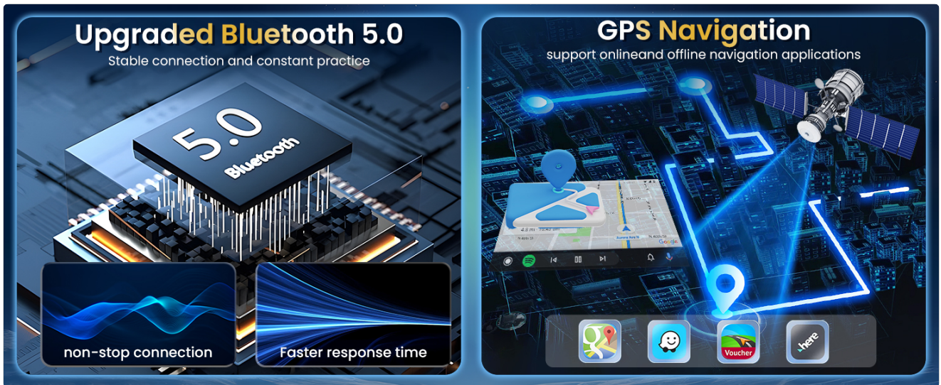
Image: The car radio display showing GPS navigation and icons for various apps that can be downloaded via 5G Wi-Fi.