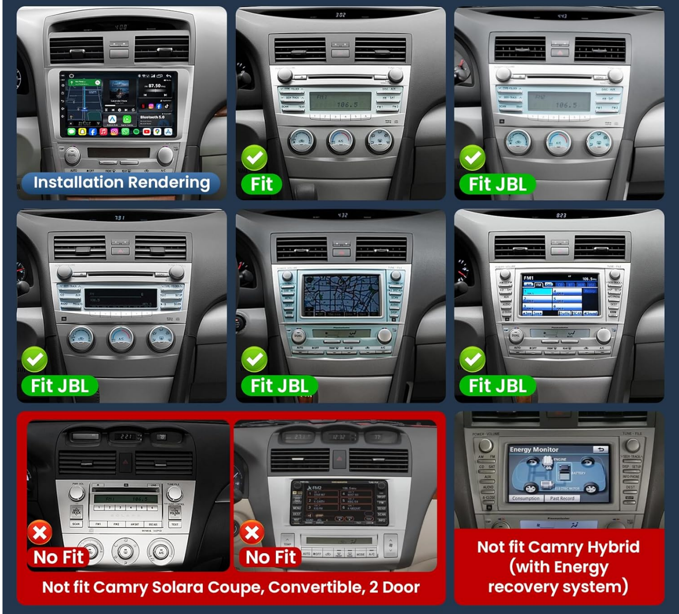
Image: Visual guide showing compatible and incompatible Toyota Camry dashboard configurations for the car radio.