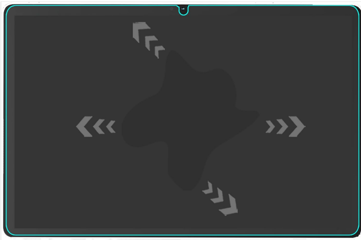
Image: A visual guide demonstrating how to effectively remove air bubbles from under the screen protector using a squeegee, pushing them towards the edges.