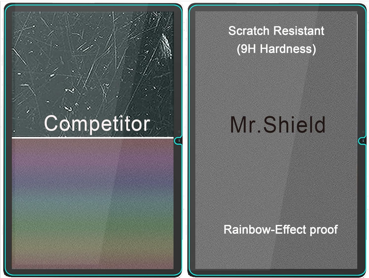
Image: A side-by-side comparison illustrating the superior scratch resistance and lack of rainbow effect on the Mr.Shield screen protector compared to a competitor's product.