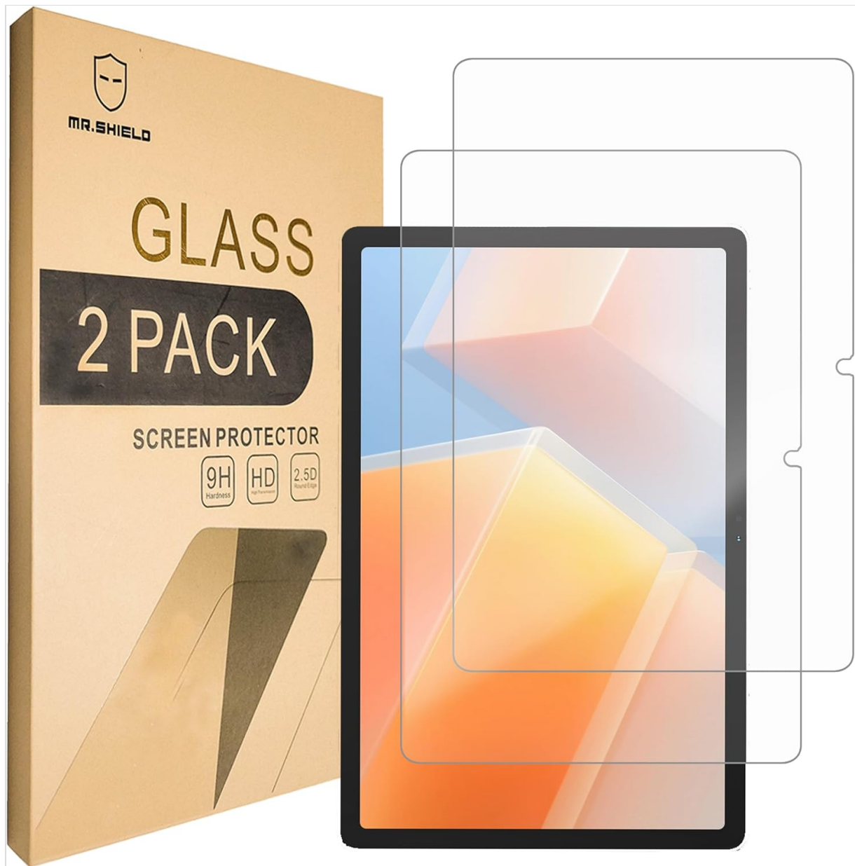
Image: The Mr.Shield screen protector packaging alongside a tablet with the screen protector applied.