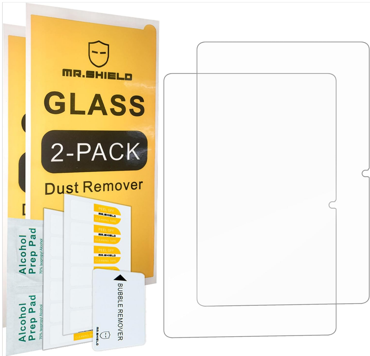
Image: All components included in the Mr.Shield screen protector kit, including two glass protectors, alcohol pads, and dust removal stickers.