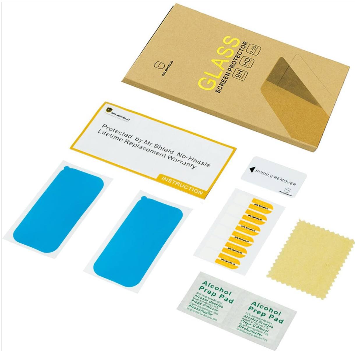
Image: The instruction card included in the package, detailing the Mr.Shield No-Hassle Lifetime Replacement Warranty.