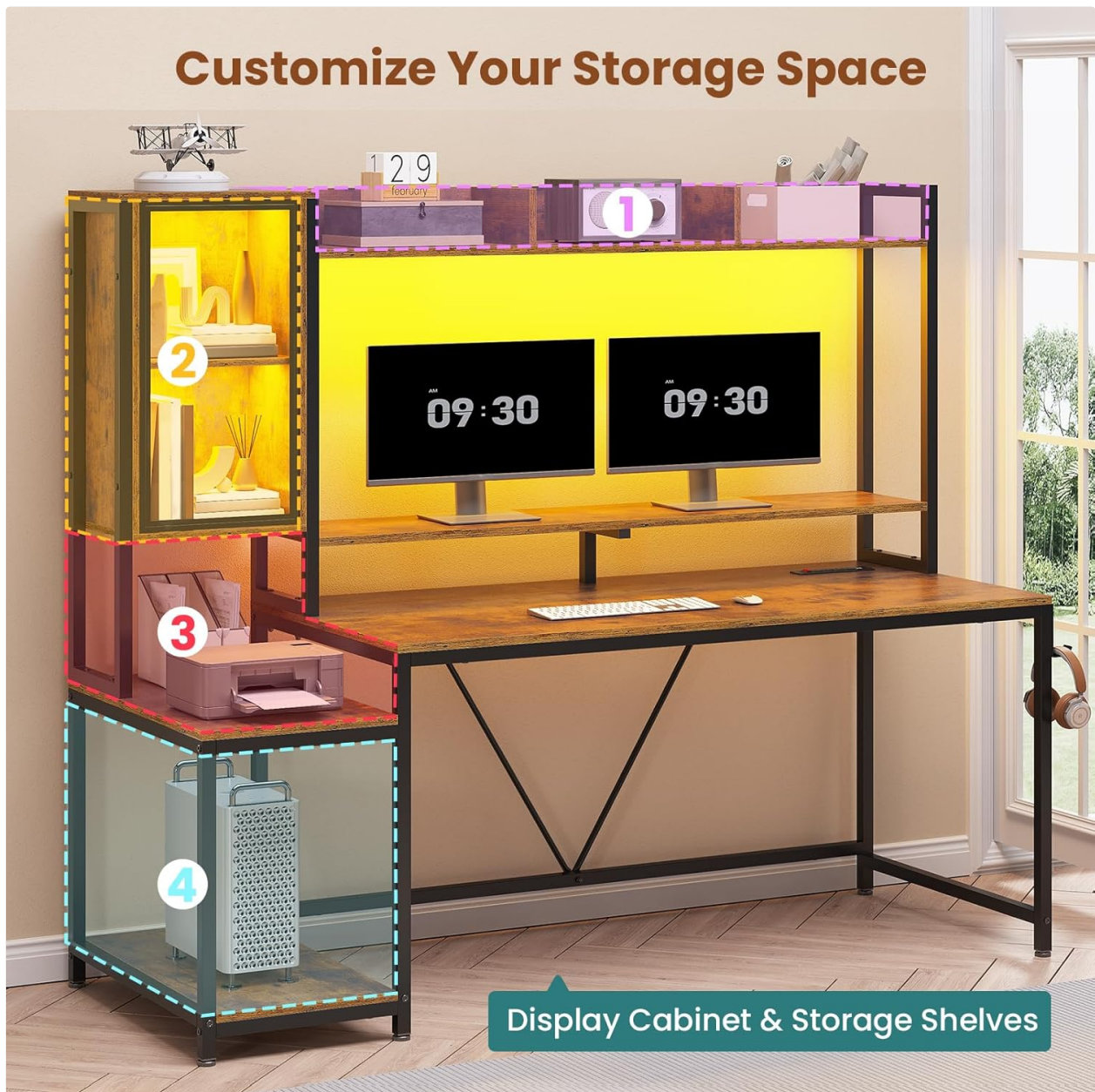
Figure 5.1.2: Visual representation of the customizable storage options, highlighting the display cabinet and various shelves.