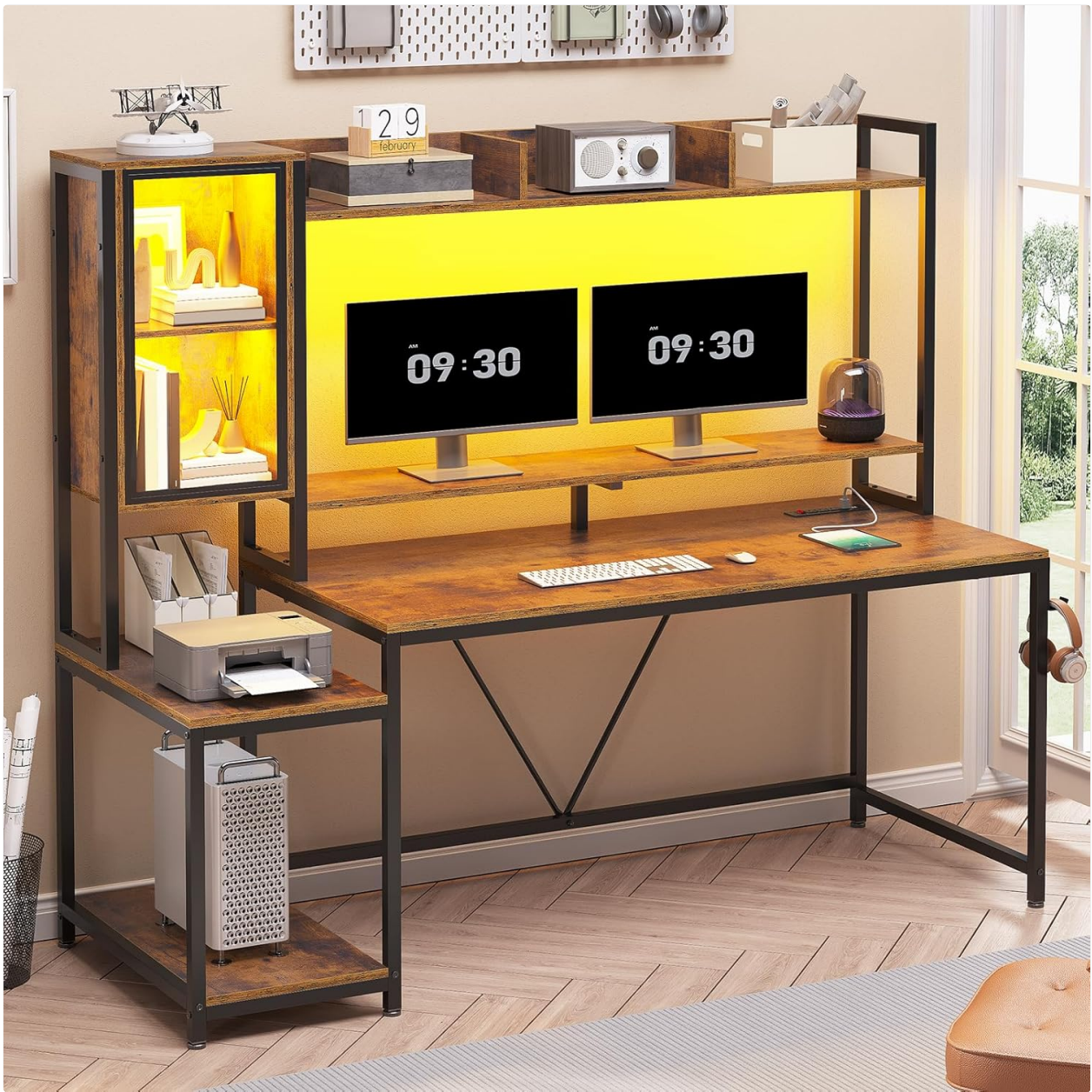
Figure 5.1.1: The desk's hutch and shelves provide organized storage for various items, including gaming accessories and decorative pieces.