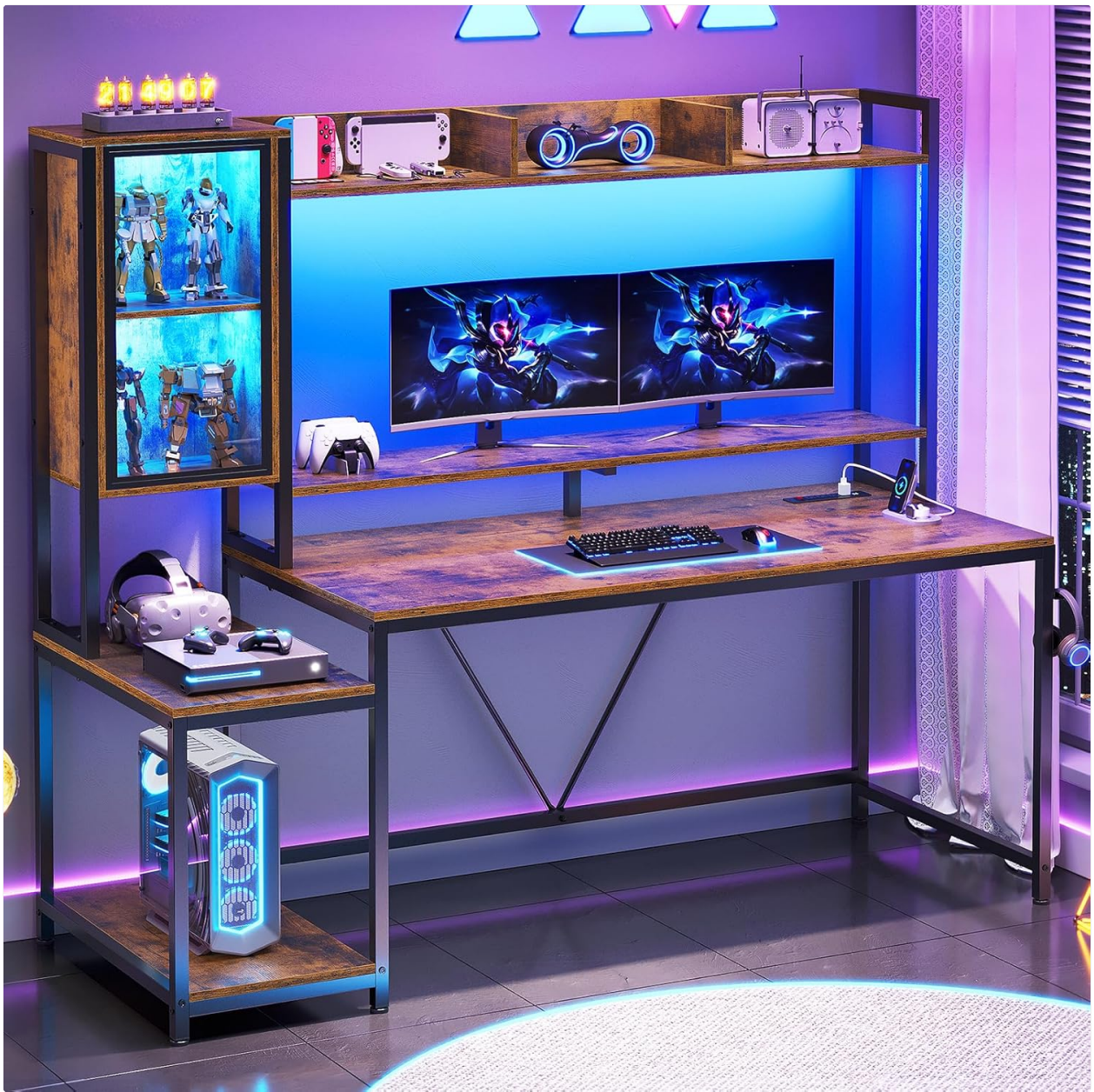
Figure 1.1: SEDETA 60-inch Gaming Desk, showcasing its hutch, LED lighting, and spacious design.