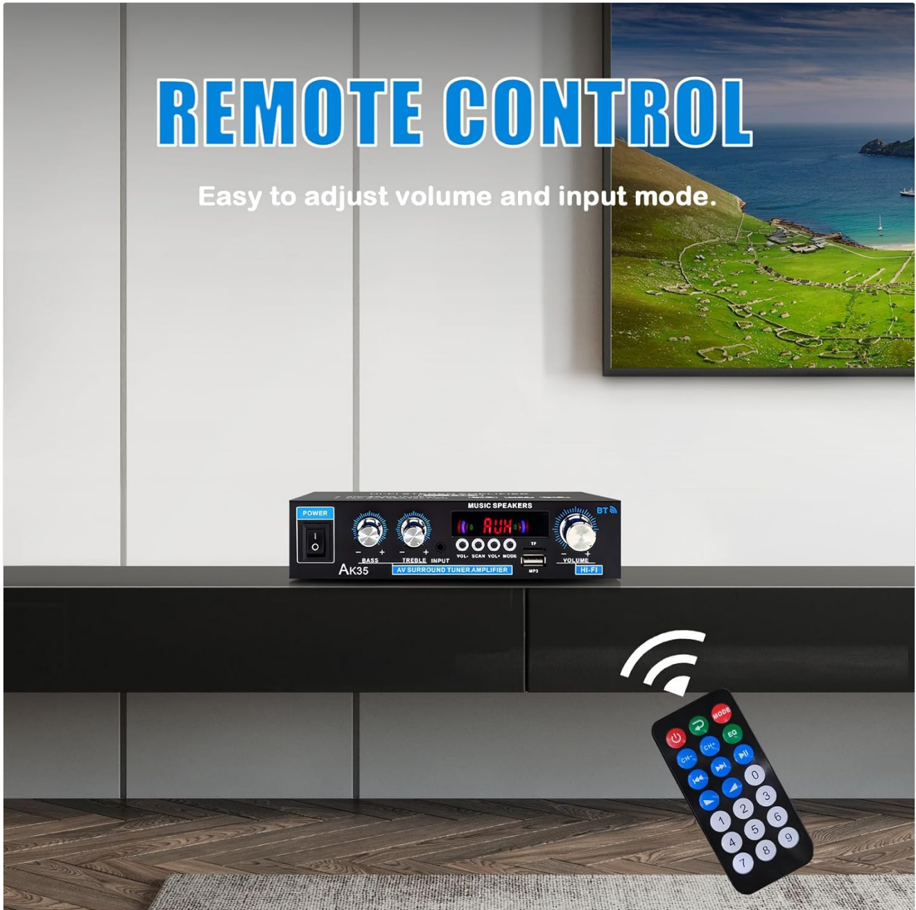
Image: The remote control for the AK35 amplifier, featuring buttons for power, mode, EQ, volume, track control, and number pad.

The included remote control allows for convenient adjustment of volume, input mode, track selection, and other functions from a distance.