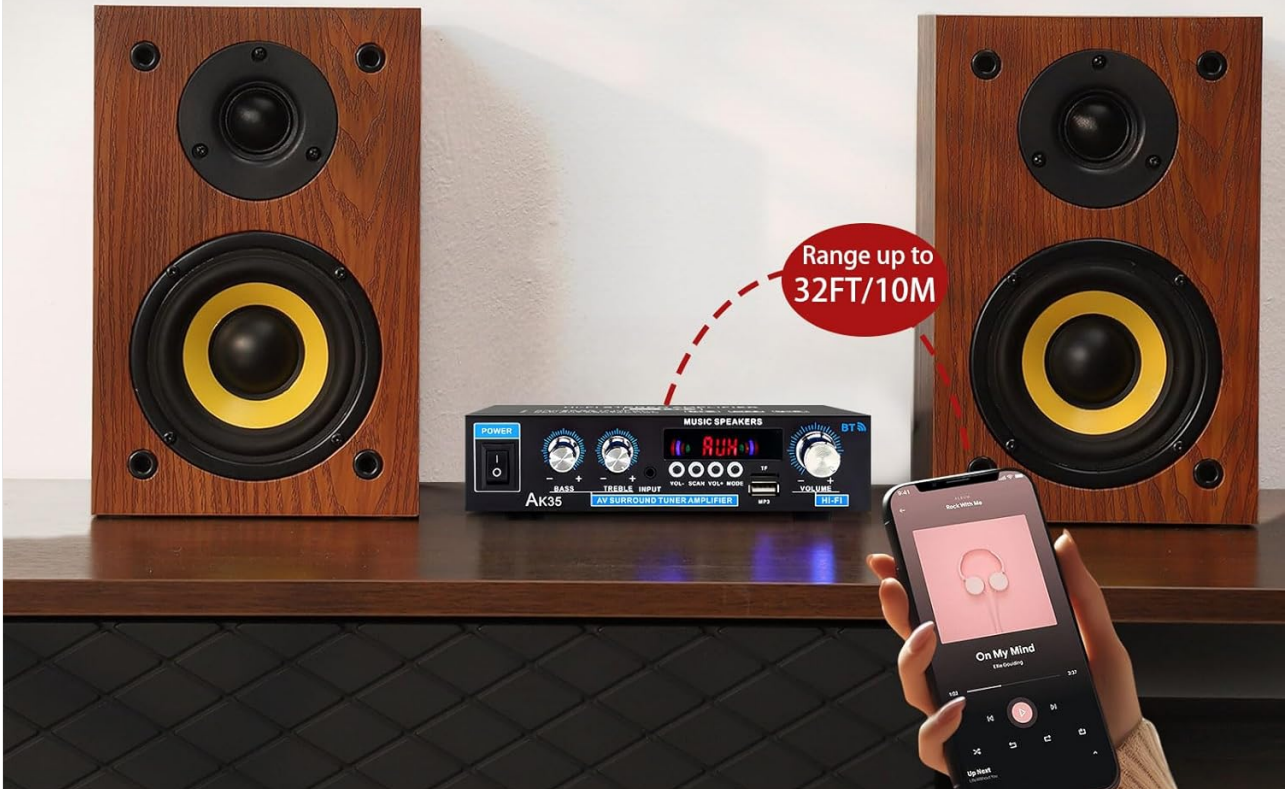
Image: Front panel of the AK35 amplifier, showing the power switch, bass and treble knobs, audio input, LED display, function buttons, TF/USB port, and master volume control.