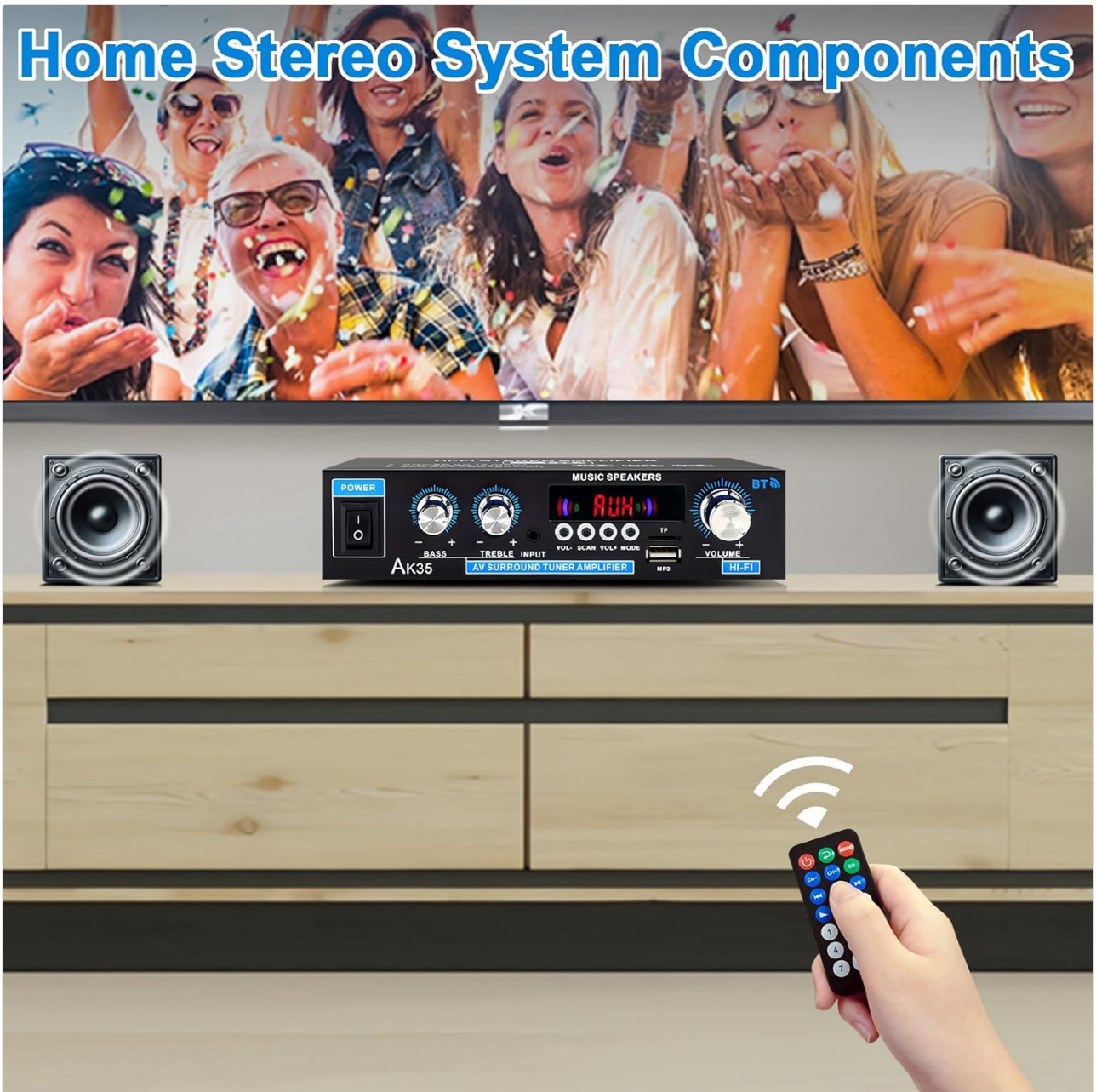
Image: The AK35 amplifier wirelessly streaming music via Bluetooth 5.0 from a smartphone to connected speakers.