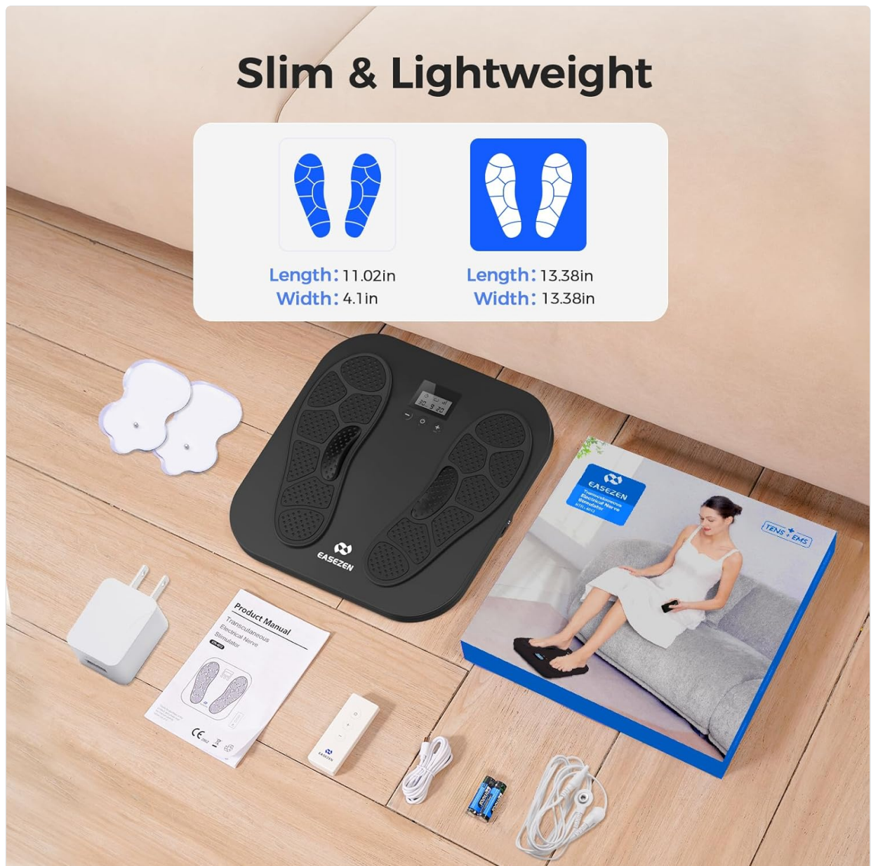
Image: The EaseZen Foot Massager unit, remote control, electrode pads, electrode cables, and USB charging cable are included in the package.

The EaseZen Foot Massager is designed for user comfort and convenience, featuring an ergonomic curved sole design and a clear LCD display. It is slim and lightweight for easy portability.