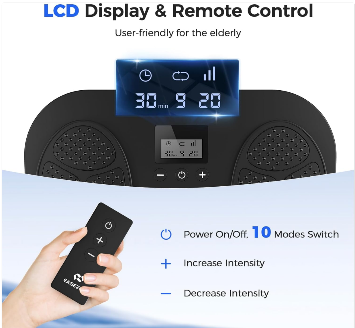
Image: Close-up of the LCD display and remote control, highlighting user-friendly buttons for power, mode, and intensity adjustments.

Video: Official product video demonstrating the EaseZen 2025 Upgraded Foot Massager for Neuropathy, showcasing its features and ease of use.