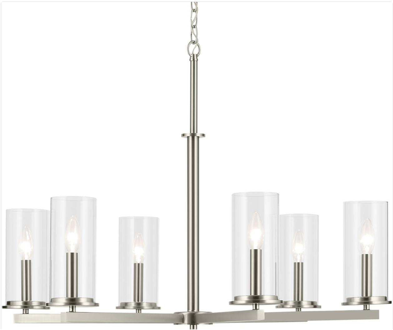
Image 1: Front view of the KICHLER Crosby 6-Light Chandelier in Brushed Nickel with clear glass shades.