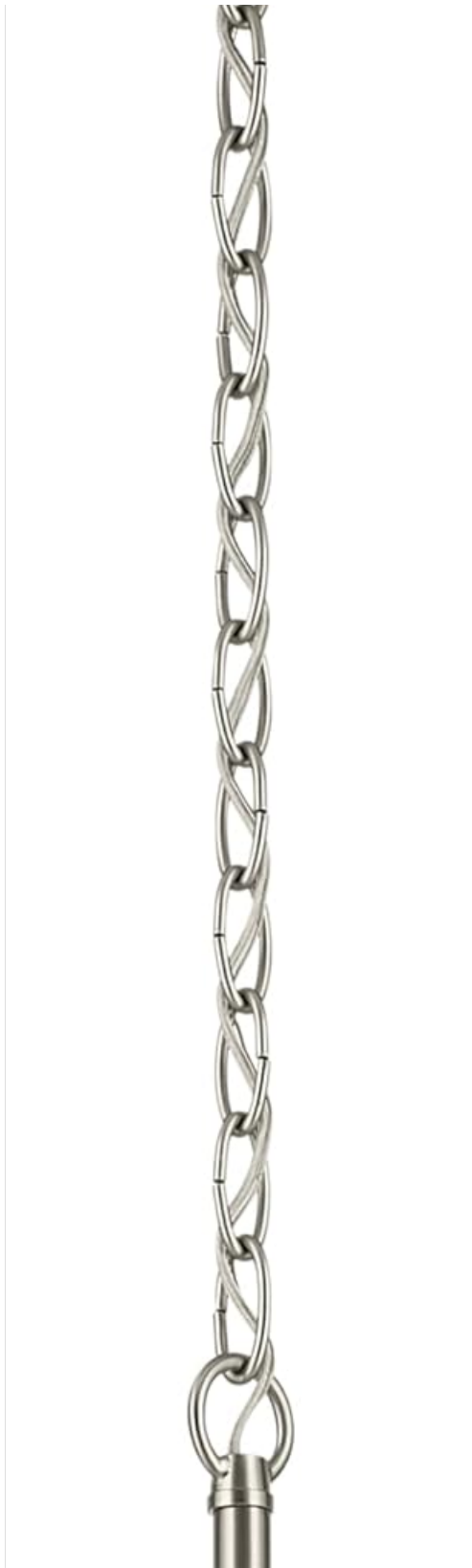
Image 3: Detail of the chandelier's chain and canopy, illustrating components for ceiling mounting.