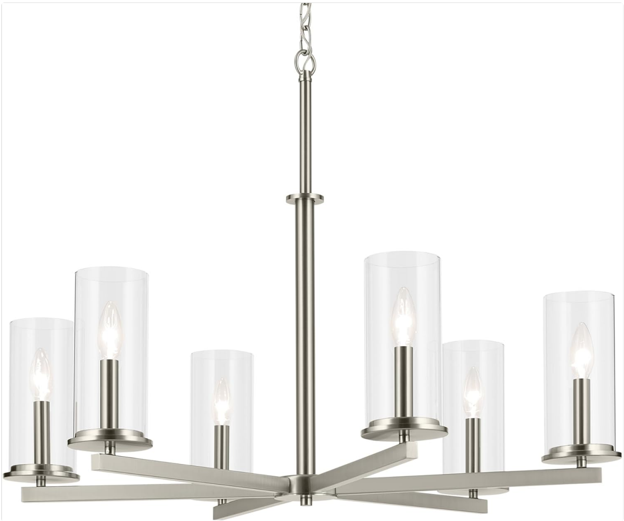
Image 2: Assembled view of the KICHLER Crosby Chandelier, showing all main components.