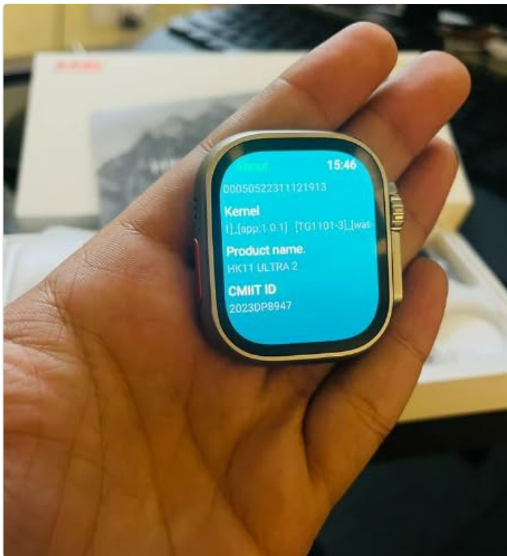
Figure 3: Smart Watch Display. This image shows the smartwatch screen displaying system information, including Kernel version, Product name (HK11 Ultra 2), and CMIIT ID.