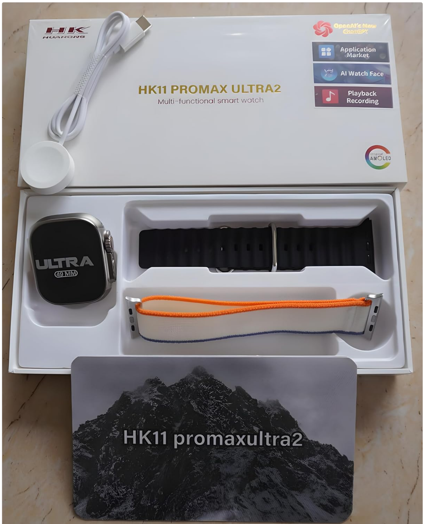
Figure 1: Package Contents. The image displays the Hk11 Pro Max Ultra 2 Smart Watch, two pairs of interchangeable straps, and the wireless charging puck, all neatly arranged within the product packaging.