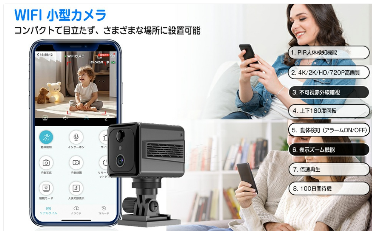
Image: Illustration of the two-way audio feature, allowing communication with family members or visitors through the camera.

The camera supports two-way voice communication. Tap the microphone icon in the app to speak through the camera, and listen through your smartphone's speaker.