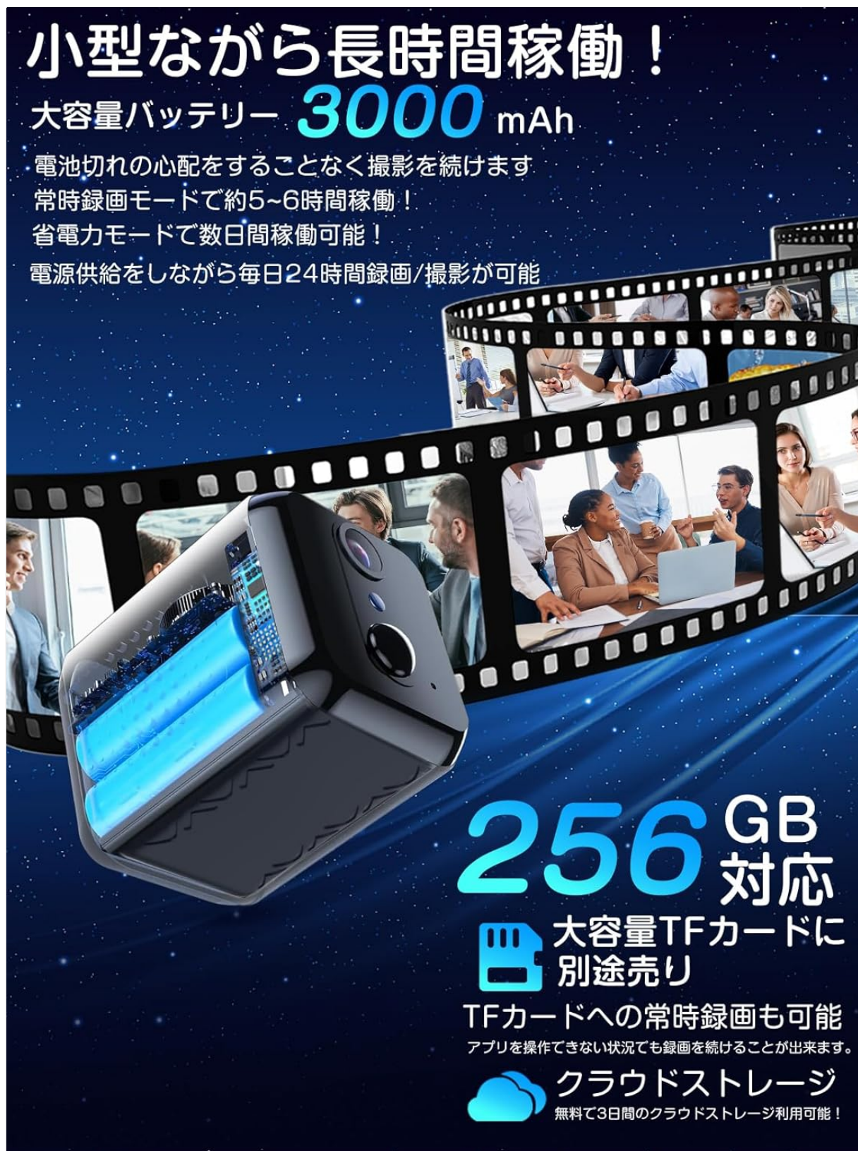
Image: Highlights the camera's large battery capacity (3000mAh) and support for up to 256GB MicroSD card, enabling long recording durations.