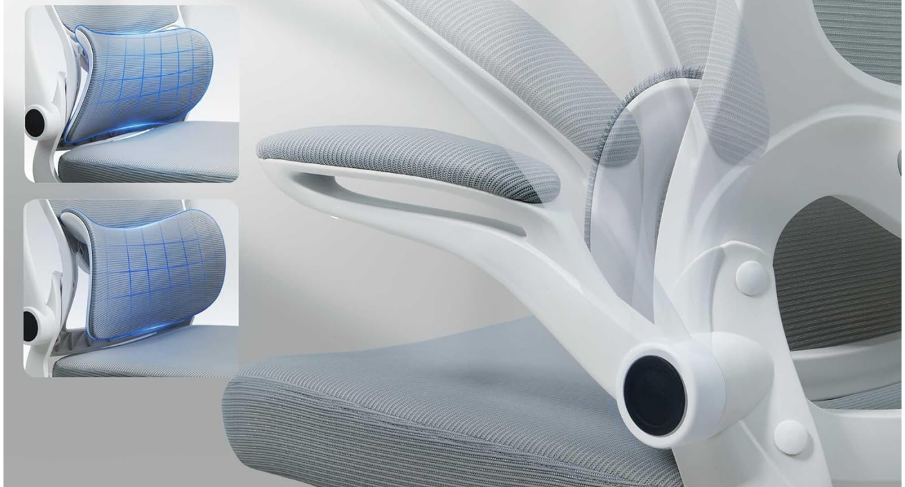
Figure 4: Adaptive lumbar support for personalized comfort.

Adjusts to the movement of your waist, providing dynamic support