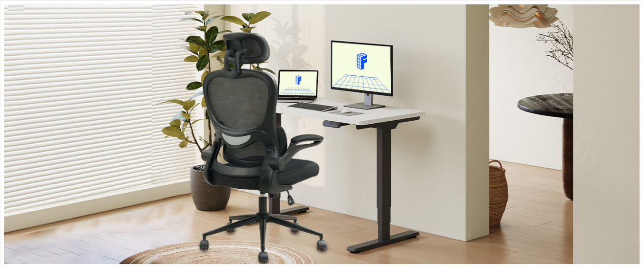
Figure 5: Chair with armrests flipped up for space-saving storage.