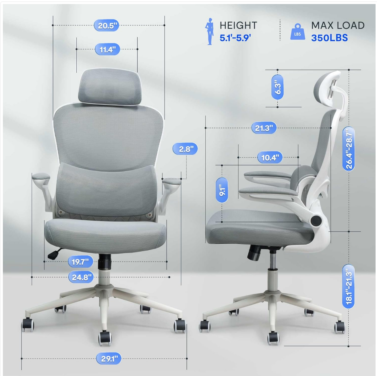
Figure 2: Assembled chair with key dimensions for reference.