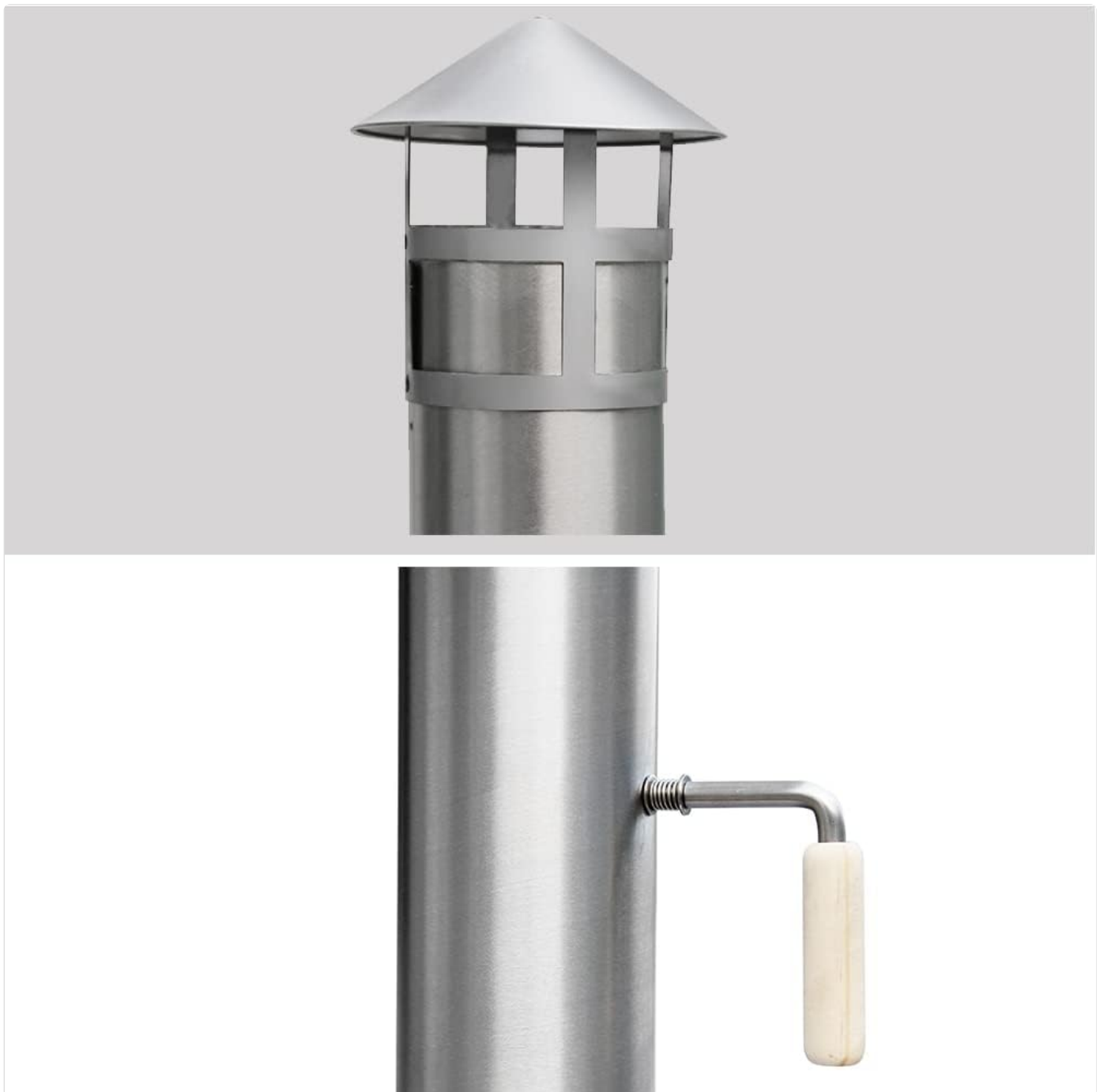
Figure 4.2: Detailed view of the oven's chimney, highlighting the damper handle for controlling airflow and heat retention.