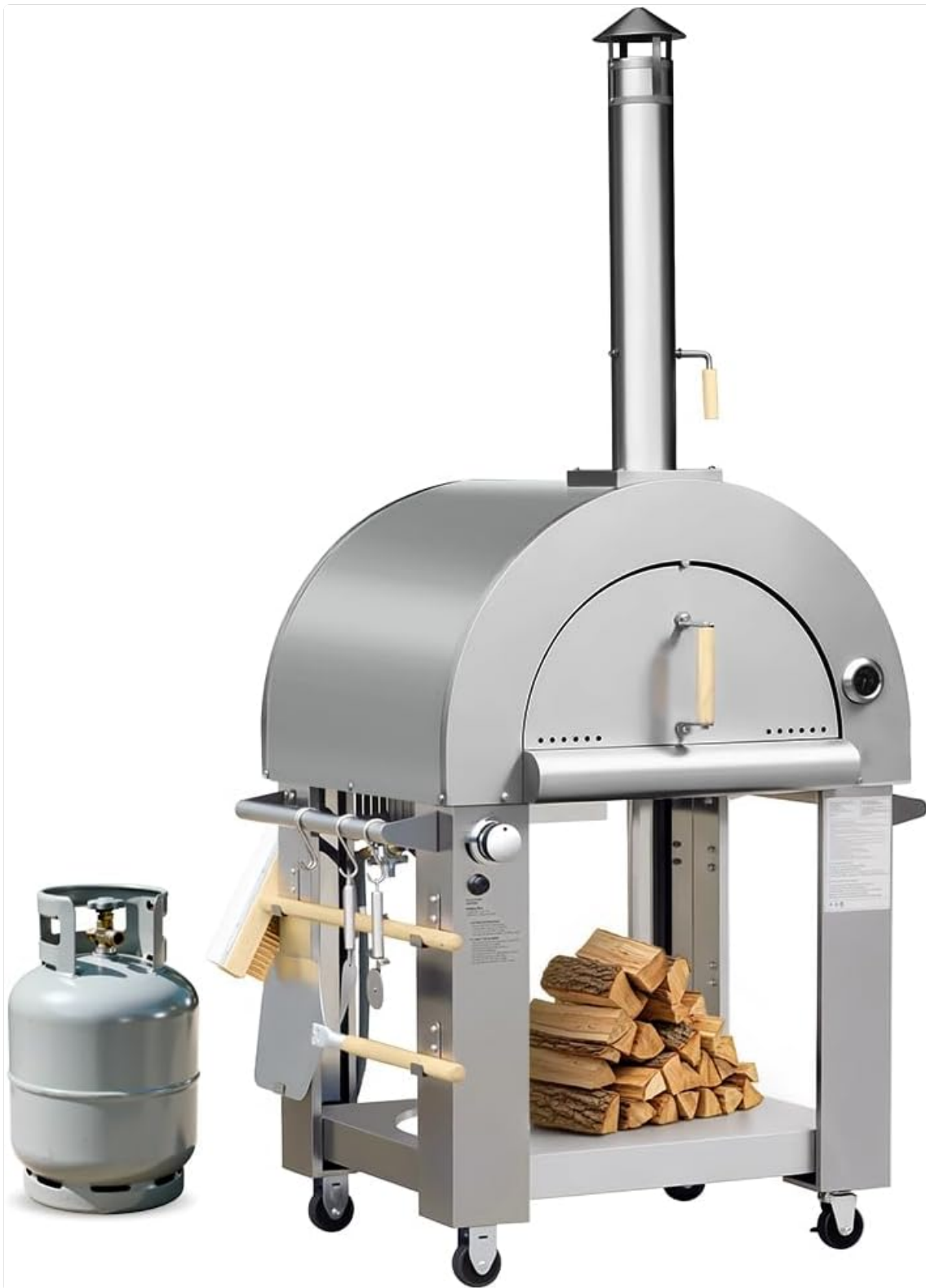
Figure 2.1: KOSTCH 32.5-inch Multi-Fuel Outdoor Pizza Oven with propane tank and wood fuel, showcasing its dual-fuel capability and included accessories.