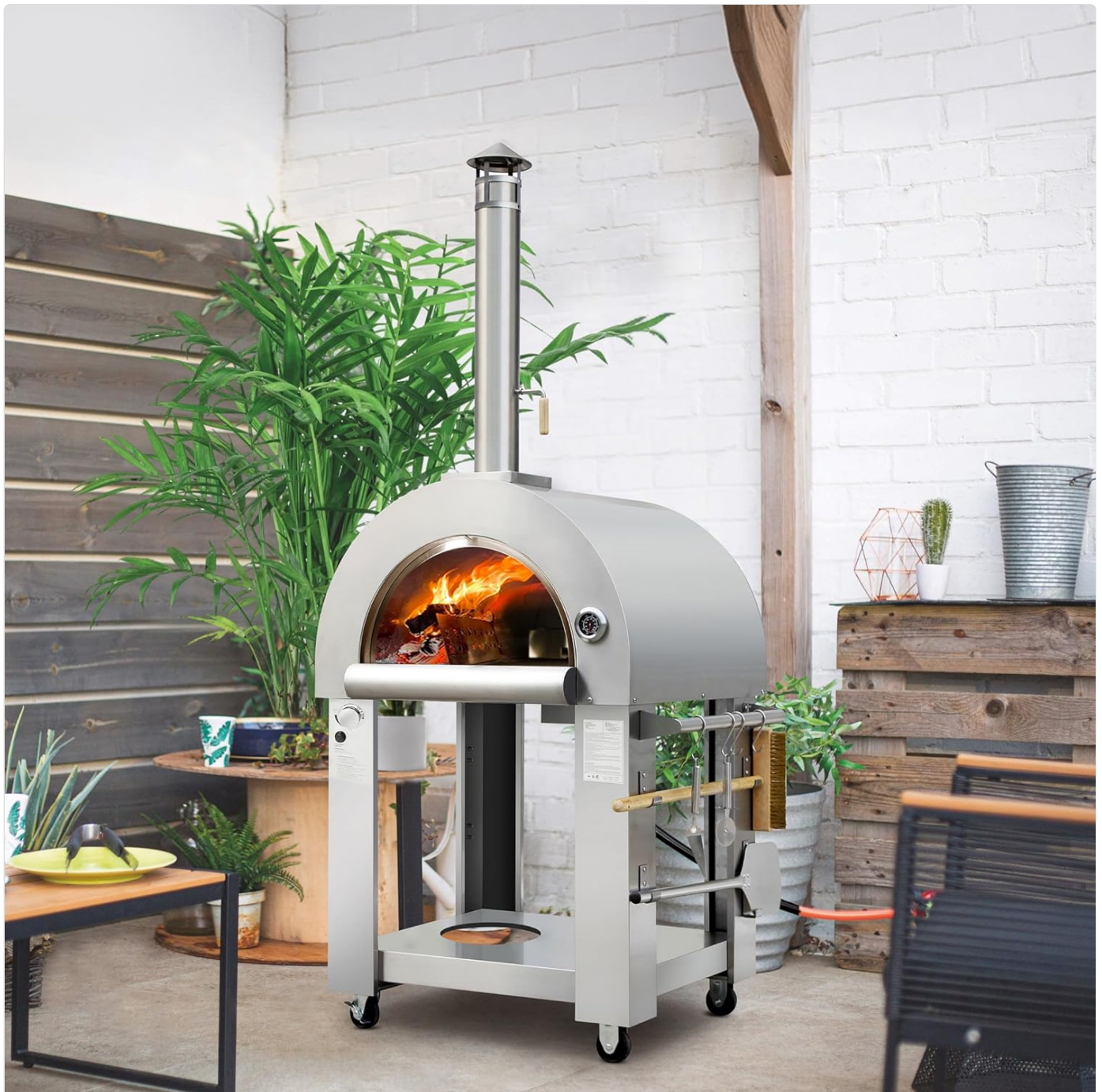
Figure 4.1: The KOSTCH pizza oven positioned in an outdoor patio, demonstrating a typical operational setup with a visible internal fire.