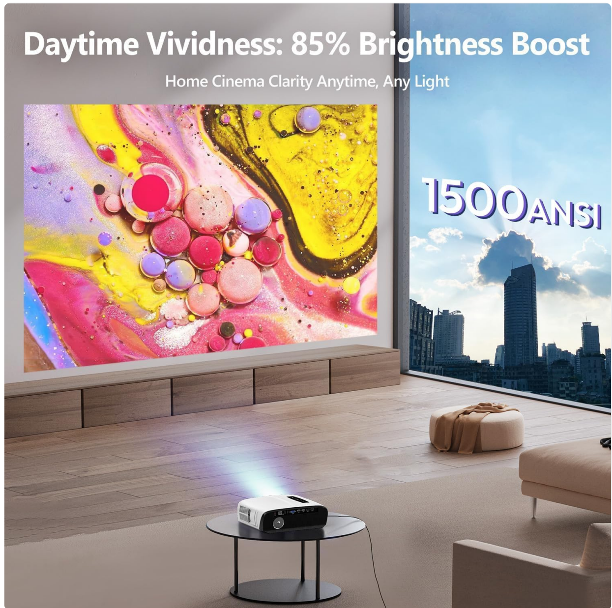
Image: The projector casting a bright, clear image on a wall in a room with ample natural light, highlighting its 1500ANSI brightness for daytime viewing.