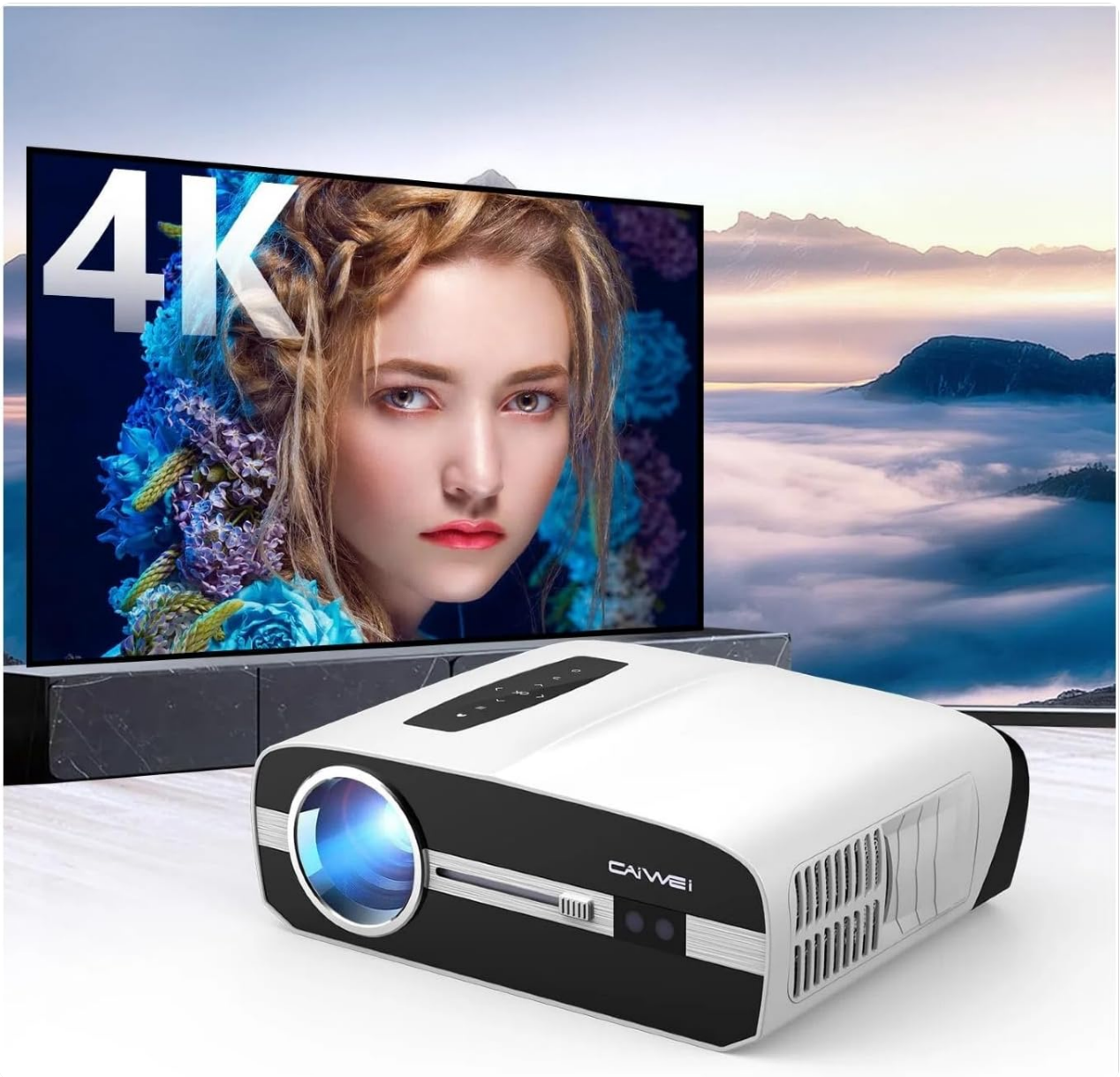
Image: The EUG Ultra HD Projector displaying a high-resolution 4K image on a large screen, demonstrating its visual clarity.