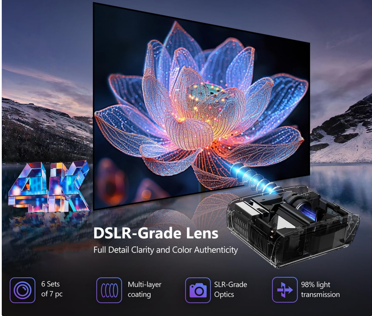
Image: An exploded view diagram illustrating the projector's internal components, emphasizing its 4K decoding capabilities and DSLR-grade lens for superior image quality.