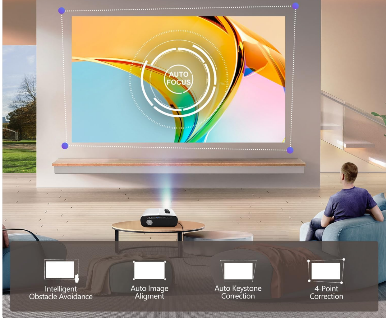
Image: The projector demonstrating its auto-focus and keystone correction features, showing how it automatically adjusts the image for optimal clarity and shape.

Place it anywhere without position restrictions