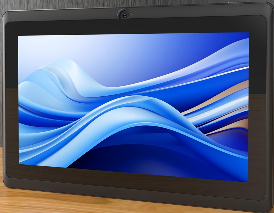
Image 1.1: Front view of the WUIUHOU Q8 tablet, illustrating its 7-inch display, Android OS, IPS screen, 2.0MP/8.0MP cameras, 4GB RAM, 32GB ROM, and 2.4G Wi-Fi capabilities.