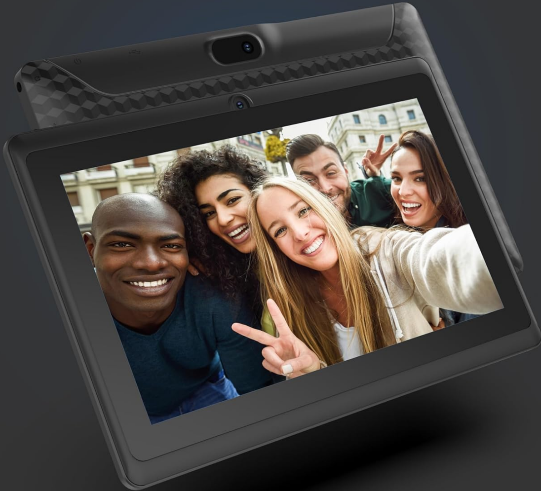
Image 4.3: The tablet being used to take a photo, demonstrating the functionality of its dual cameras (2MP front, 5MP rear).