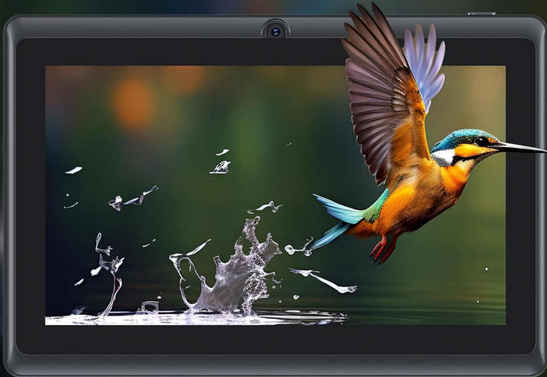
Image 4.2: The tablet display showcasing vibrant colors and clarity, emphasizing the 7-inch IPS HD screen with 1024x600 resolution.