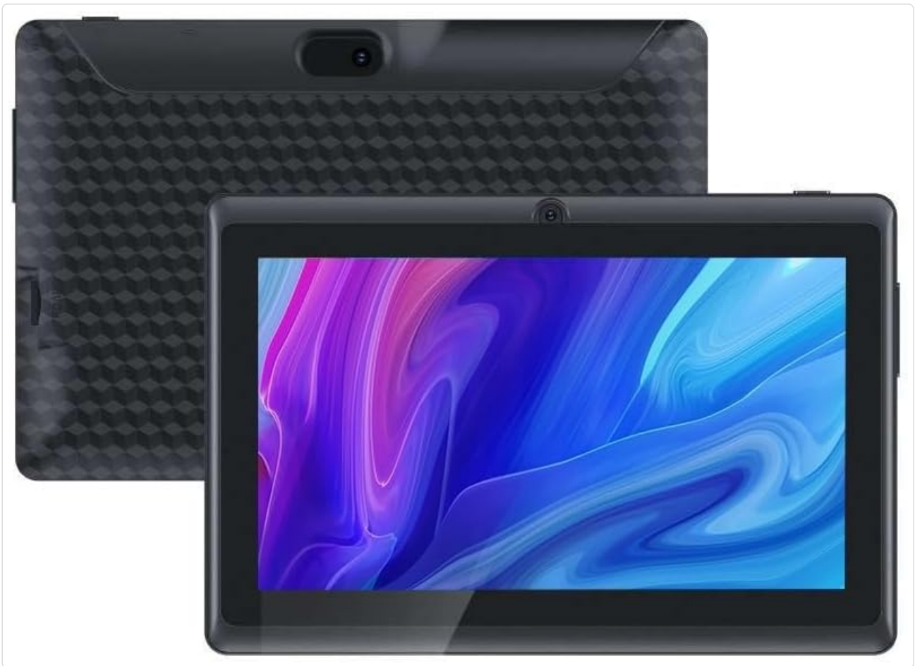
Image 2.1: Front and rear views of the WUIUHOU Q8 tablet, showing the display, front camera, rear camera, and textured back panel.

Familiarize yourself with the tablet's physical features: