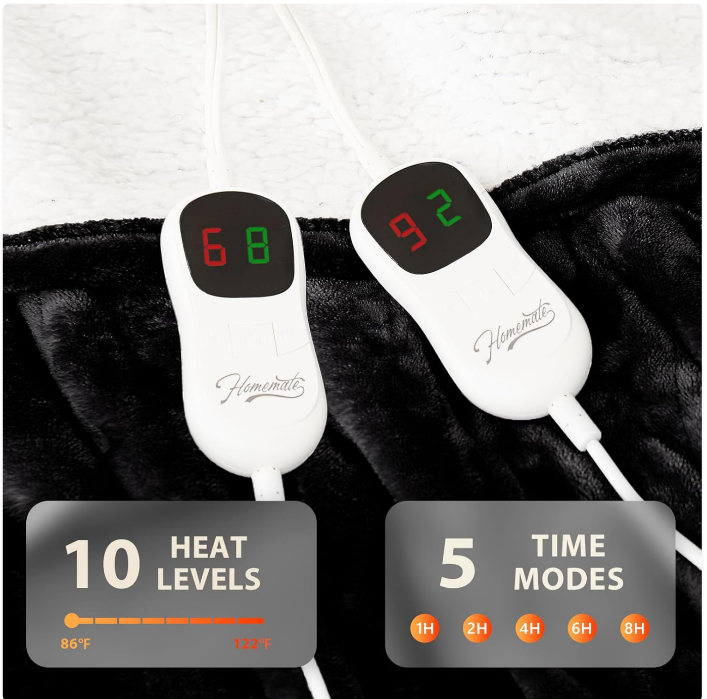
Image: Close-up of the digital controllers, highlighting the 10 heat levels and 5 time modes available.