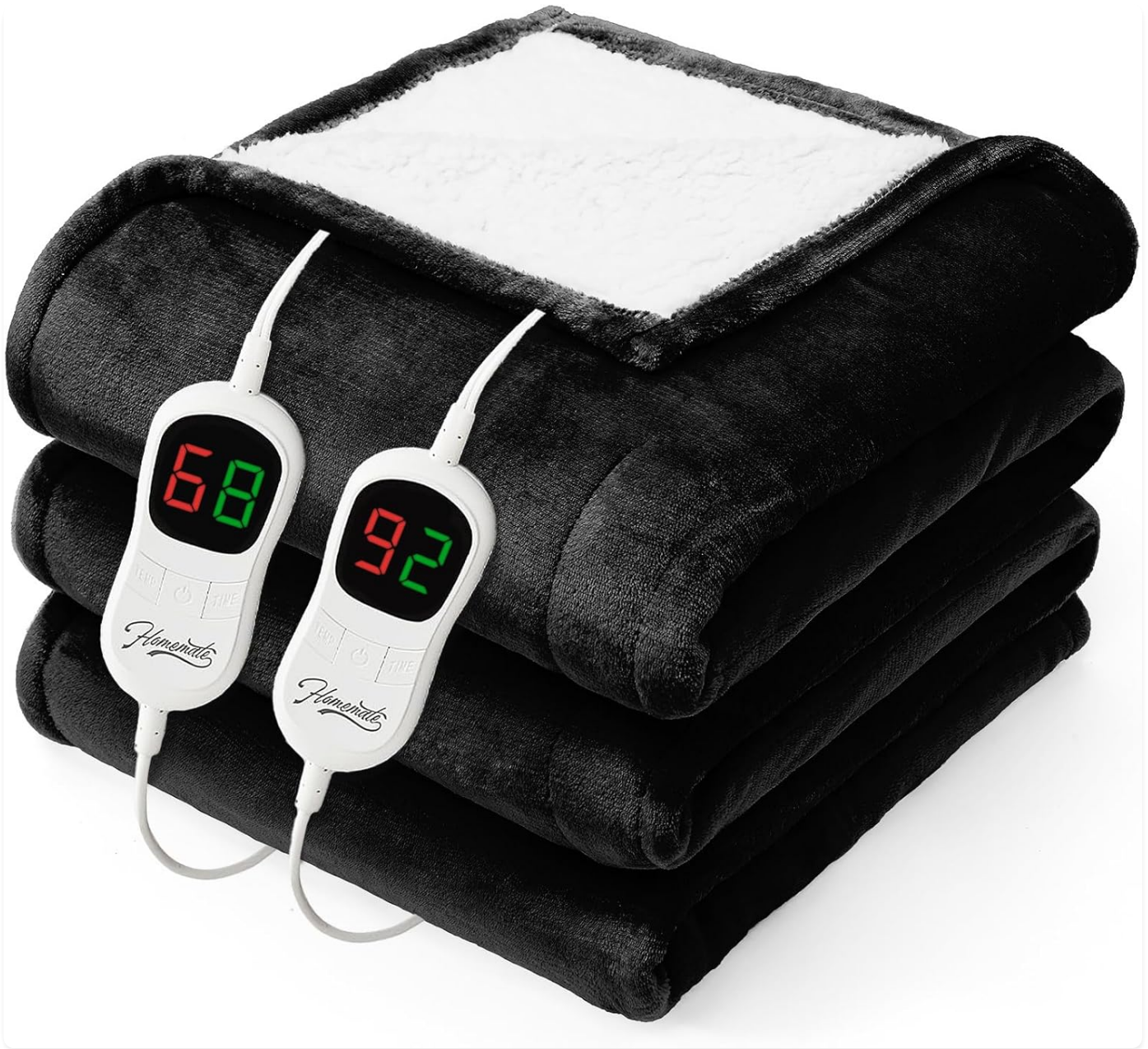
Image: Homemate Queen Size Heated Electric Blanket, black, folded with two detachable controllers.