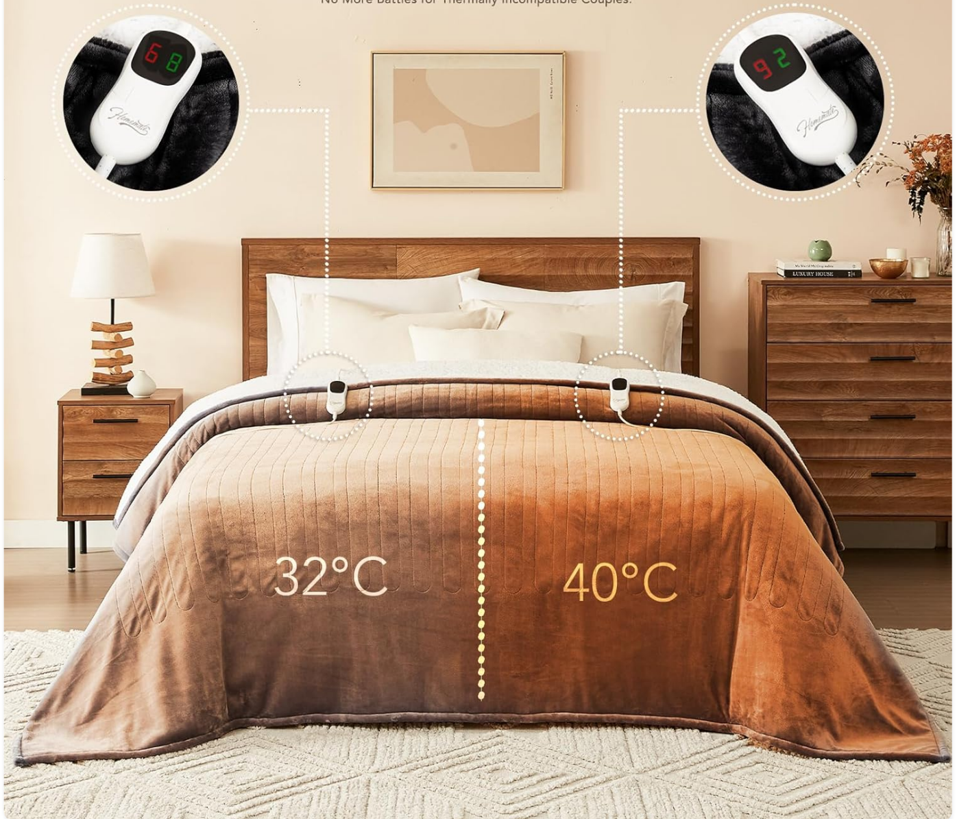
Image: Homemate Queen Size Heated Electric Blanket on a bed, showing two controllers for independent temperature settings on each side.

Individually Adjust Each Side Warmth Level for the Perfect Sleep, No More Battles for Thermally Incompatible Couples.