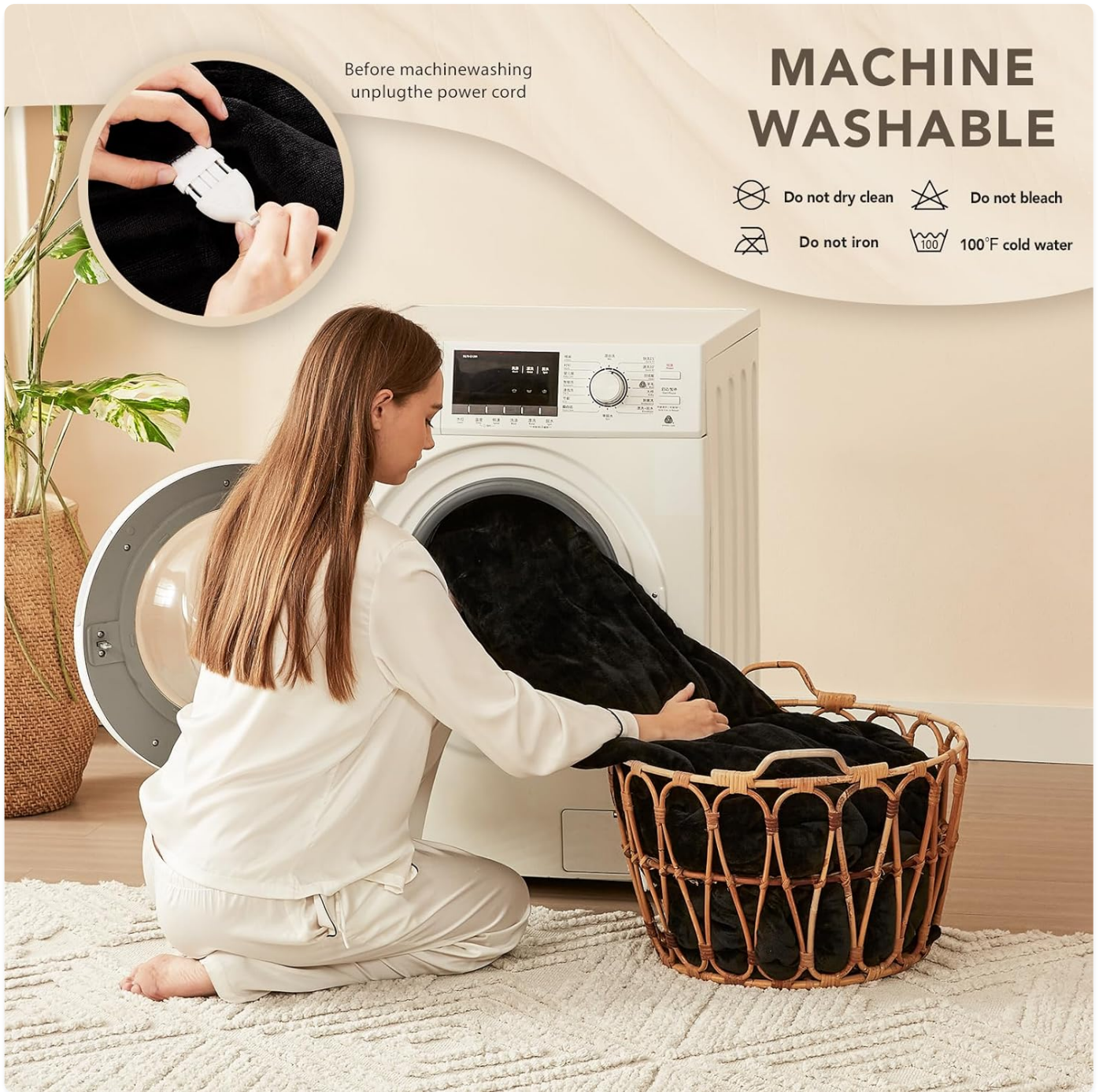
Image: Visual guide for detaching the controller and machine washing the blanket.