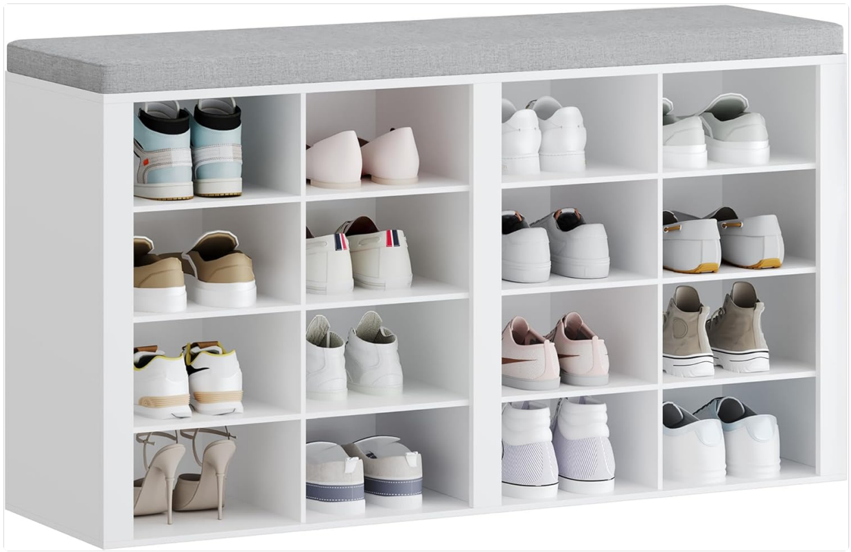
Figure 2.1: The Hzueneri Shoe Bench with Cushion, Model SB25603GY, showcasing its storage cubbies and comfortable seating.