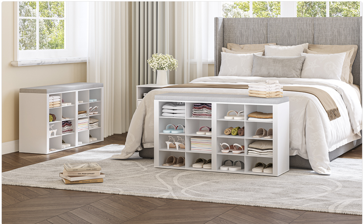
Figure 6.1: The shoe bench integrated into a bedroom setting, demonstrating its use as a bedside stool and storage unit.