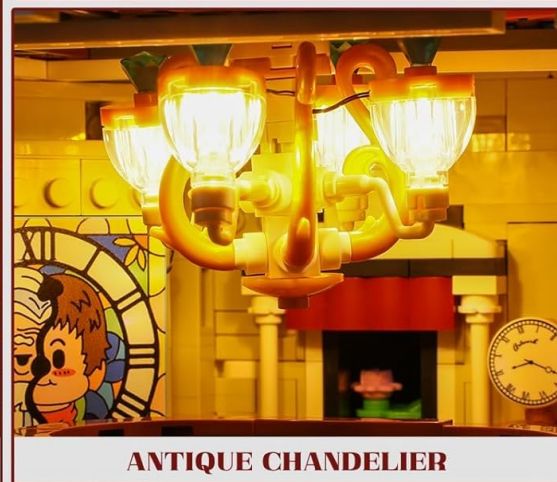
Image 3.4: Close-up view of the intricate stained glass windows and an antique chandelier, highlighting the detailed design elements.