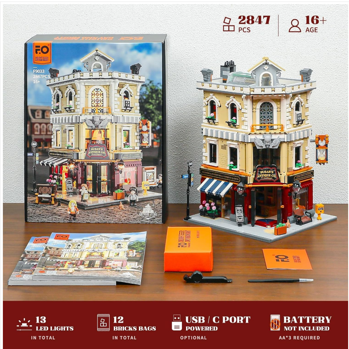
Image 2.1: Overview of the product packaging, instruction manuals, and the various components included in the set.