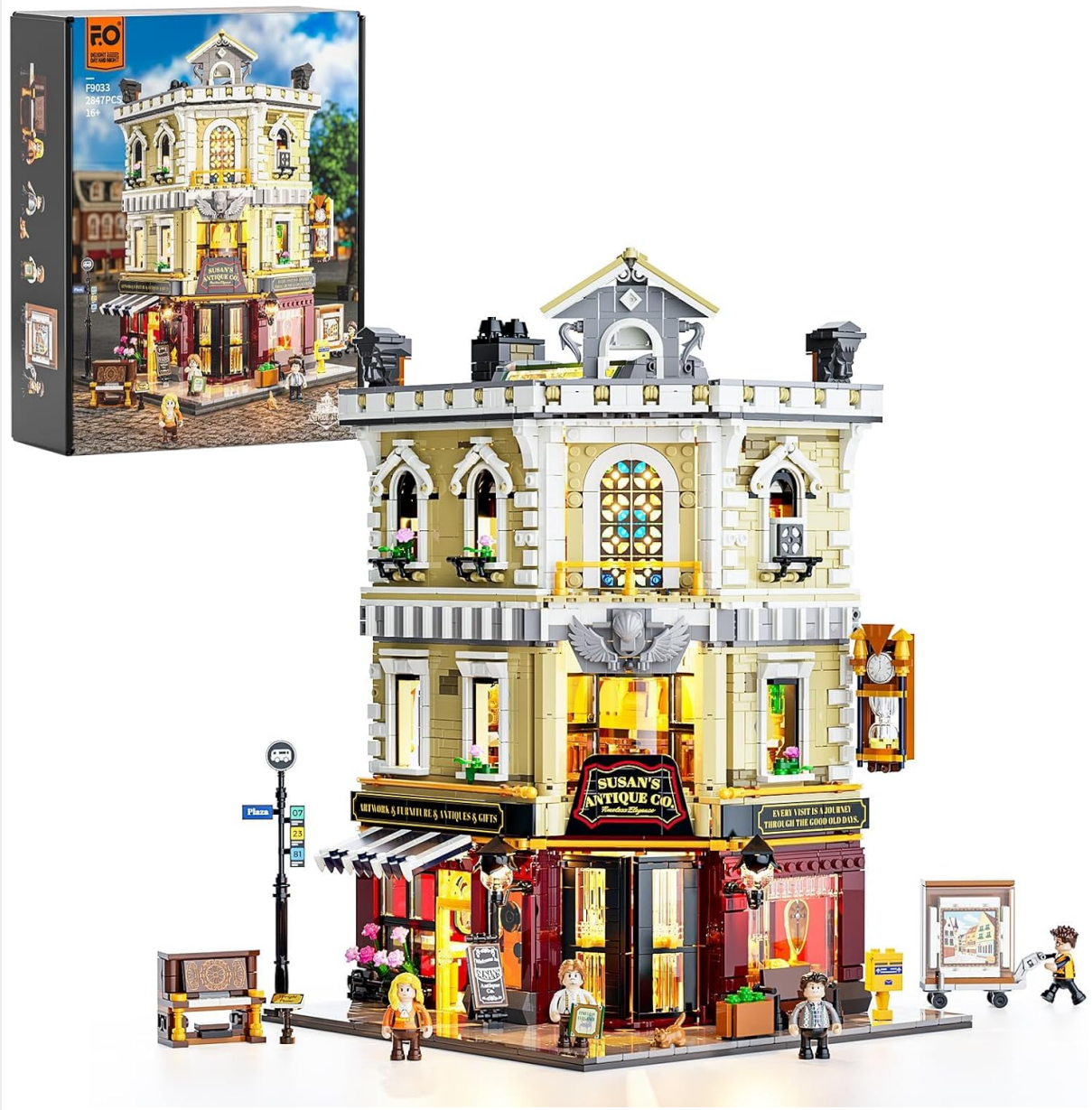
Image 1.1: The fully assembled FUNWHOLE Antique-Store Lighting Building-Bricks Set F9033, showcasing its detailed exterior and integrated lighting.