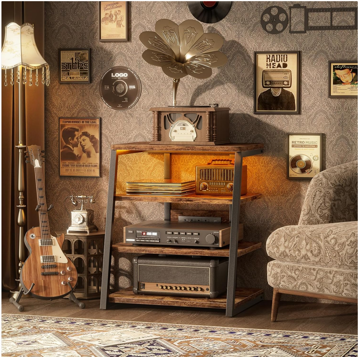
Image 3.1: Fully assembled Besiost AV Media Stand, showcasing its structure and capacity for audio equipment.