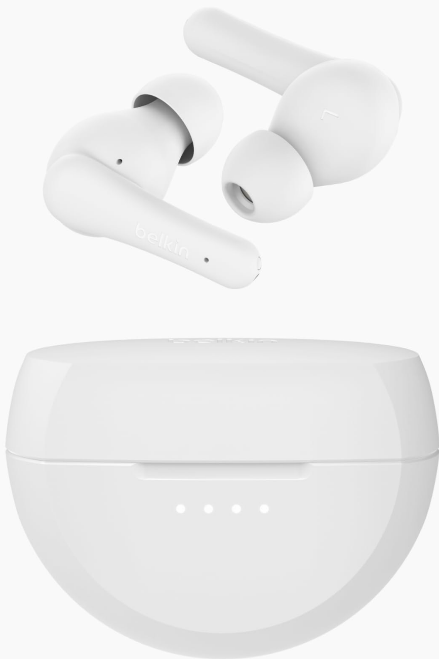
Image: Belkin SoundForm Rhythm True Wireless Earbuds and their compact charging case.