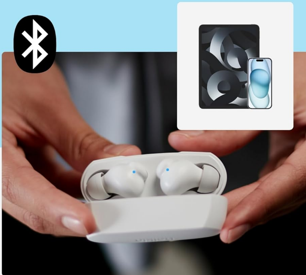
Image: Hands holding the charging case with earbuds, illustrating Bluetooth pairing with a phone and tablet.

Easily pair and connect to your Bluetooth devices within a 30 ft. /10m range.