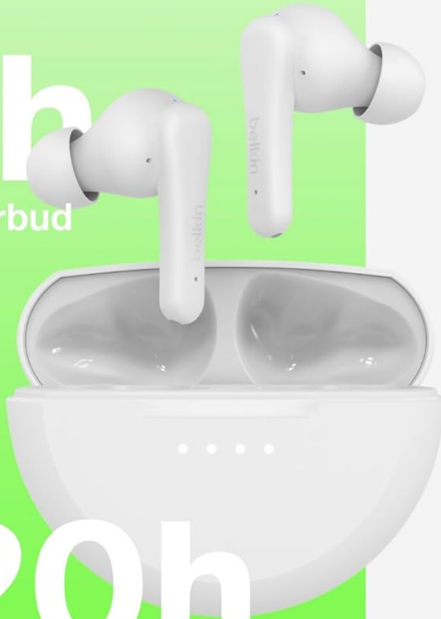
Image: Visual representation of 8 hours per earbud and 20 hours in the charging case.