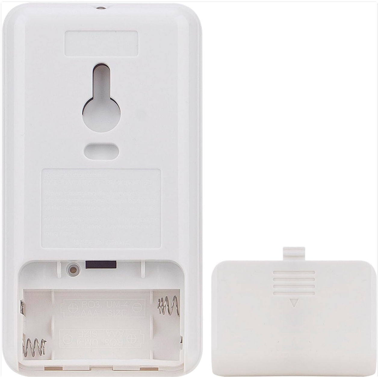
Image: Rear view of the remote control with the battery cover removed, showing the battery slots for two AAA batteries.