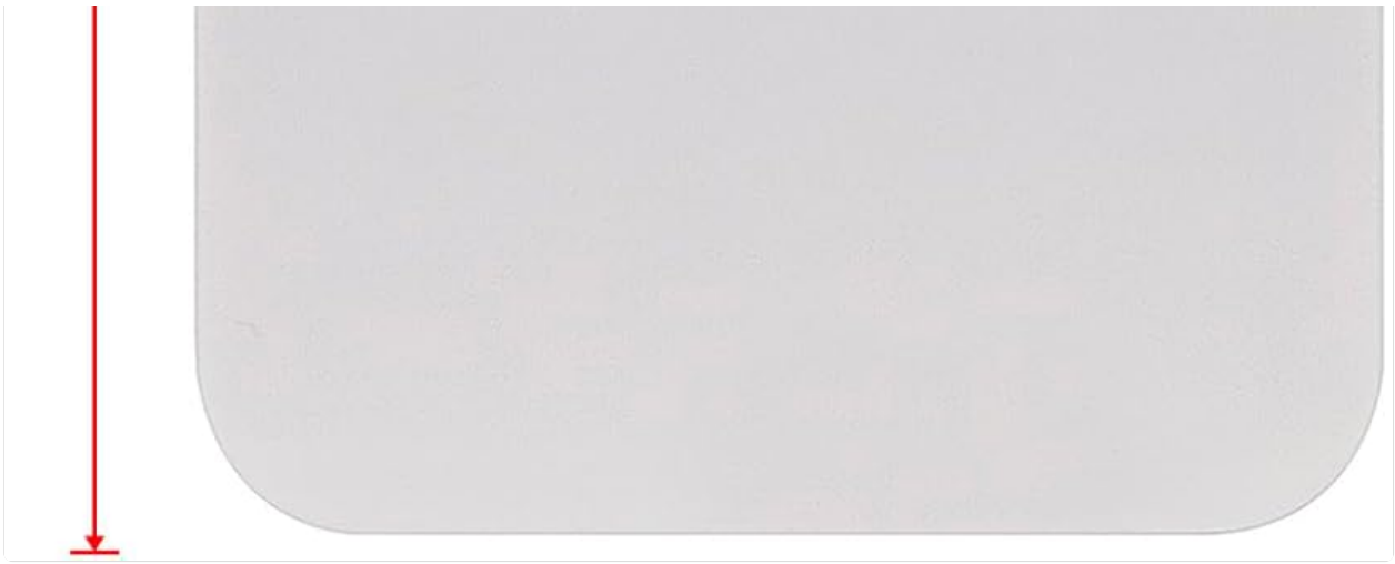
Image: Remote control with its approximate dimensions indicated in centimeters and inches.