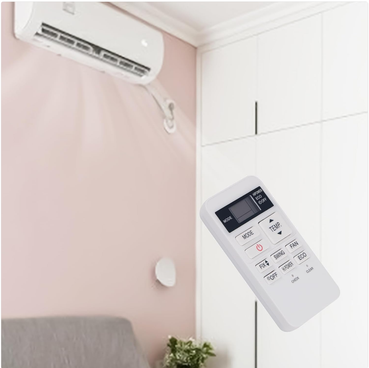
Image: The AIDITIYMI RAS-07BKV-E remote control shown in a room with an air conditioner, illustrating its intended use.