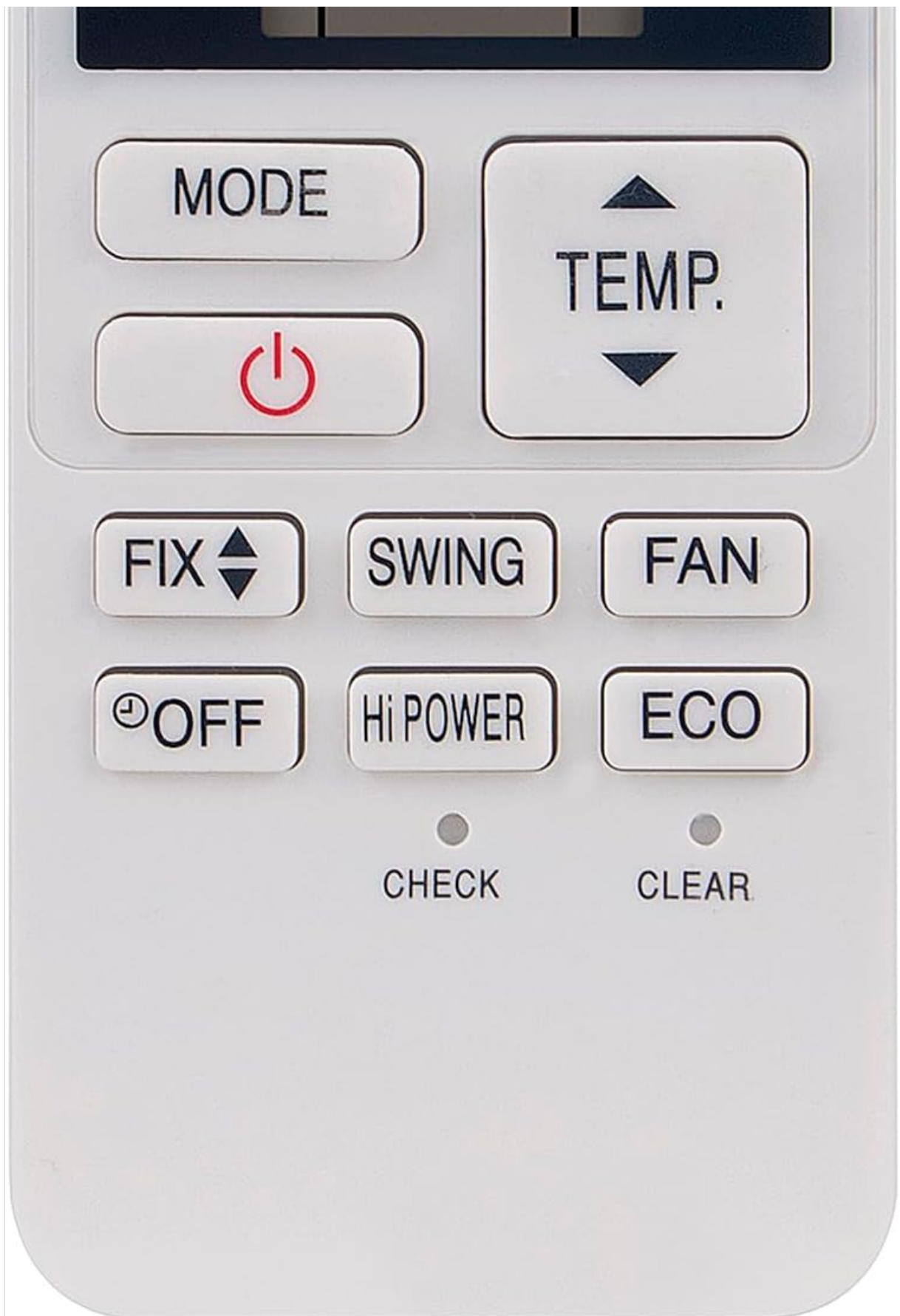
Image: Front view of the remote control, highlighting the button layout and display area.