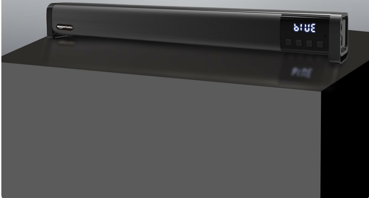
Figure 2: Front view of the soundbar with controls and display.