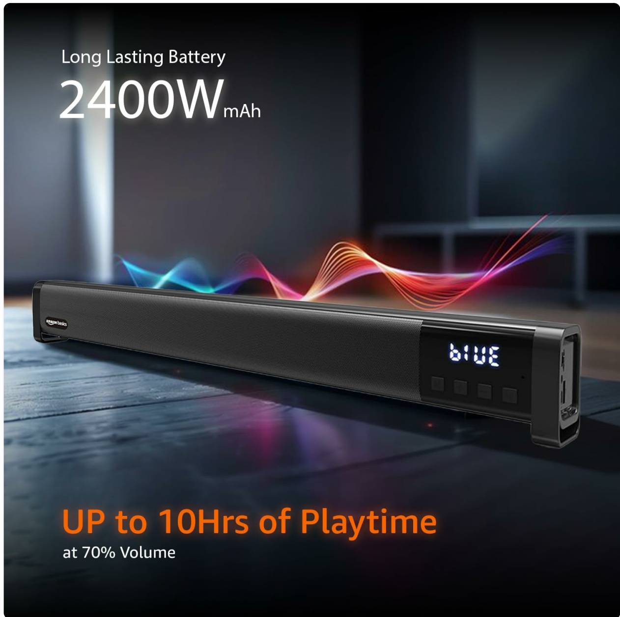
Figure 3: Soundbar showcasing its long-lasting battery.

Before first use, fully charge the soundbar. Connect the provided USB cable to the soundbar's charging port and the other end to a USB power adapter (not included) or a computer's USB port. The charging indicator will show the charging status. A full charge takes approximately 4.16 hours and provides up to 10 hours of playback at 70% volume.