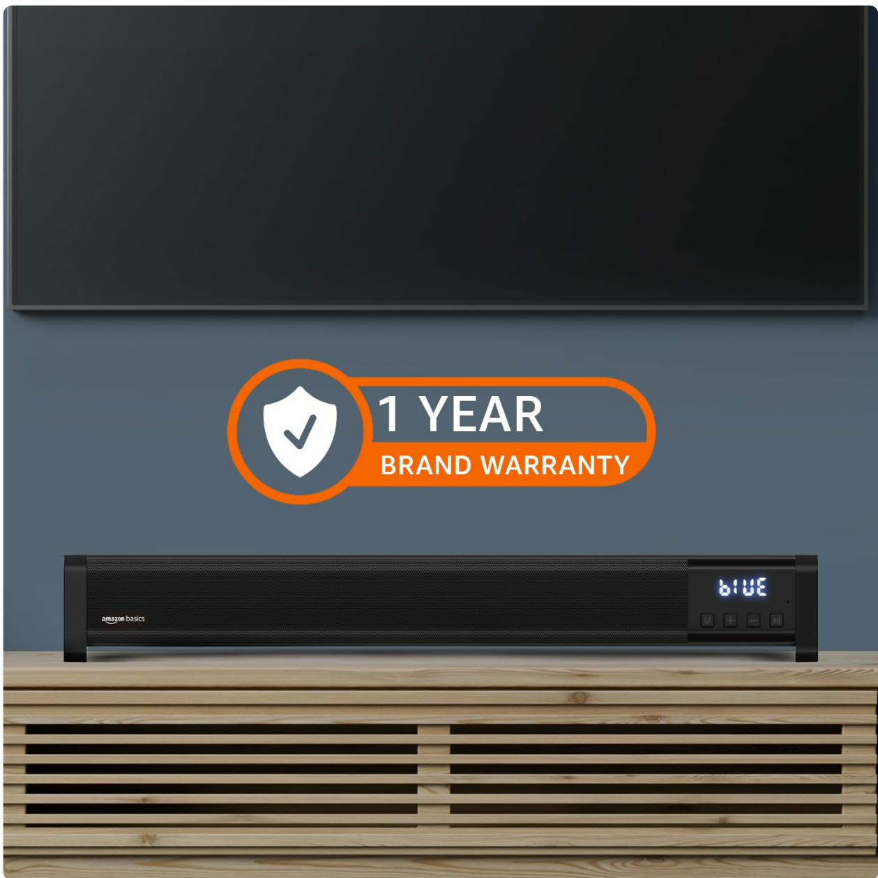
Figure 6: The soundbar is covered by a 1-year brand warranty.