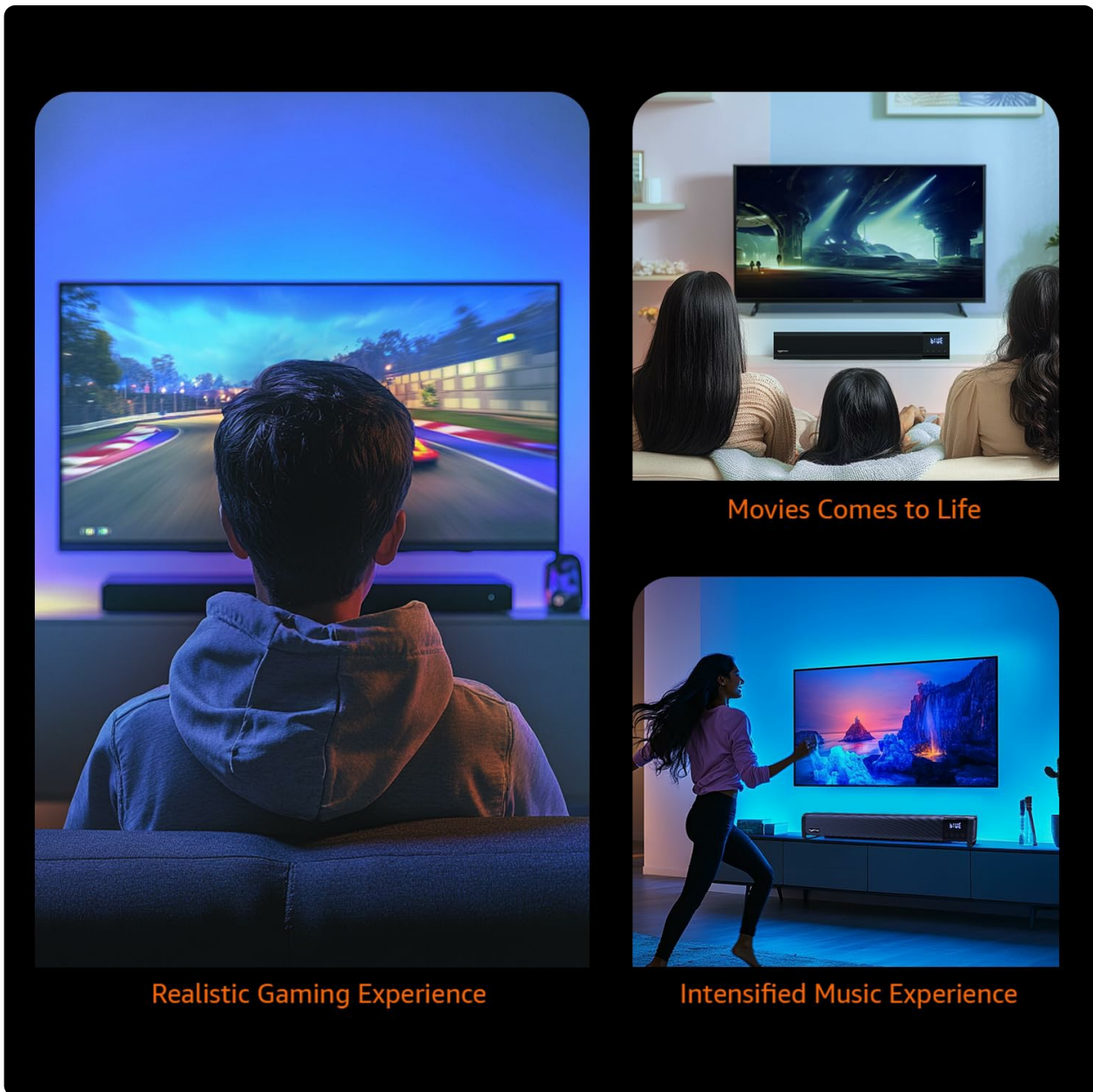
Figure 5: The soundbar enhances various entertainment experiences.