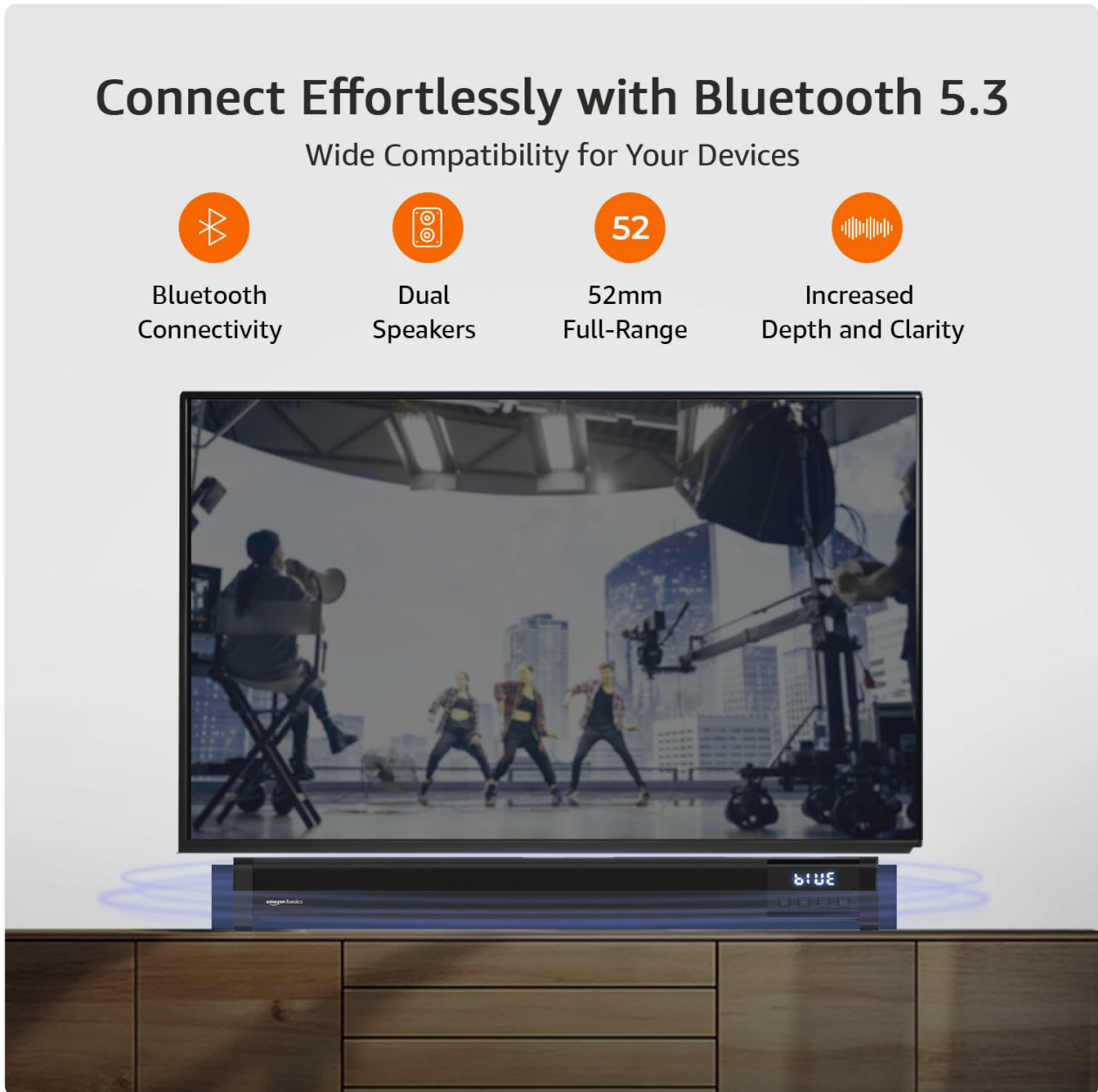
Figure 4: Soundbar connected to a television for enhanced audio.

The soundbar supports Bluetooth 5.3 for faster pairing and a stable connection up to 10 meters.