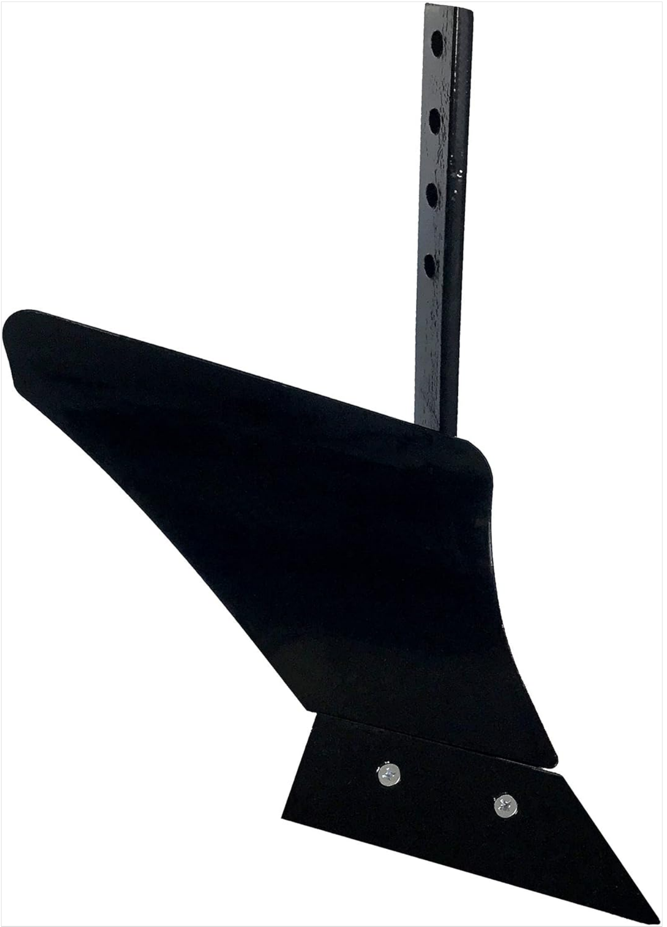
Image 4.3: The adjustable furrower attachment for creating furrows in soil.