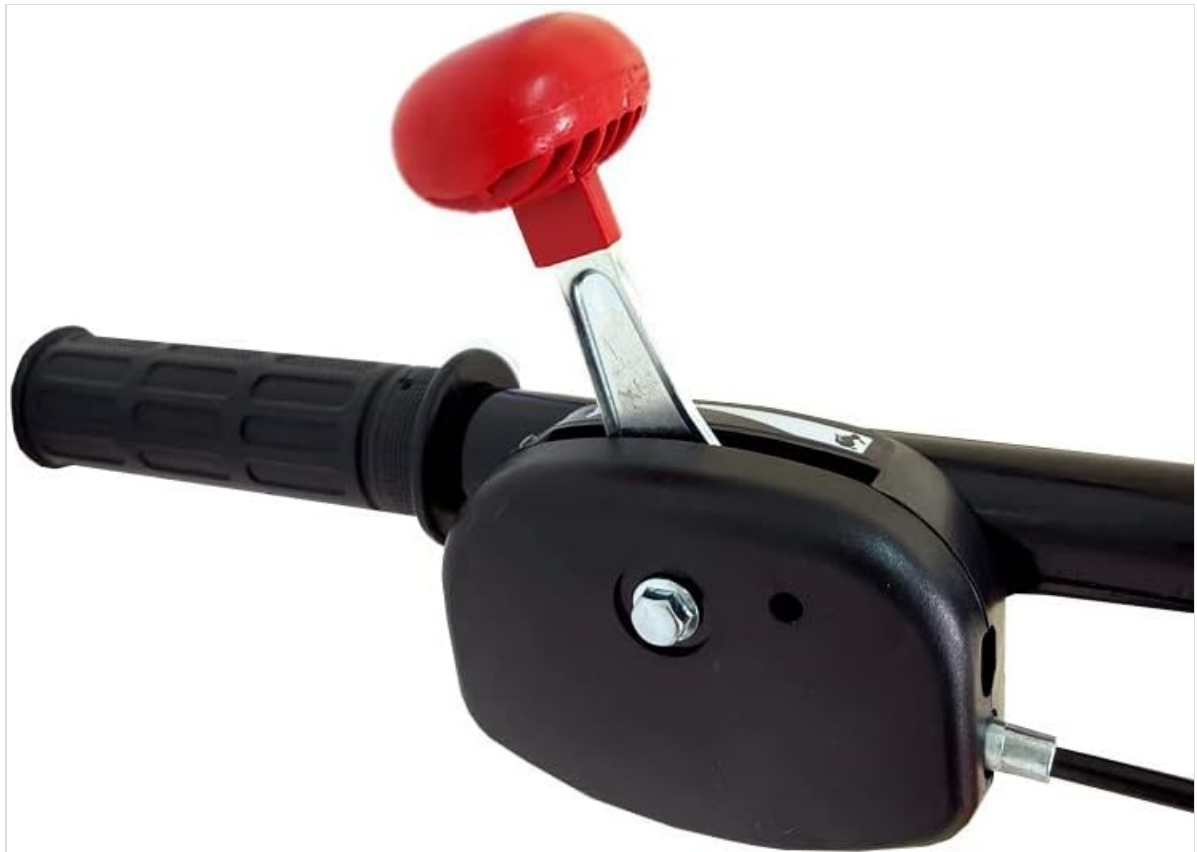
Image 5.2: The gear selection lever, allowing for 2 forward and 1 reverse speed.