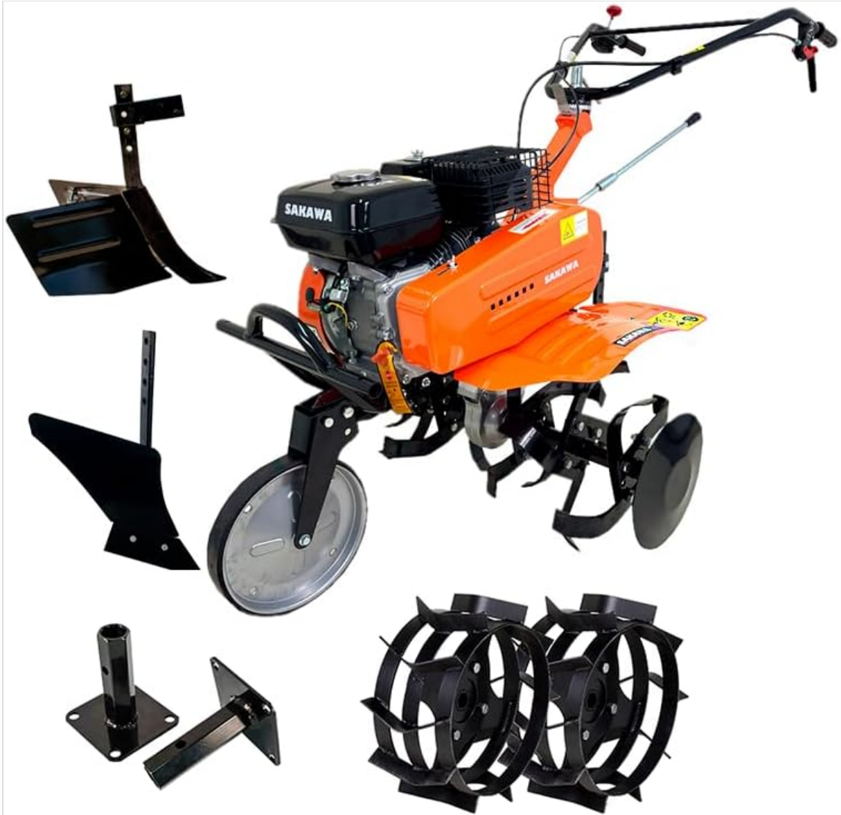
Image 3.1: SAKAWA 1G72 Tiller with all included accessories, including the main unit, metallic wheels, furrower, and plow.