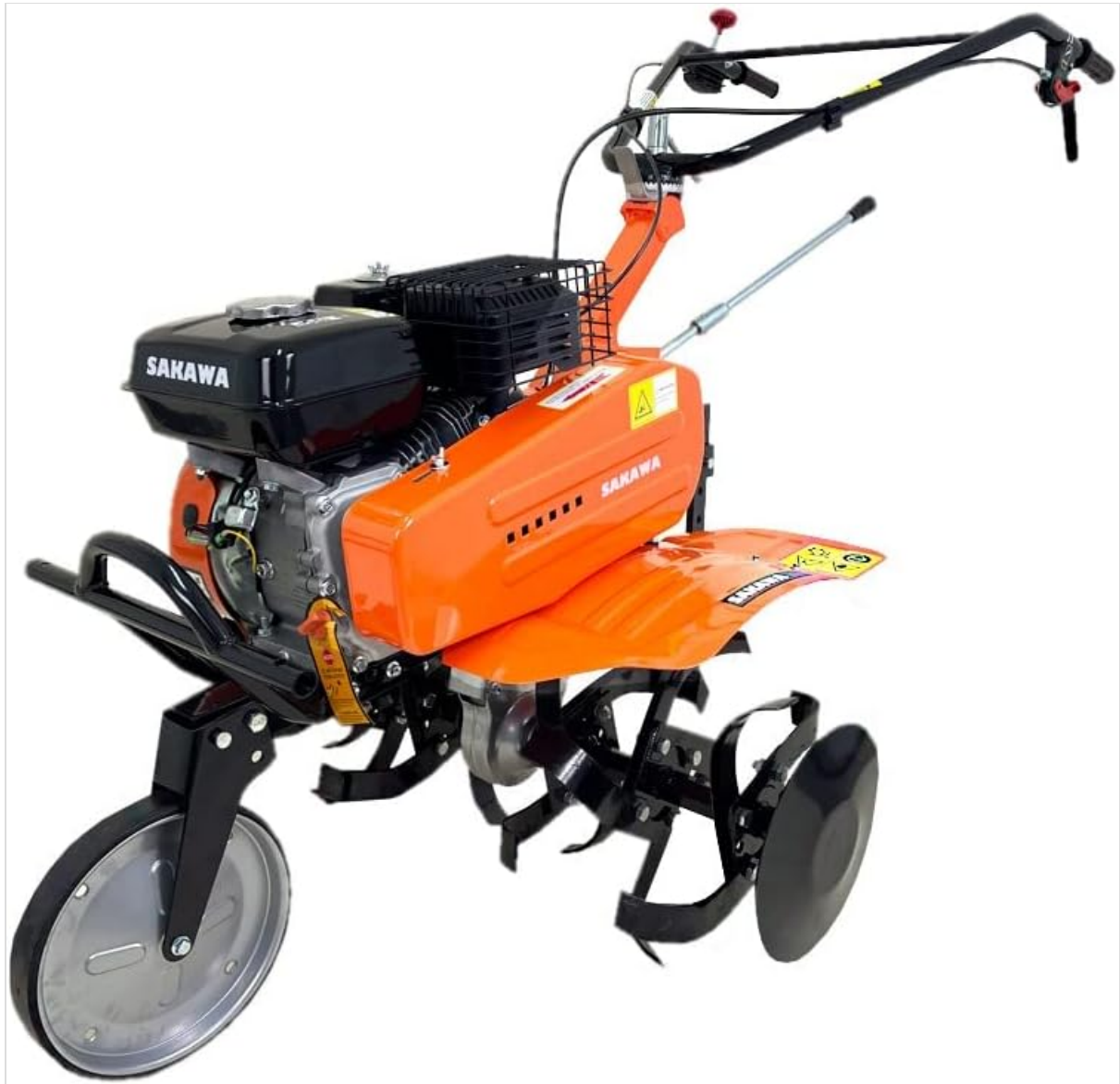
Image 4.1: The SAKAWA 1G72 Tiller with its front transport wheel and tilling blades installed.