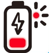
Image: Details on the stylus's fast charging and smart power management features.

Indicator Light Will Illuminate When Battery is Low