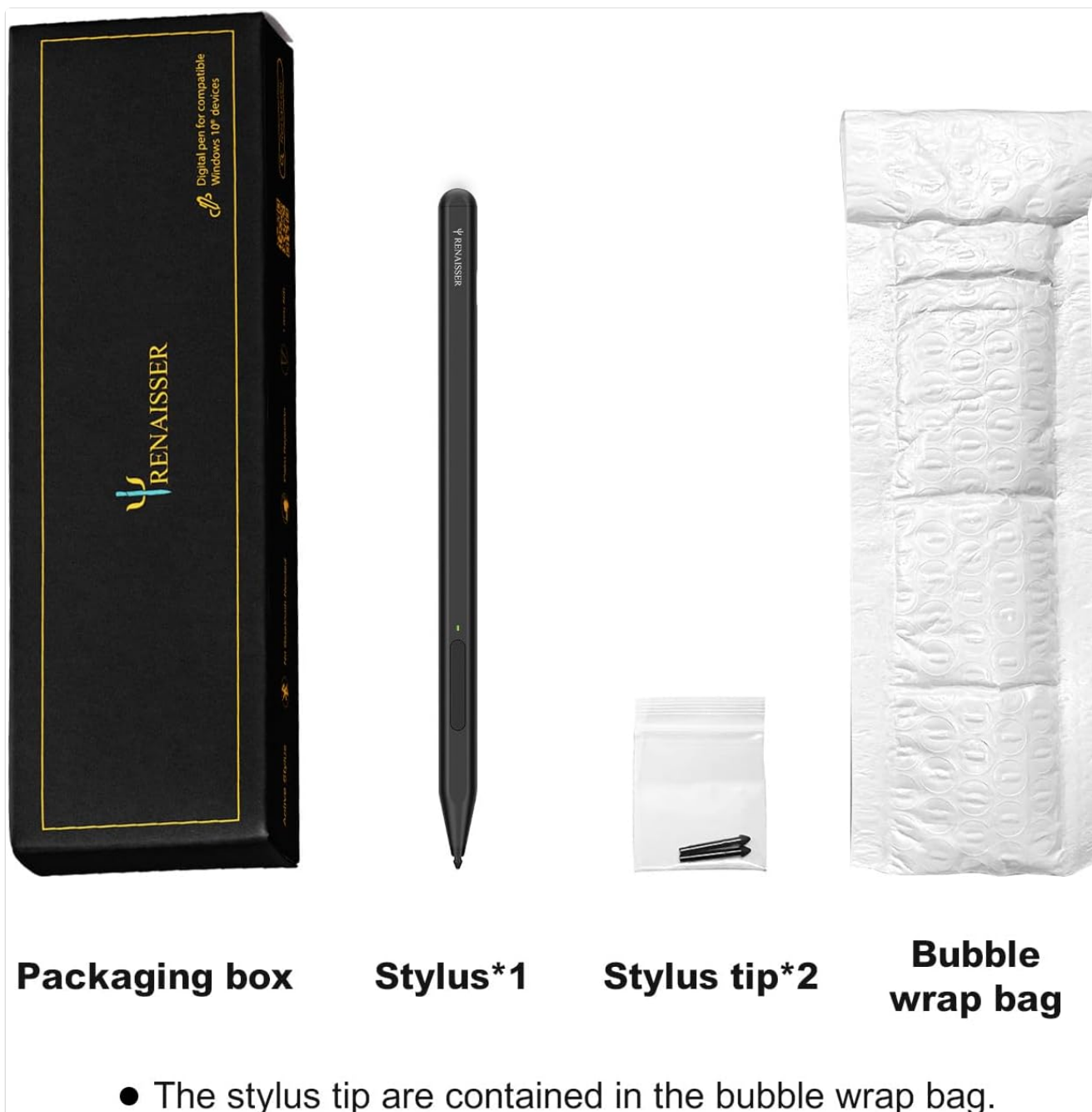
Image: The RENAISSER Stylus Pen, two replacement tips, and the product packaging.