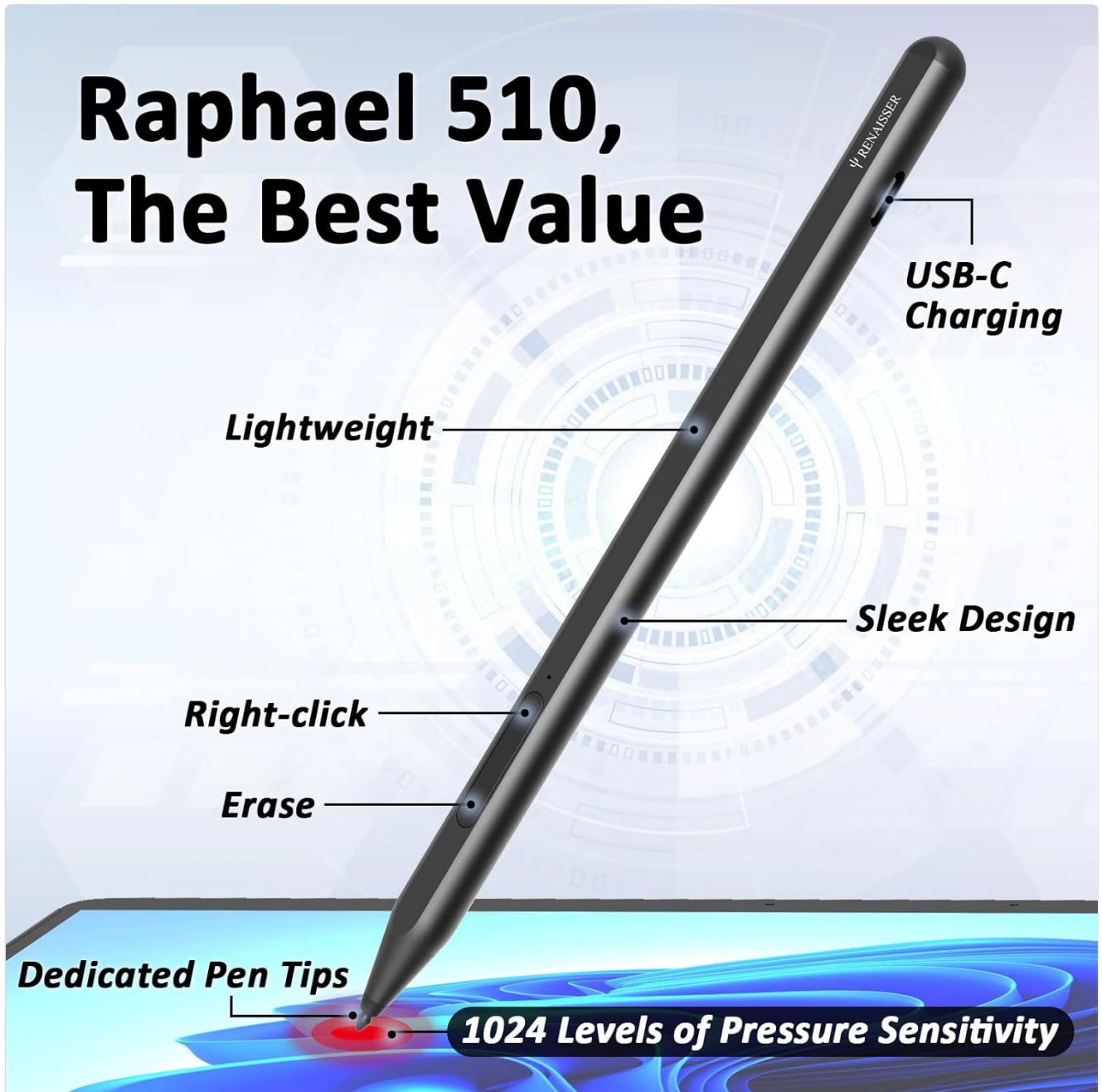
Image: Key features of the Raphael 510 stylus, including its pressure sensitivity.