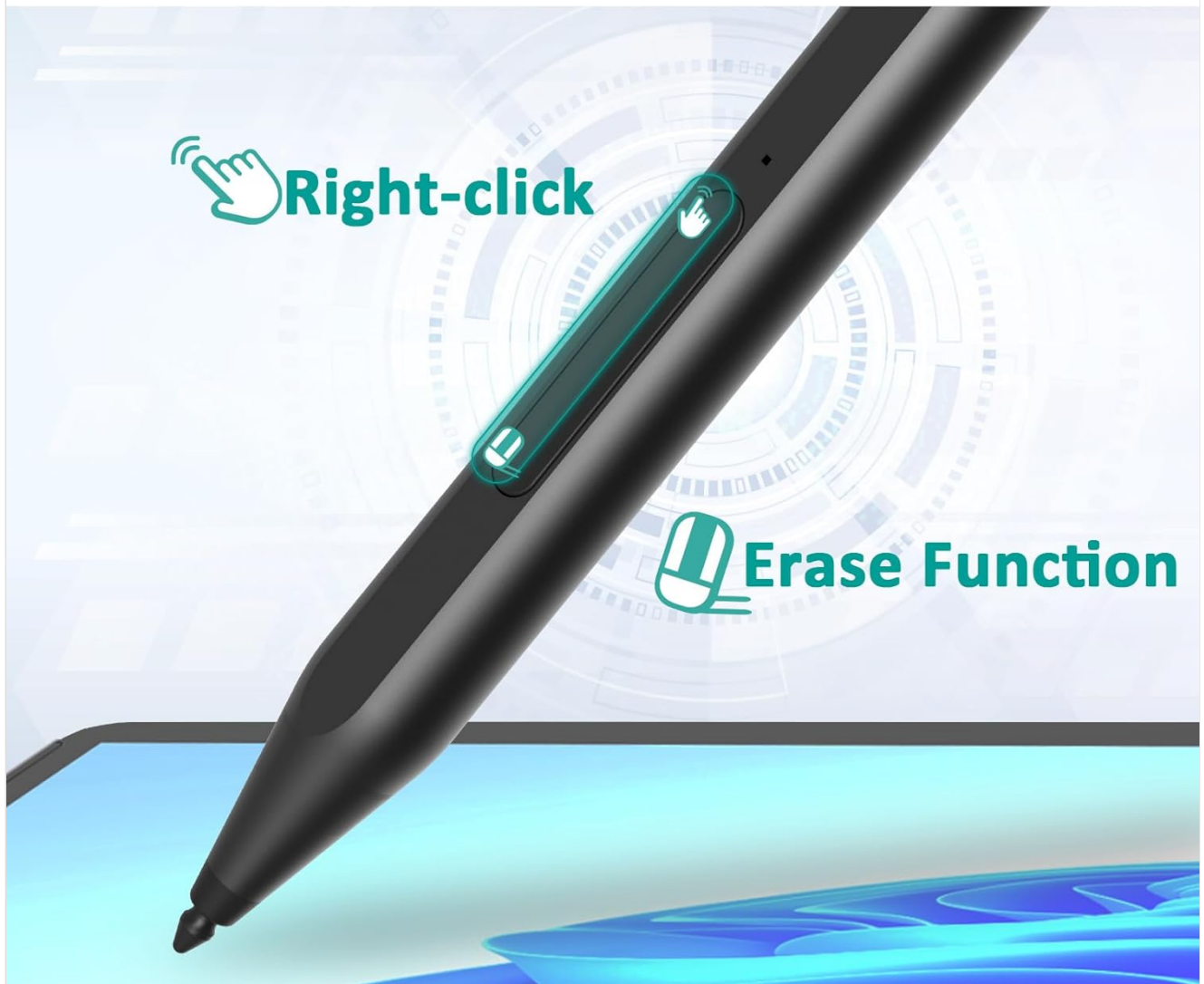
Image: The stylus highlighting the location and function of its right-click and erase buttons.