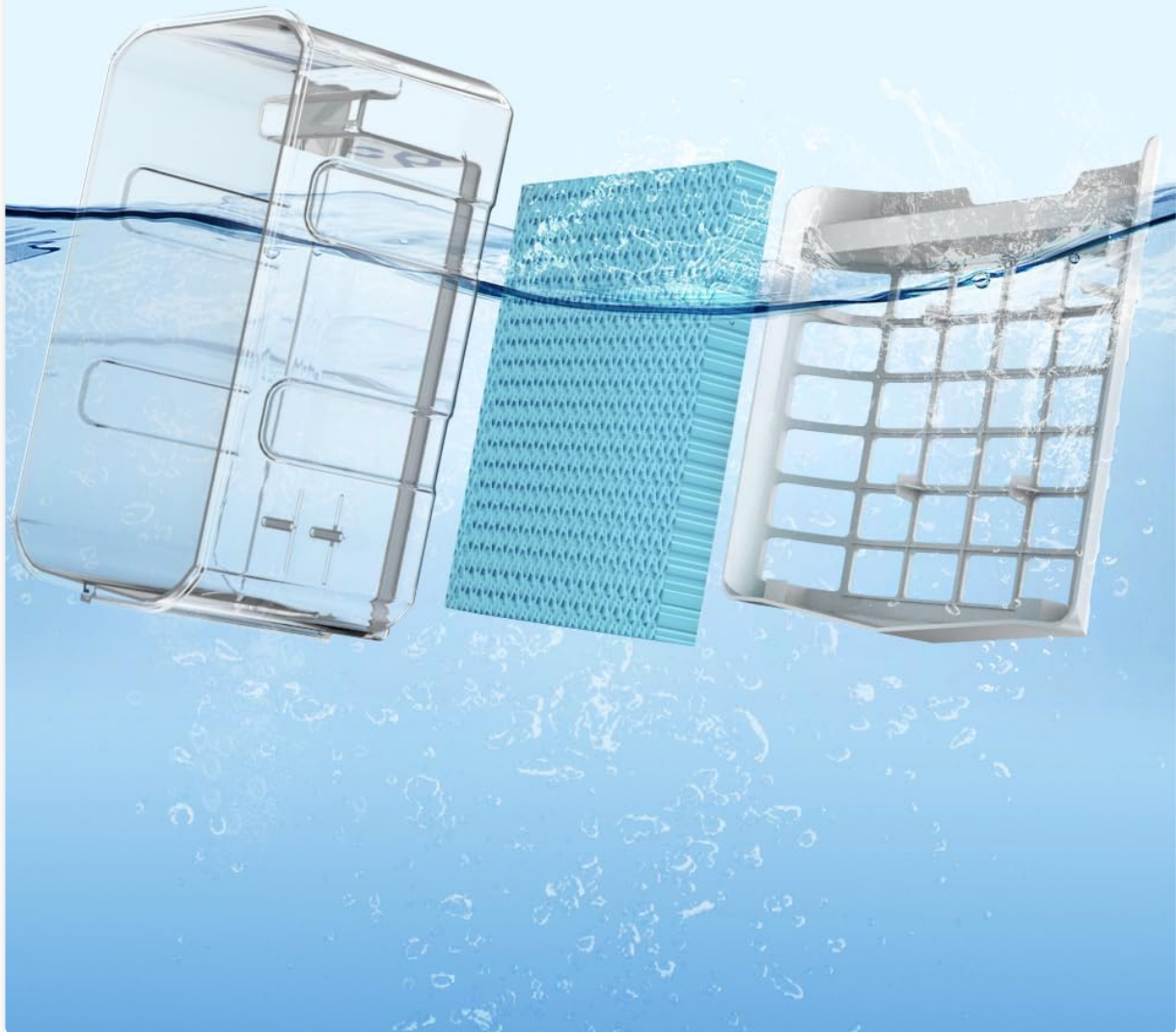
Image: An illustration demonstrating the removable components of the air conditioner, including the rear cover, water tank, and cooling pad, for simplified cleaning.

The rear cover, water tank and cooling pad are removable for easy cleaning