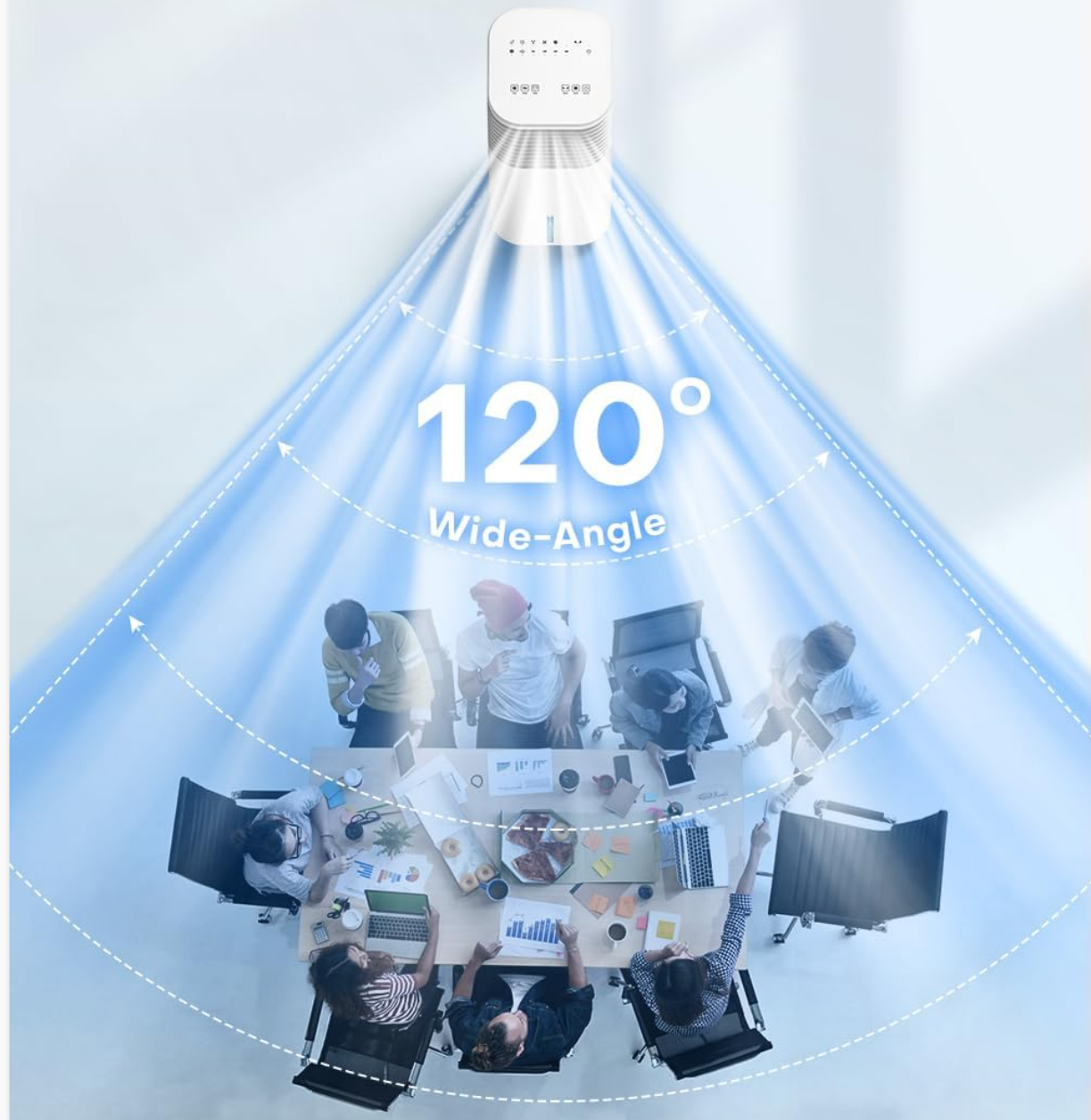
Image: An overhead diagram illustrating the wide-angle oscillation and coverage area of the air conditioner in a room setting.