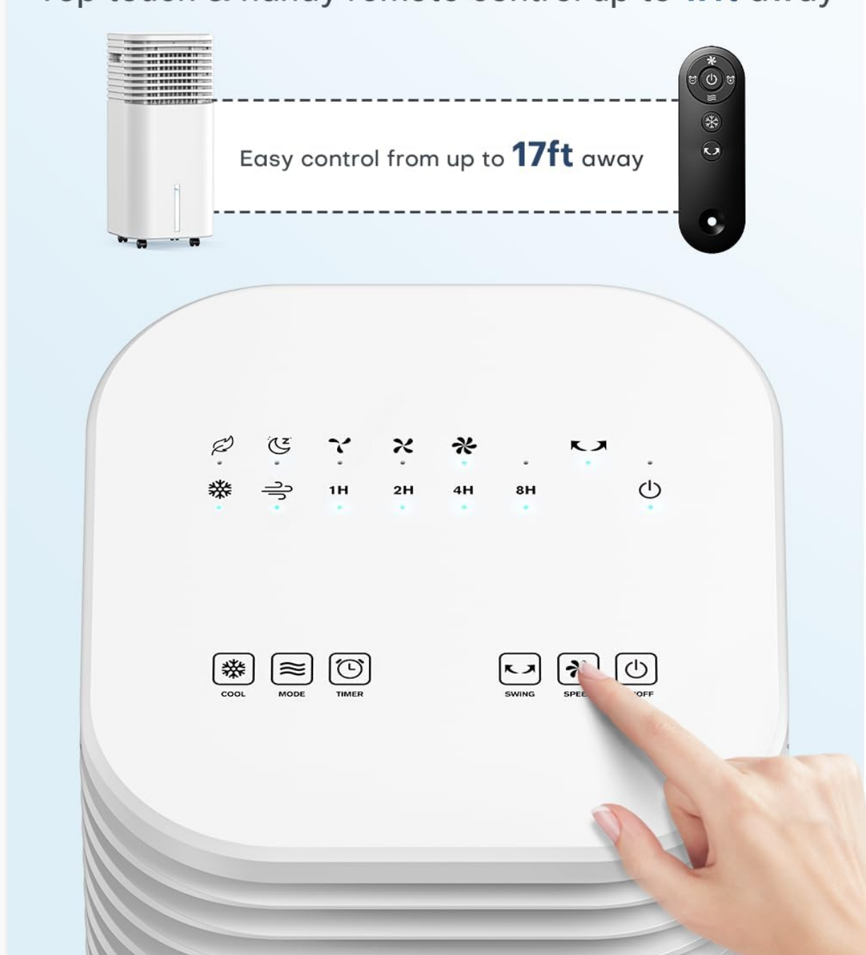
Image: The top control panel of the air conditioner with various function icons, and the remote control, illustrating the dual control options.

Top touch & handy remote control up to 17ft away