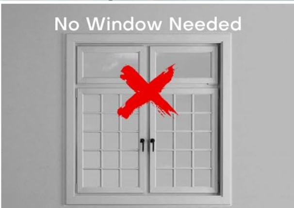
Image: The portable air conditioner plugged into a wall outlet, emphasizing that no hose or window installation is required, unlike traditional AC units.