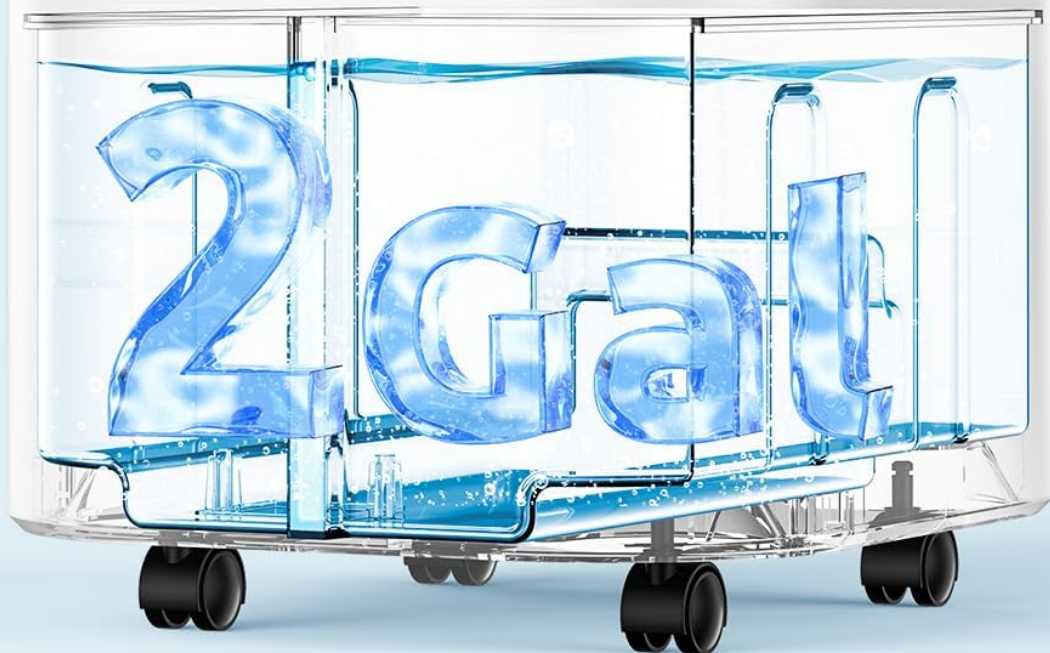
Image: A detailed view of the air conditioner's 2-gallon water tank, highlighting its large capacity for extended cooling.

To enhance the cooling effect, you can add the included ice packs to the water tank. The unit comes with 4 upgraded ice packs that are pre-filled with polymer solidified gel for extended cooling and leak prevention.