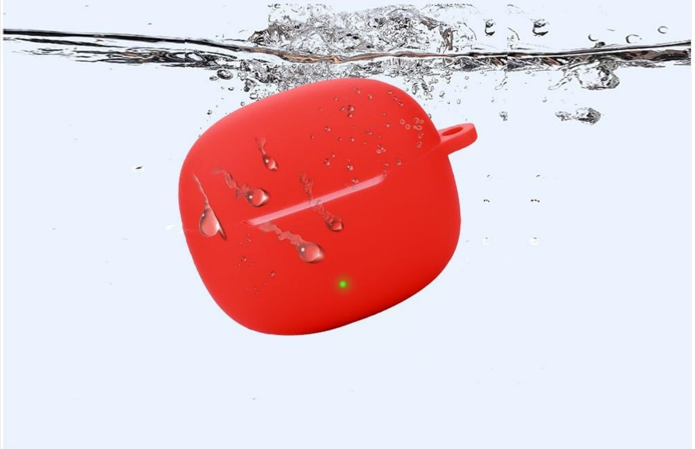
Figure 3.1: The case is designed to restore the bare metal feel, with a thin profile (2mm) and precise mold opening for a perfect fit with the Baseus Bowie E11 earbuds.

Water stains and dirt can be easily wiped clean