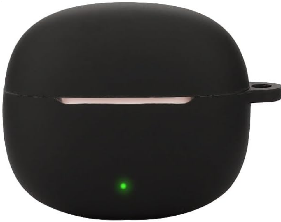
Figure 2.1: Front view of the YKNIUFLY protective case for Baseus Bowie E11 earbuds in black, showing the charging indicator light.