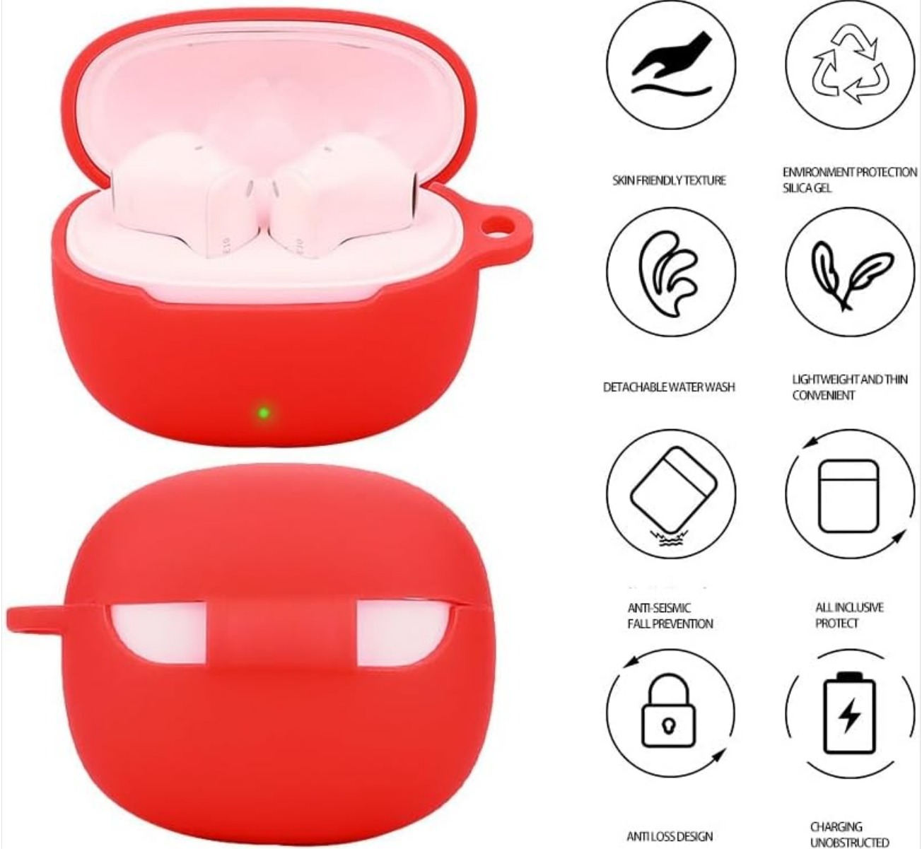
Figure 2.2: Overview of the red YKNIUFLY case, highlighting key features such as skin-friendly texture, environmental protection, detachability, lightweight design, anti-seismic fall prevention, all-inclusive protection, anti-loss design, and unobstructed charging.