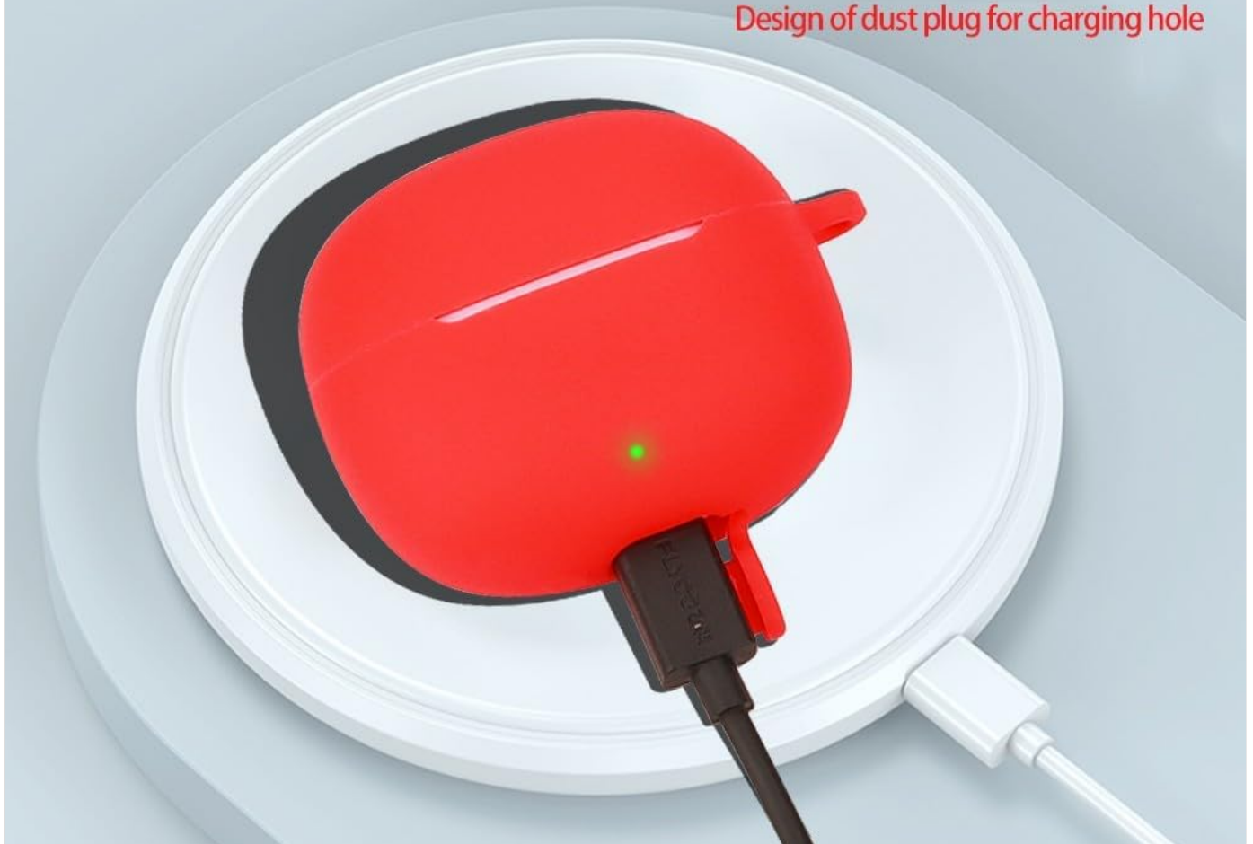
Figure 4.1: The case allows for charging without removal, featuring a dust plug design for the charging hole and supporting wireless charging.