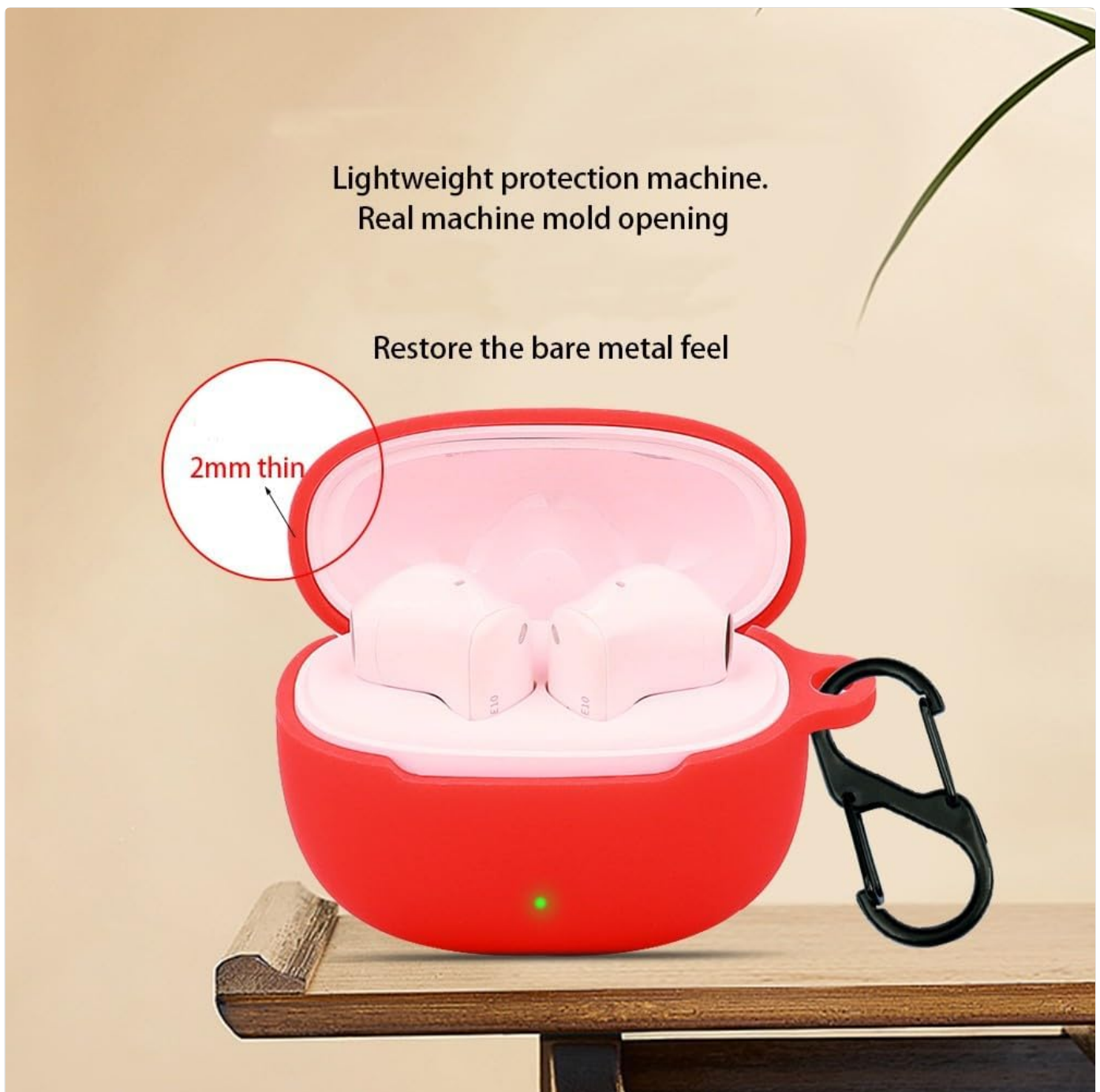
Figure 2.4: Illustration of the case providing 360° seamless full coverage protection, emphasizing its stable fit, anti-fingerprint properties, and shock/drop resistance.