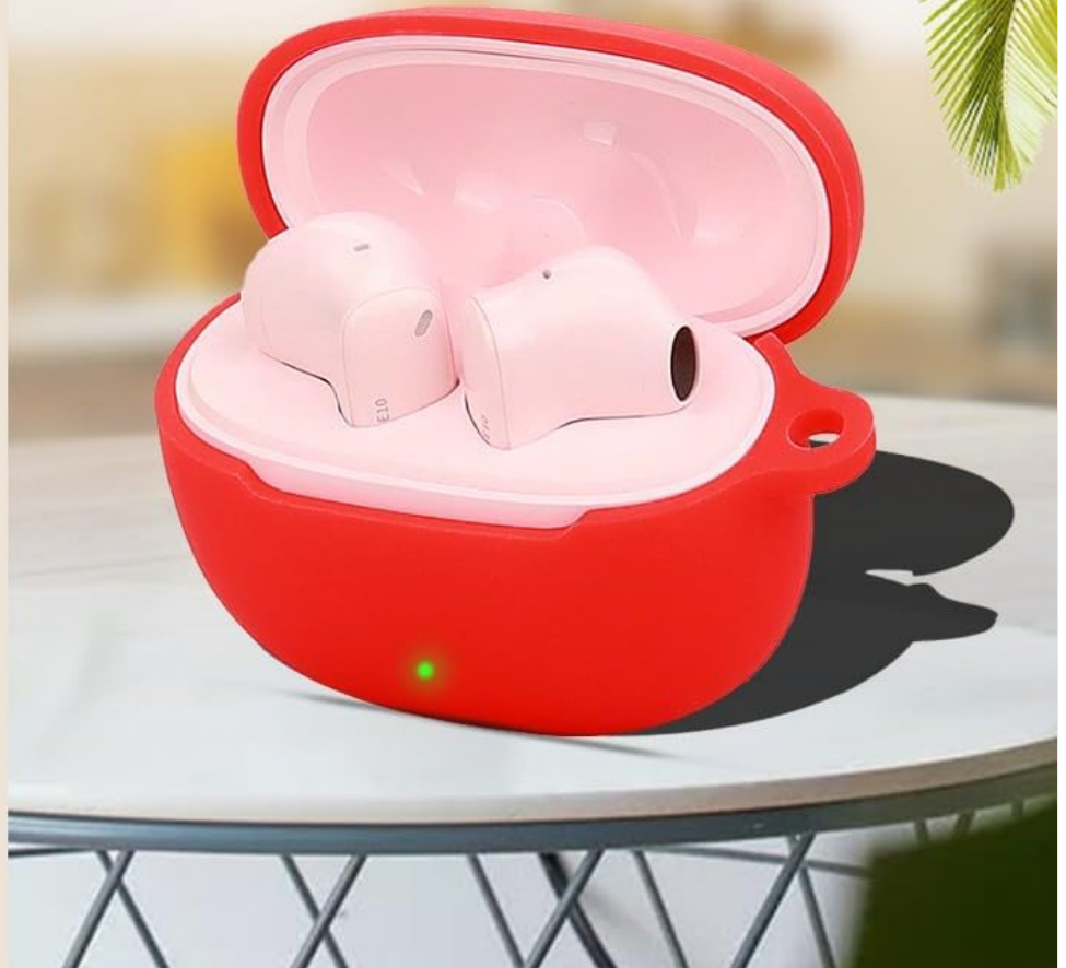
Figure 7.1: The elastic silicone material provides effective cushioning and shock absorption, making the case earthquake resistant and anti-drop.

CONNECTION IS UNOBSTRUCTED AND EASY TO OPEN AND CLOSE