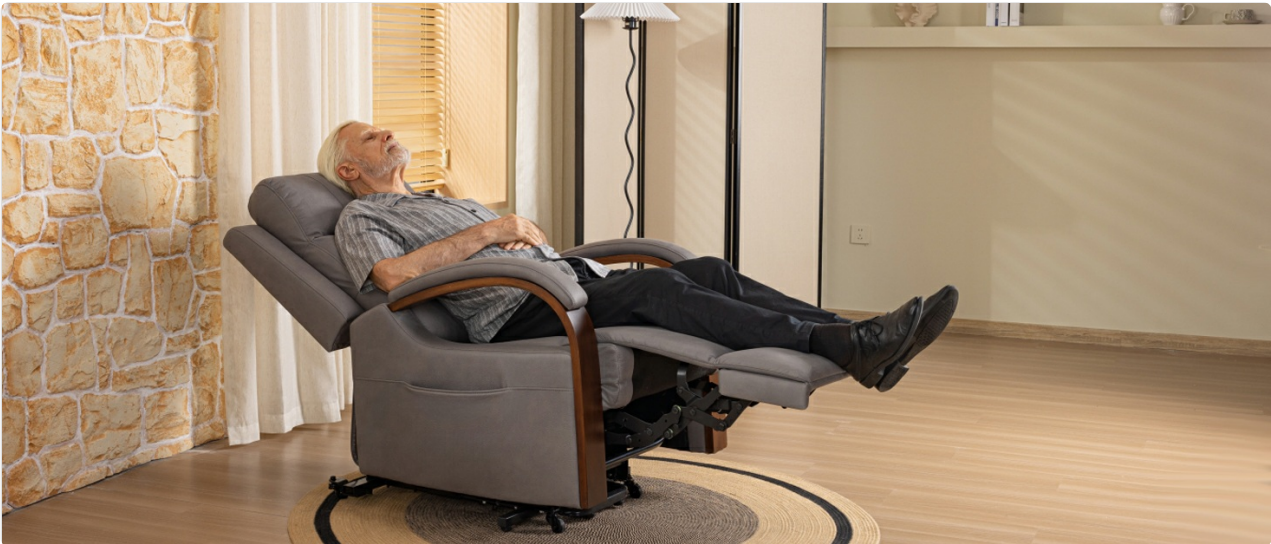
Figure 6.1: Example of a power recliner in use. The motor actuator enables the smooth reclining motion for user comfort.