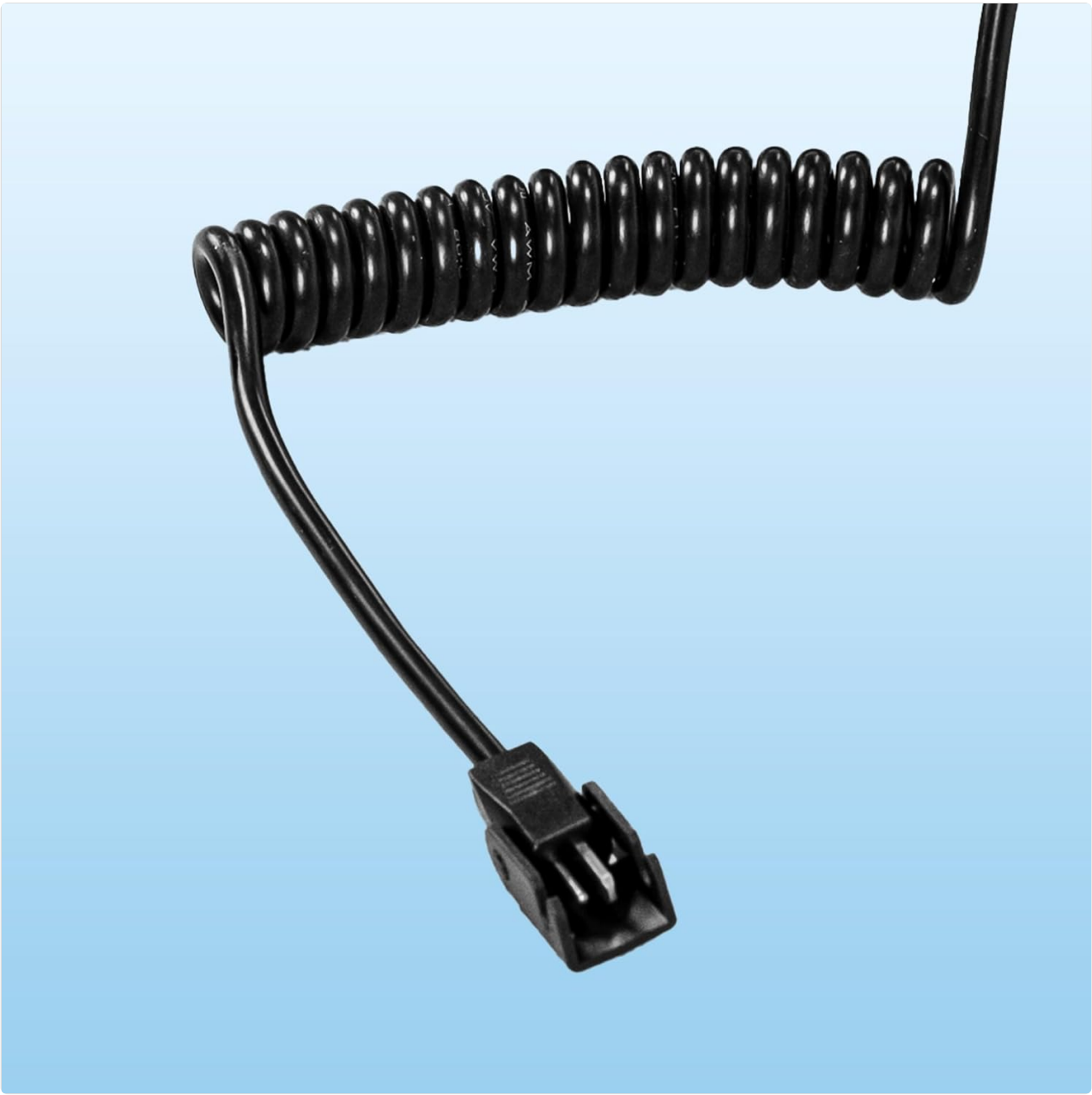
Figure 3.4: Close-up view of the motor actuator's power connector. This image shows the black, two-pin connector at the end of the coiled cable, designed for easy and secure attachment to the power supply.