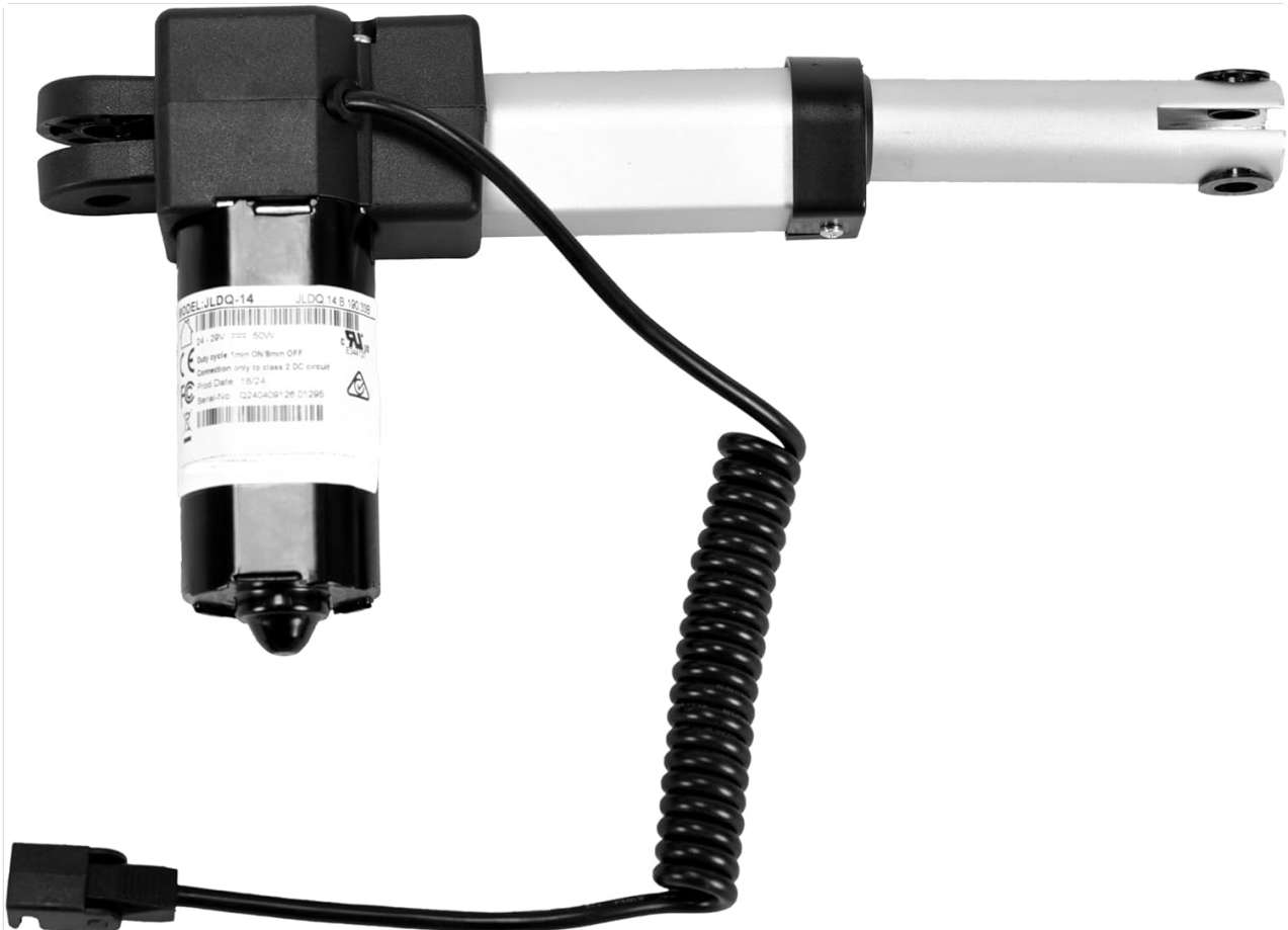
Figure 3.1: The Fromann JLDQ-14 Motor Actuator. This image shows the complete motor actuator unit with its coiled power cable and connector.