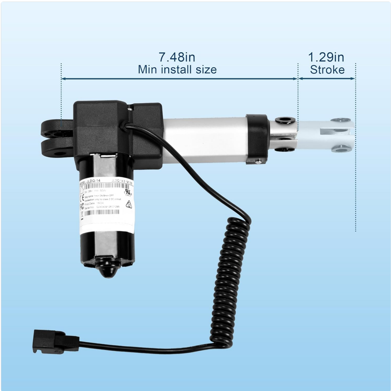
Figure 3.2: Motor Actuator with key dimensions. This image highlights the minimum installation size of 7.48 inches and a stroke length of 1.29 inches.