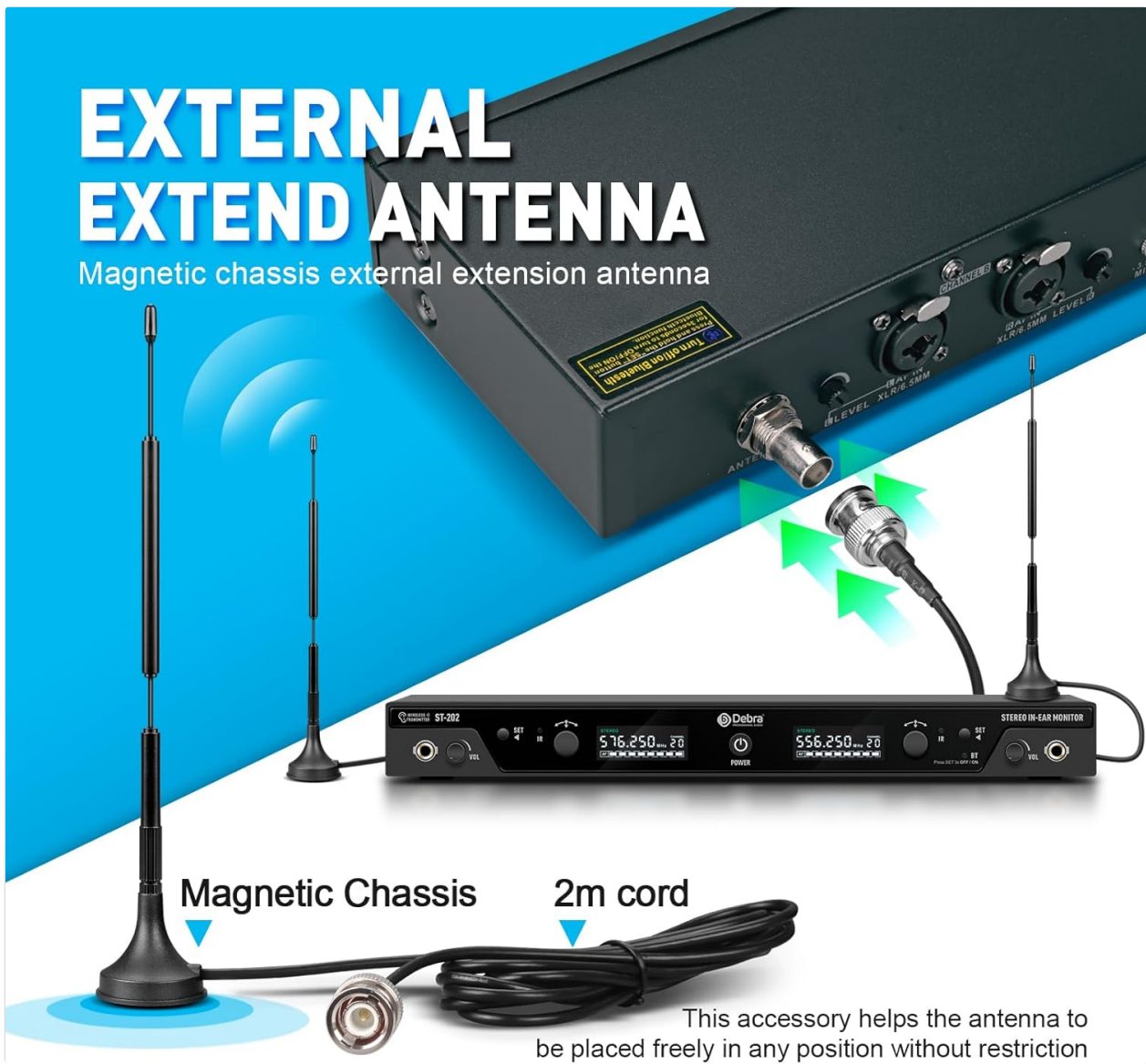
Figure 4: External antenna connection for enhanced signal reception.