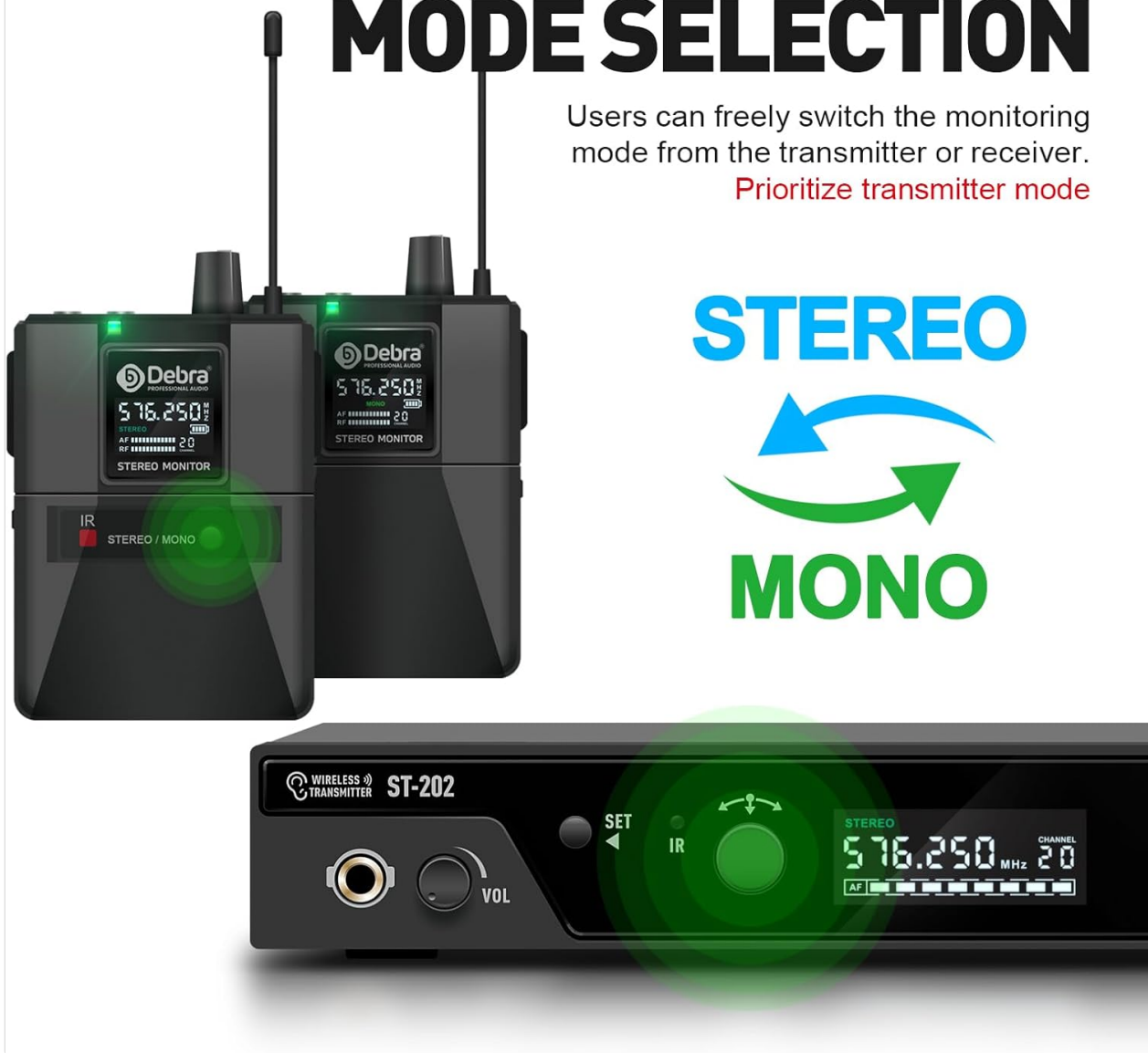
Figure 6: Switching between Stereo and Mono monitoring modes.