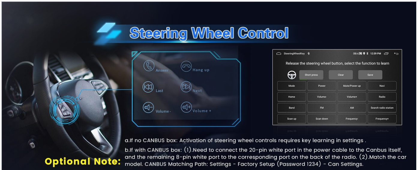
Image: Interface for learning and configuring steering wheel controls.