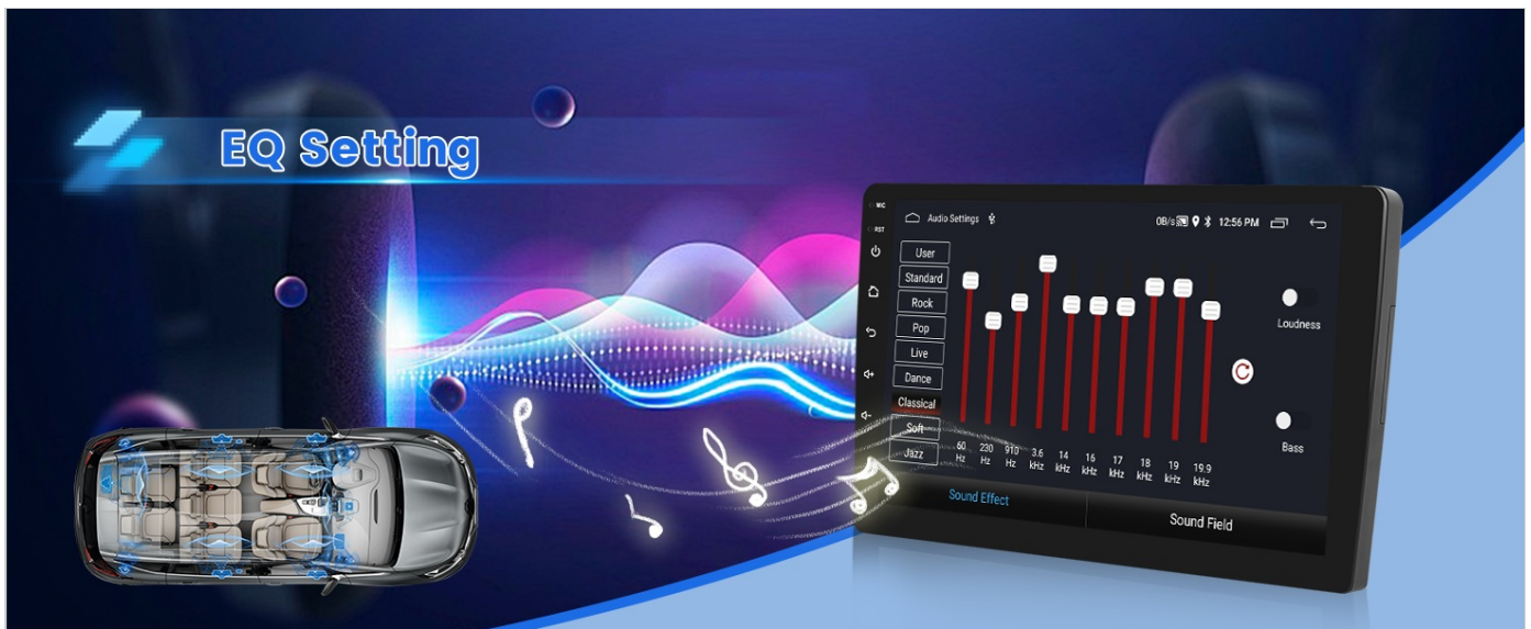
Image: Displays the equalizer (EQ) settings interface for audio customization.