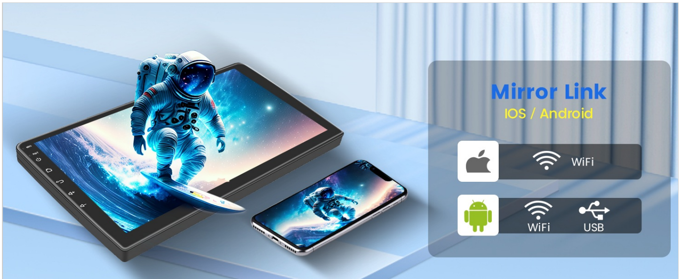
Image: Depicts the Mirror Link feature, showing content mirrored from a smartphone to the car stereo.