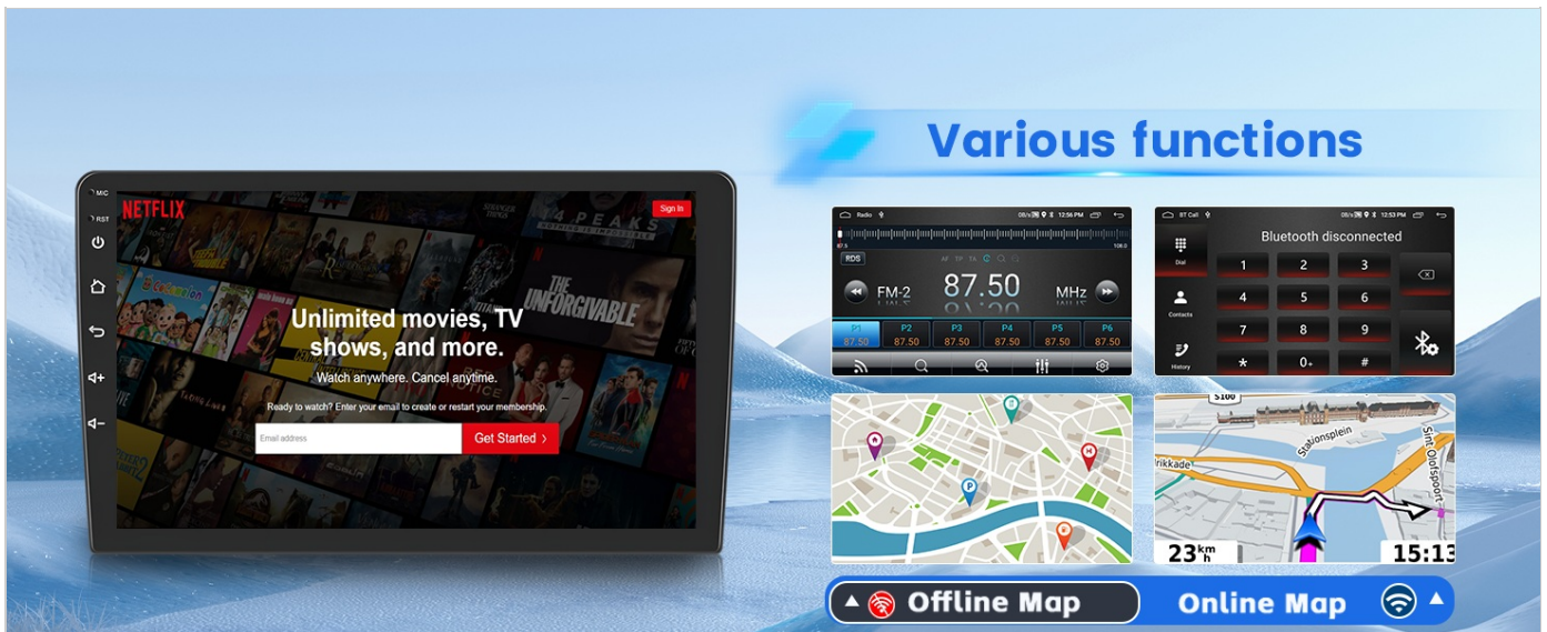
Image: Shows GPS navigation interface and various apps available via WiFi connection.

The unit supports both offline and online GPS navigation. You can download free offline maps (e.g., Waze) or use online maps. With WiFi connectivity, you can download various apps like YouTube and TikTok for entertainment.