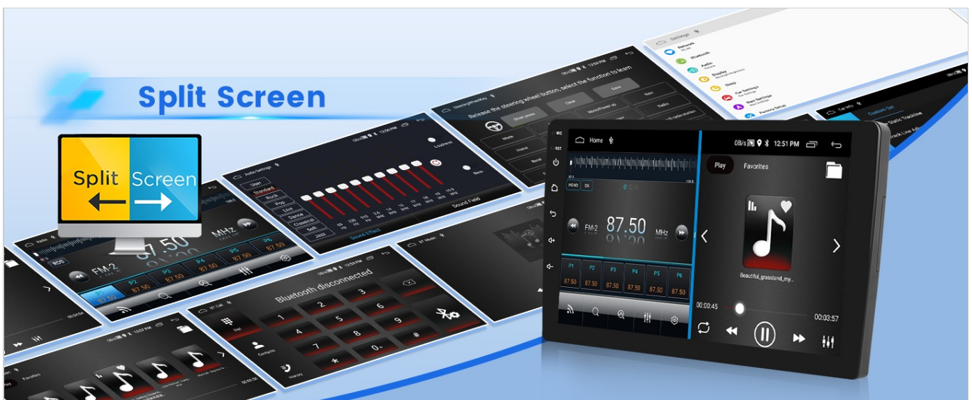
Image: Demonstrates the split-screen feature, showing two applications running side-by-side.