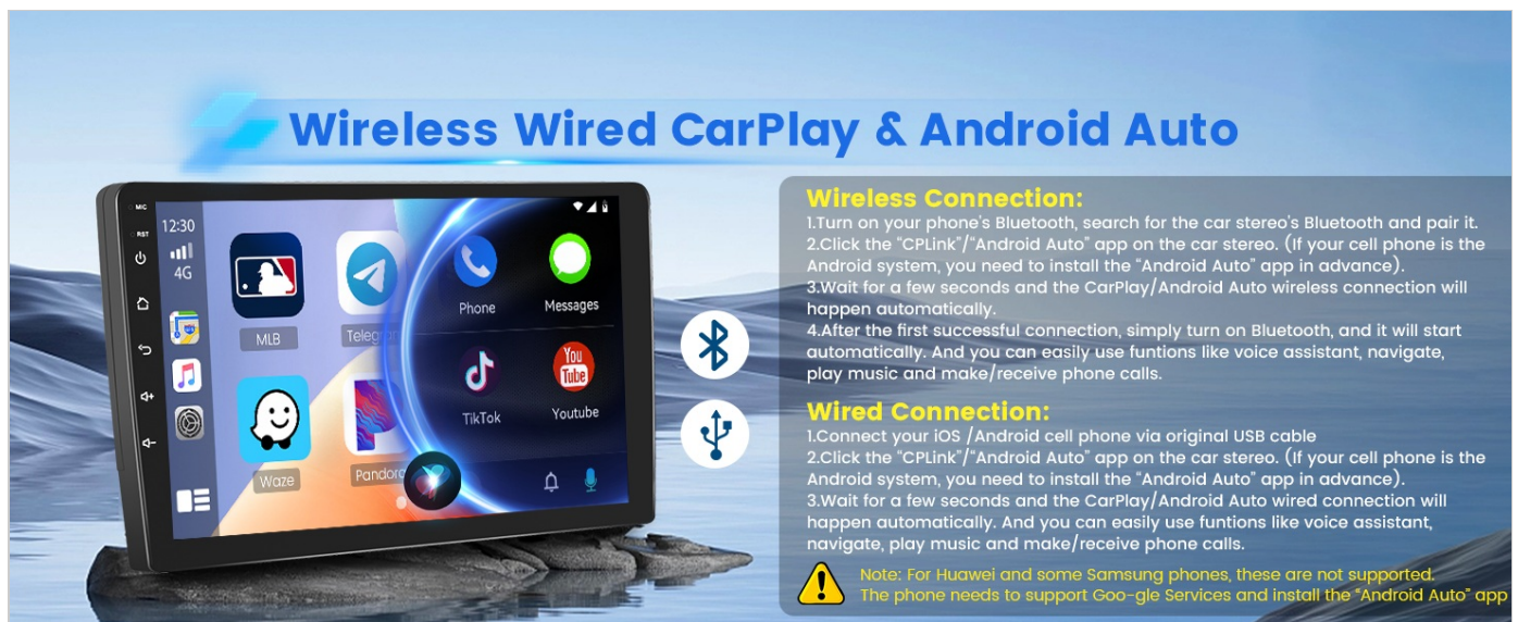
Image: Illustrates the wireless and wired connection methods for CarPlay and Android Auto.

Note: For some Samsung and Huawei phones, Android Auto and Mirror Link functionality may not be fully supported. The phone needs to support Google Services and have the "Android Auto" app installed.