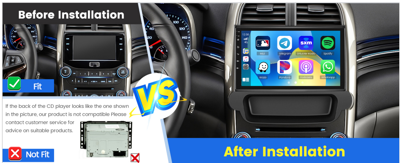
Image: Compatibility check for Chevrolet Chevy Malibu. Shows a comparison of the dashboard before and after installation, highlighting compatible and incompatible CD player types.

Important: Before purchasing and installation, verify that the power cable port on the detail page matches your original car's port. If the back of your car's CD player resembles the "Not Fit" image below, this product is not compatible. Contact customer service for suitable product advice if needed.