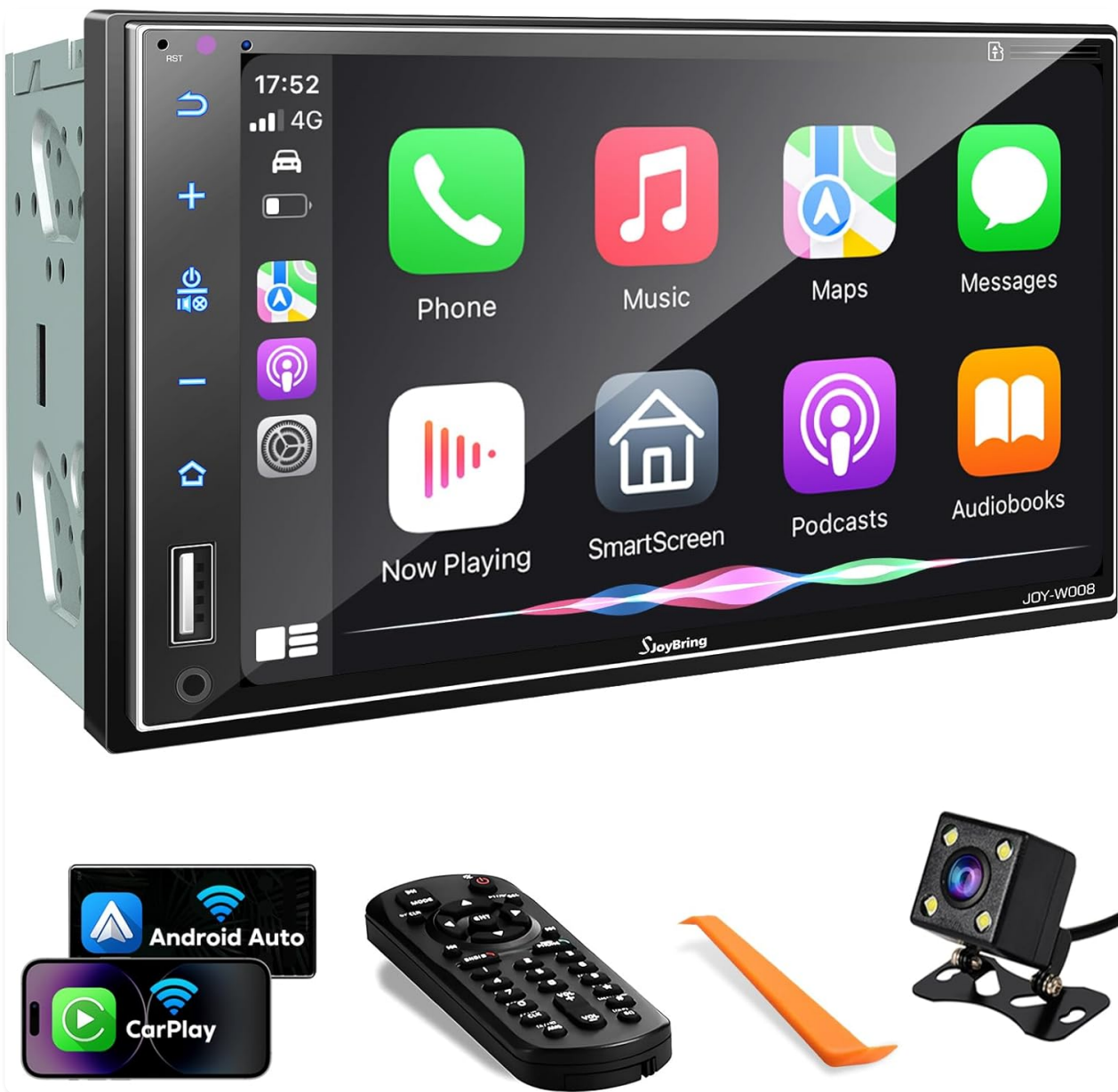
Image: The SJoyBring Double Din Car Stereo unit with included accessories like the remote control, backup camera, and installation tools.