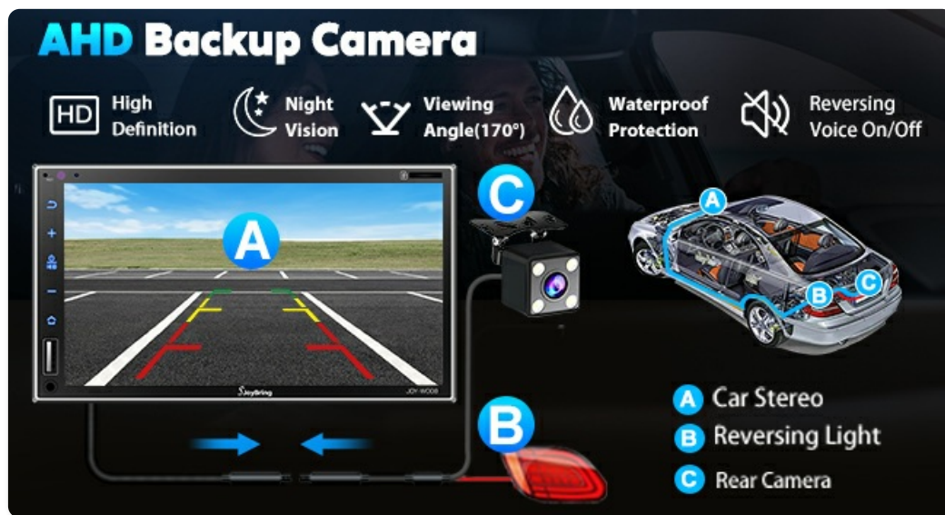
Image: The car stereo screen displaying the AHD backup camera view with parking guidelines, illustrating its high definition, night vision, and waterproof features.