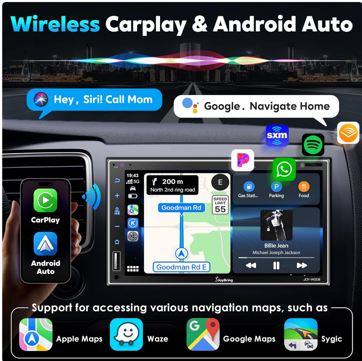
Image: The car stereo displaying Apple CarPlay and Android Auto interfaces, showing various compatible navigation and media applications.

Connect your smartphone via Bluetooth and Wi-Fi for seamless wireless CarPlay or Android Auto. This allows access to navigation, music, messages, and voice assistants directly from the stereo's display.