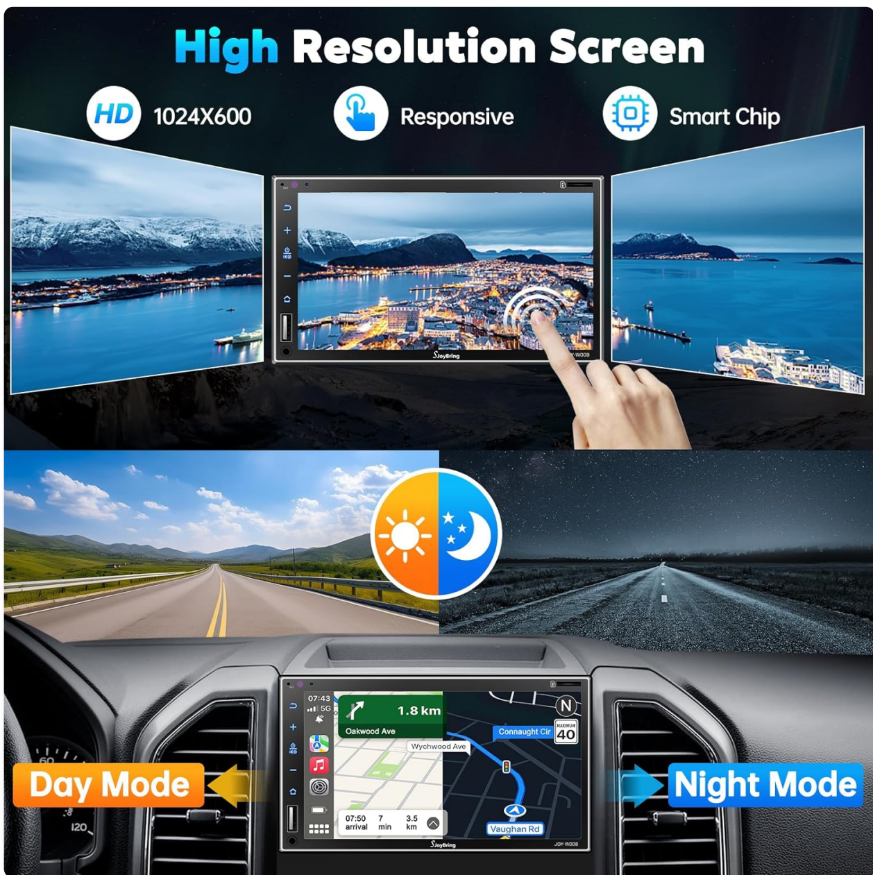
Image: The high-resolution touchscreen display showing day and night modes, highlighting its responsiveness and smart chip technology.