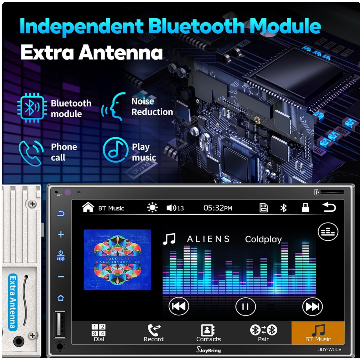
Image: Illustration of the independent Bluetooth module and extra antenna, emphasizing stable connection for phone calls and music playback.

The independent Bluetooth module and antenna provide a stable connection for hands-free calls and music streaming.