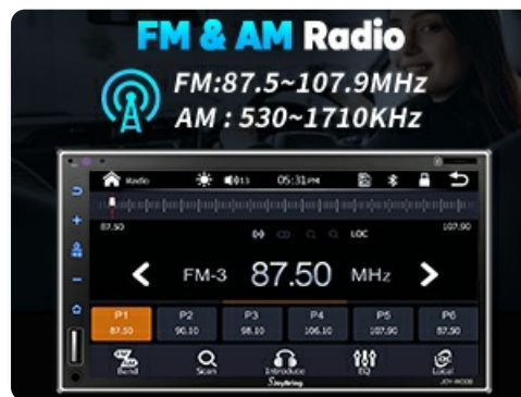
Image: The FM/AM radio interface, showing frequency tuning and preset options.

Access your favorite radio stations with the built-in FM/AM tuner. FM range: 87.5-107.9MHz, AM range: 530-1710KHz.