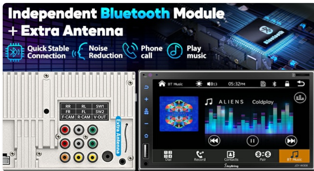
Image: Detailed view of the rear panel, highlighting the independent Bluetooth module and extra antenna for stable connections, along with various audio and video input/output ports.