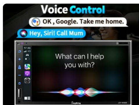
Image: The voice control interface showing prompts for Siri and Google Assistant, illustrating hands-free operation.

Utilize Siri or Google Assistant for voice commands, enabling safer operation without touching the screen.