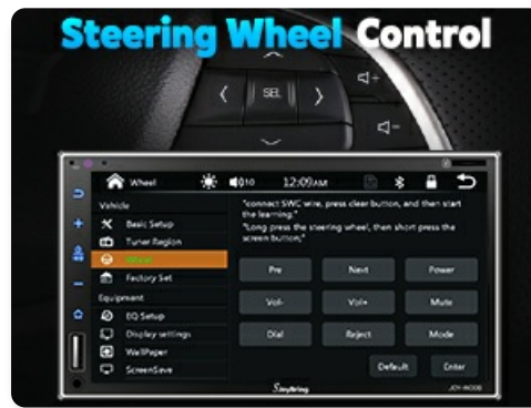
Image: The steering wheel control settings screen, showing options to map vehicle steering wheel buttons to stereo functions.

The unit supports steering wheel controls, allowing you to manage audio and other functions without taking your hands off the wheel.