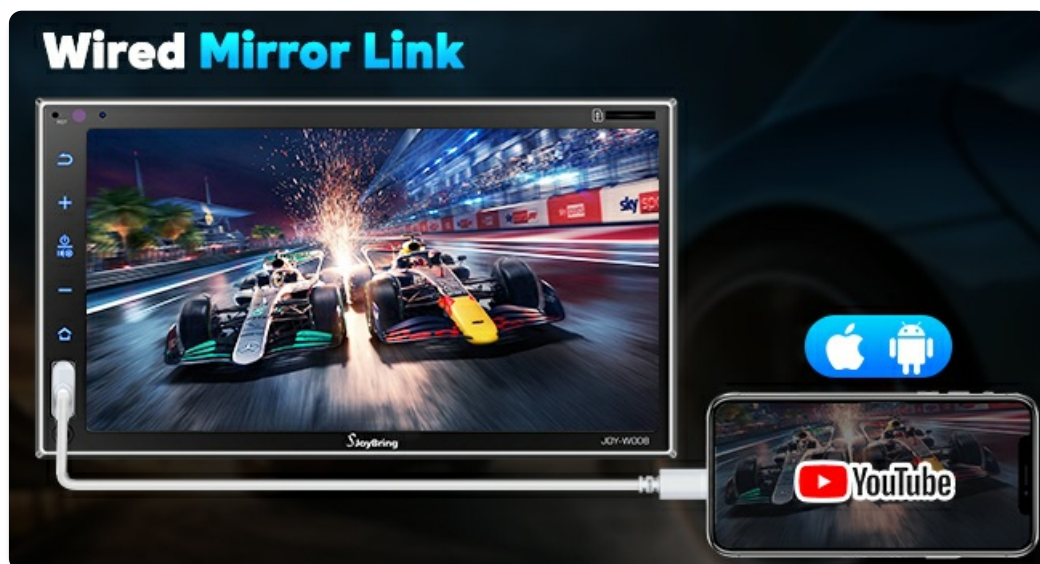
Image: A smartphone connected to the car stereo via USB, demonstrating the wired mirror link function for displaying phone content on the stereo screen.

Use the USB connection to mirror your iOS or Android phone screen onto the stereo display, allowing you to view apps like Google Maps or Spotify.