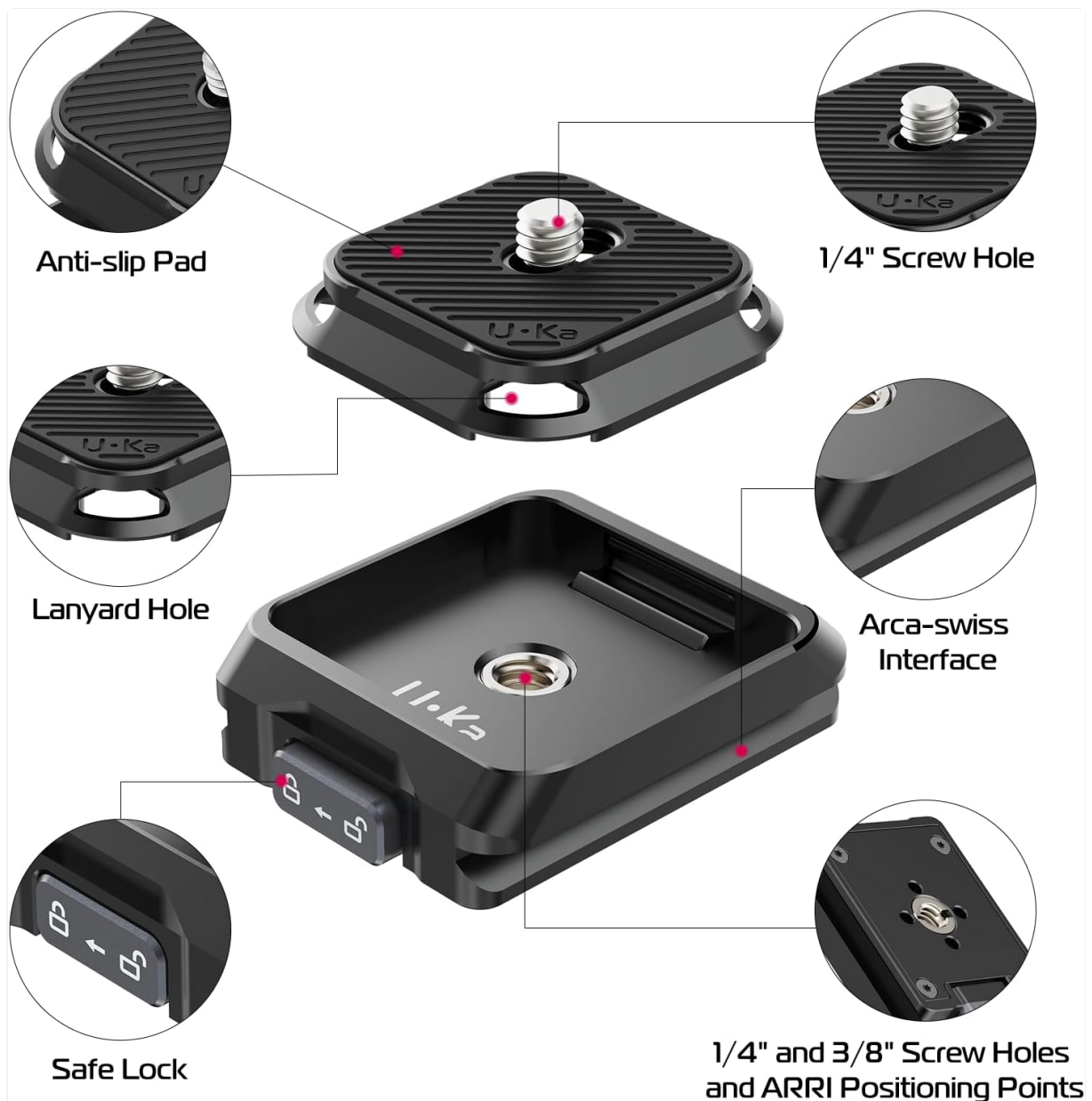
Figure 4.1: Detailed view highlighting key features such as the anti-slip pad, 1/4" screw hole, lanyard hole, Arca-Swiss interface, safe lock, and 1/4" and 3/8" screw holes with ARRI positioning points.