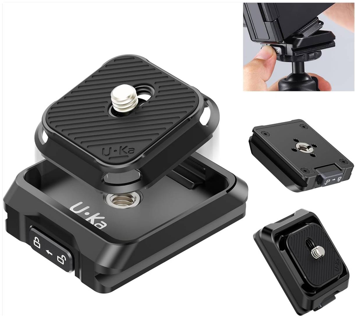
Figure 6.1: A camera with the quick release plate being inserted into the quick release base.