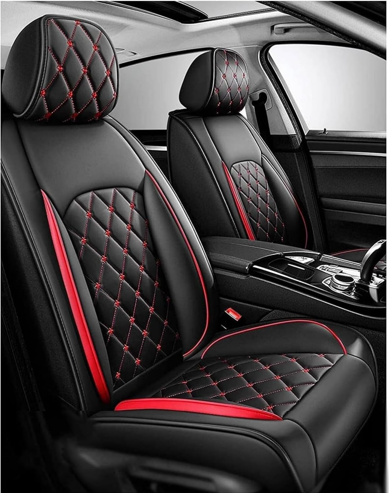
Image: Front view of installed car seat covers in black with red accents and diamond stitching.