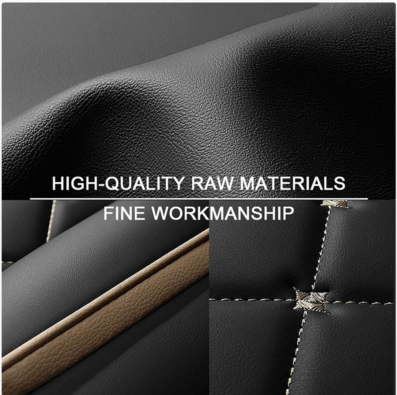
Image: Detail showing the high-quality raw materials and fine workmanship of the seat covers.