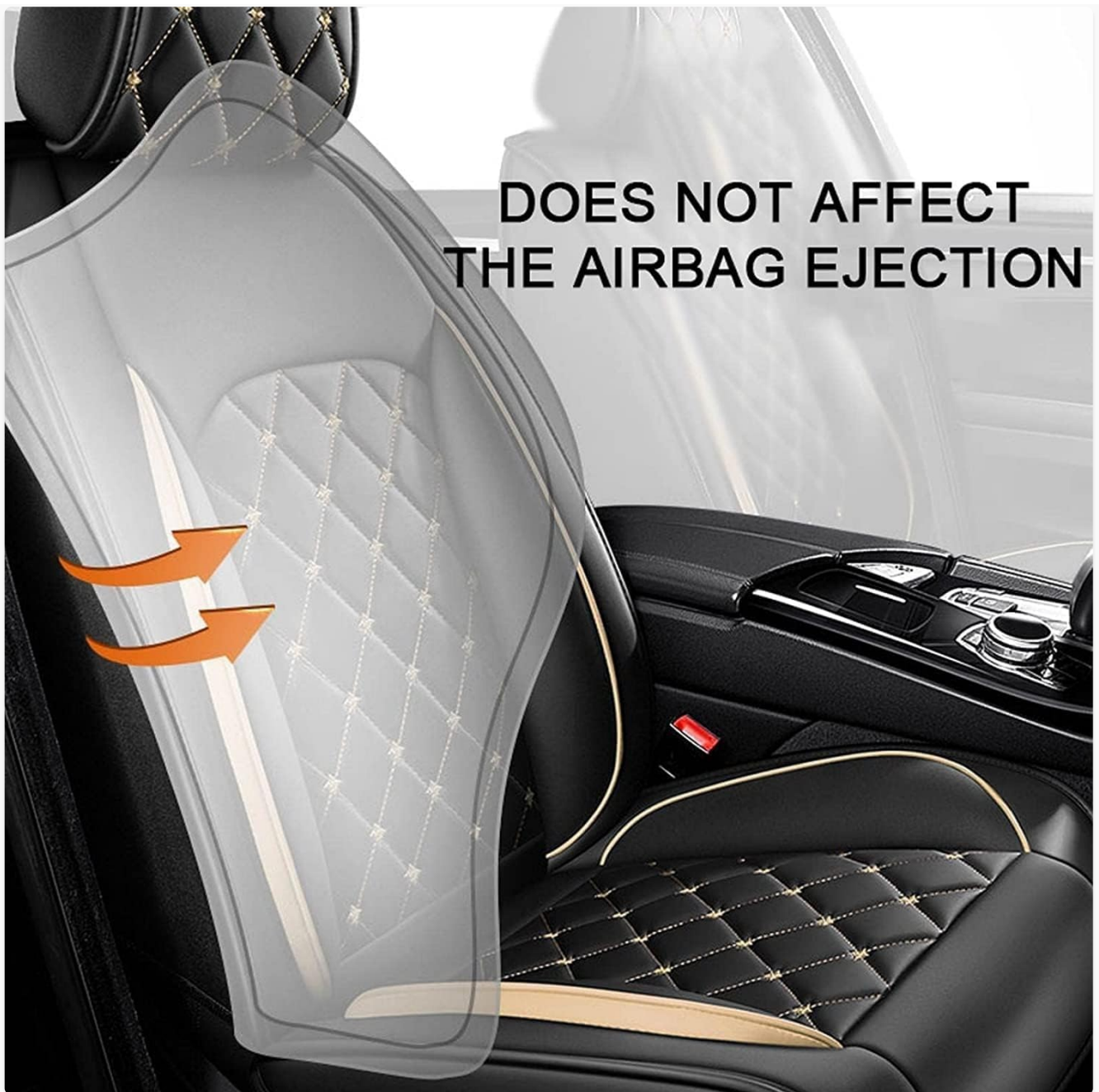
Image: Illustration demonstrating that the seat covers do not impede airbag deployment.