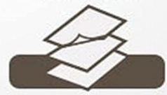
Image: Exploded view illustrating the multi-layered construction for comfort and durability.