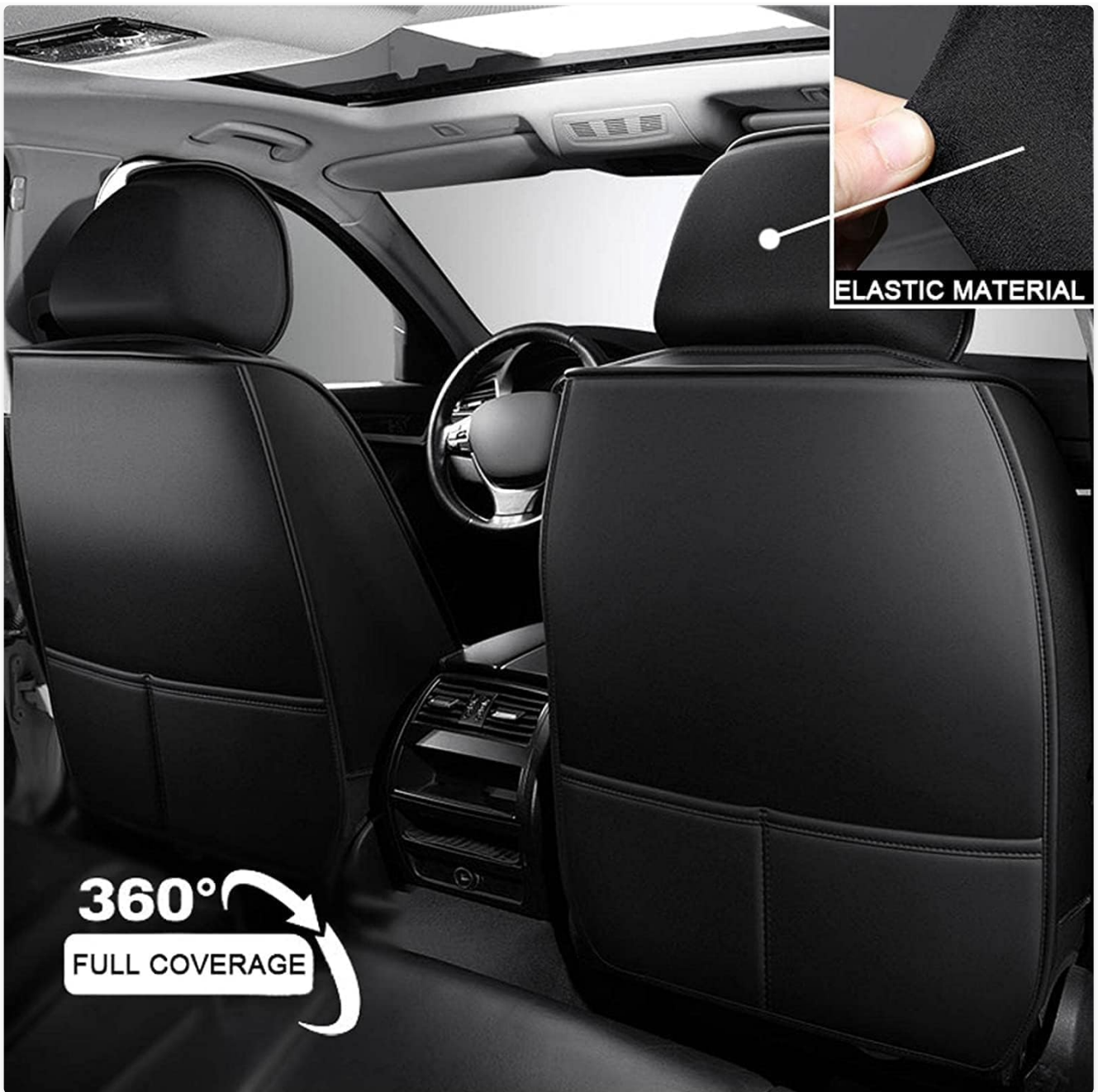
Image: Rear view of a car seat demonstrating the 360-degree full coverage provided by the seat cover.