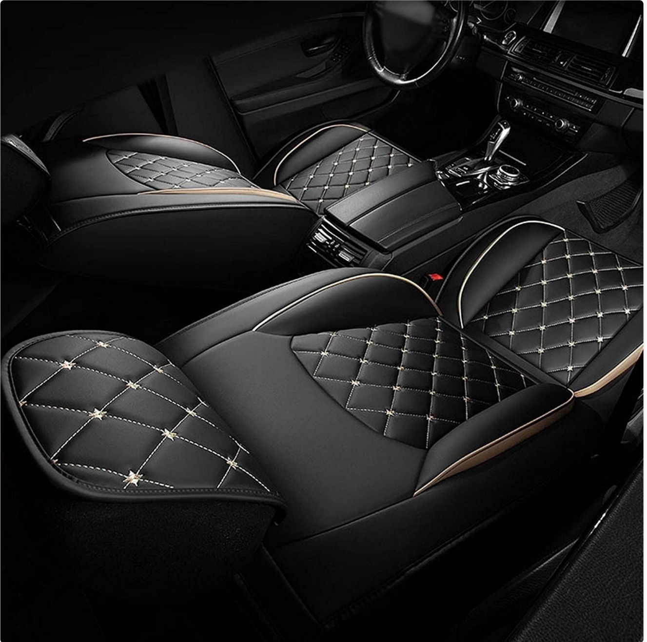
Image: View of car interior with seat covers installed on both front and rear seats.

These seat covers feature a full cover design. If your original seat backrest has an integrated screen, the seat cover may affect its use. Please confirm your seat configuration before purchase.