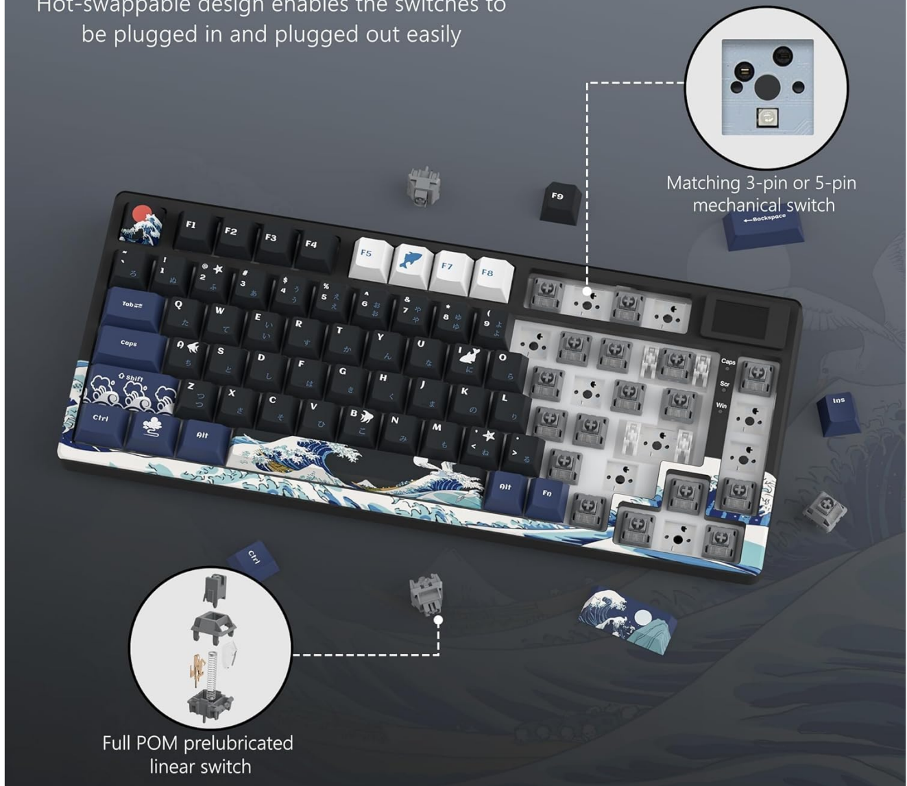
Figure 8: Hot-Swappable Switch Mechanism

Hot-swappable design enables the switches to be plugged in and plugged out easily