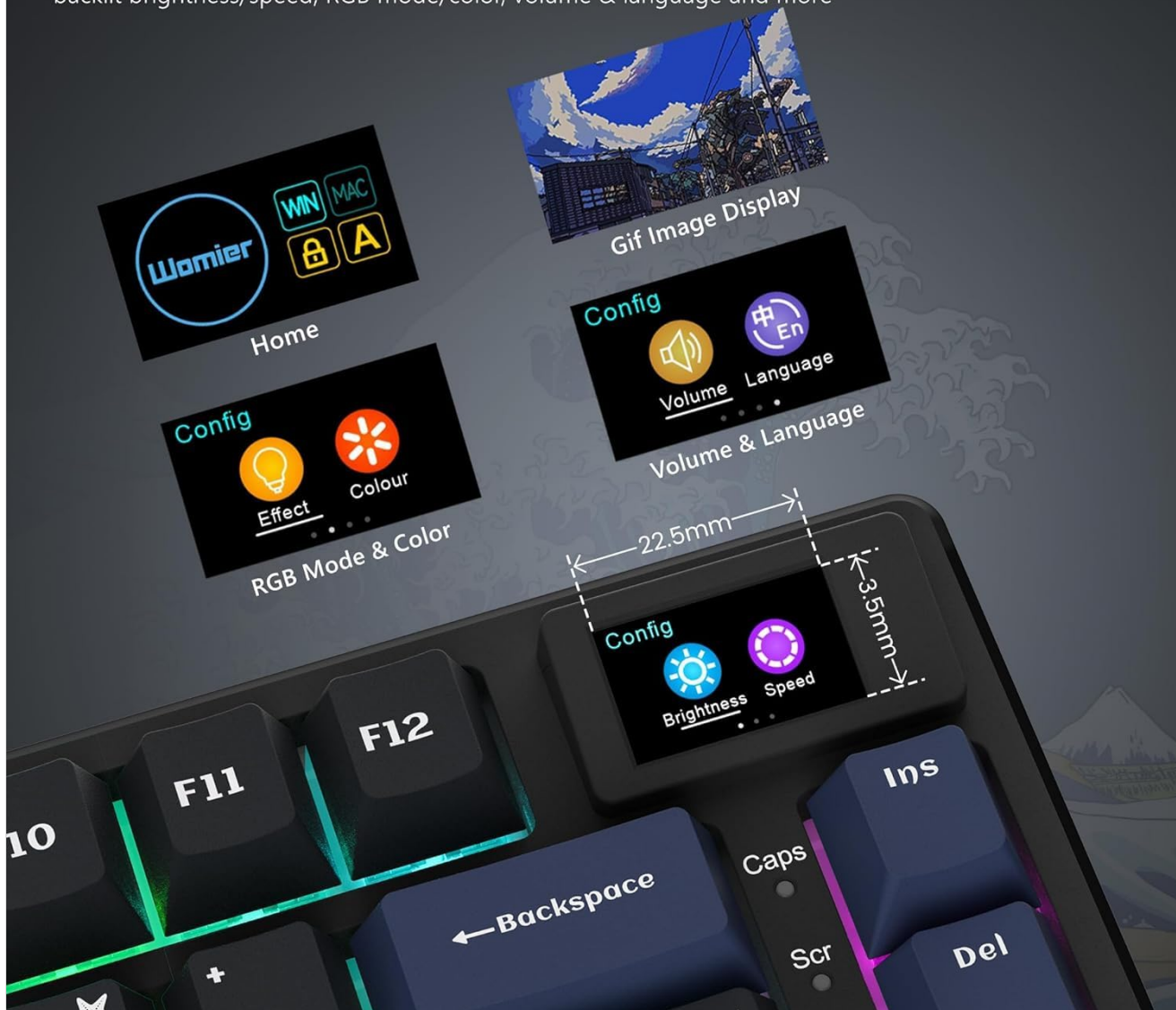
Figure 5: LCD Screen Displaying Various Settings

Custom gif image, caps lock, connection mode, WIN/MAC, system, backlit brightness/speed, RGB mode/color, volume & language and more