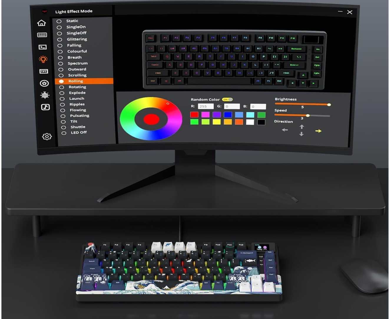
Figure 7: Keyboard Driver Software Interface

Macro software allows users to set dynamic GIF animation according to their own preferences, and define lighting effects and key functions