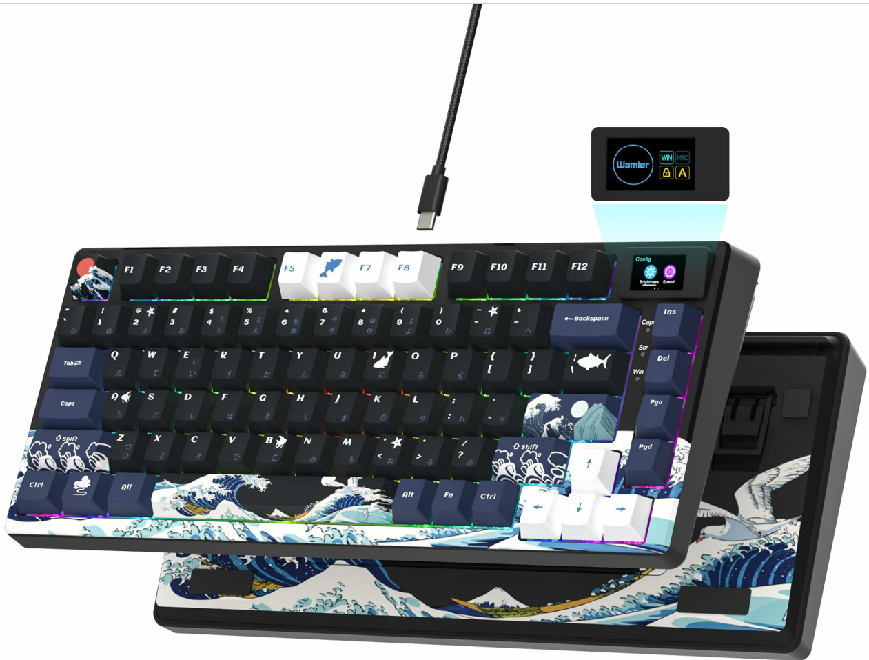
Figure 1: Womier SK80 Wired Gaming Keyboard (Black)