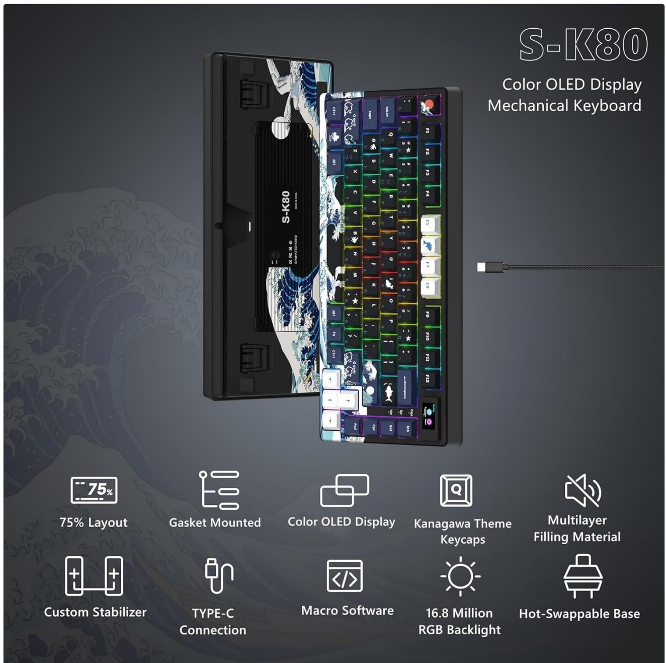
Figure 6: Customizable RGB Backlighting