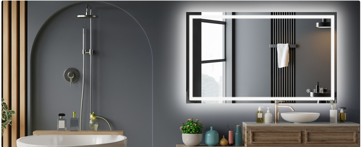
Image: The YOLEO LED Bathroom Mirror demonstrating its dual front and back lighting capabilities for enhanced brightness.

The mirror features both front and back lighting, providing bright, shadow-free illumination suitable for various tasks like makeup application, shaving, and skincare. Both light sources can be controlled independently.