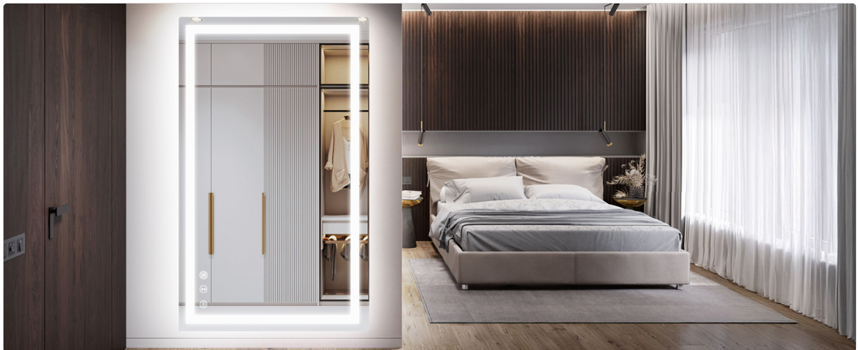
Image: The mirror showcasing its three color temperature options: warm, natural, and cool white light.

Both front and back lighting are dimmable. Adjust the brightness by a long press on the touch switch. Choose from three color temperatures: 3000K (warm light), 4000K (natural light), and 6000K (white light) to suit your preference and needs.