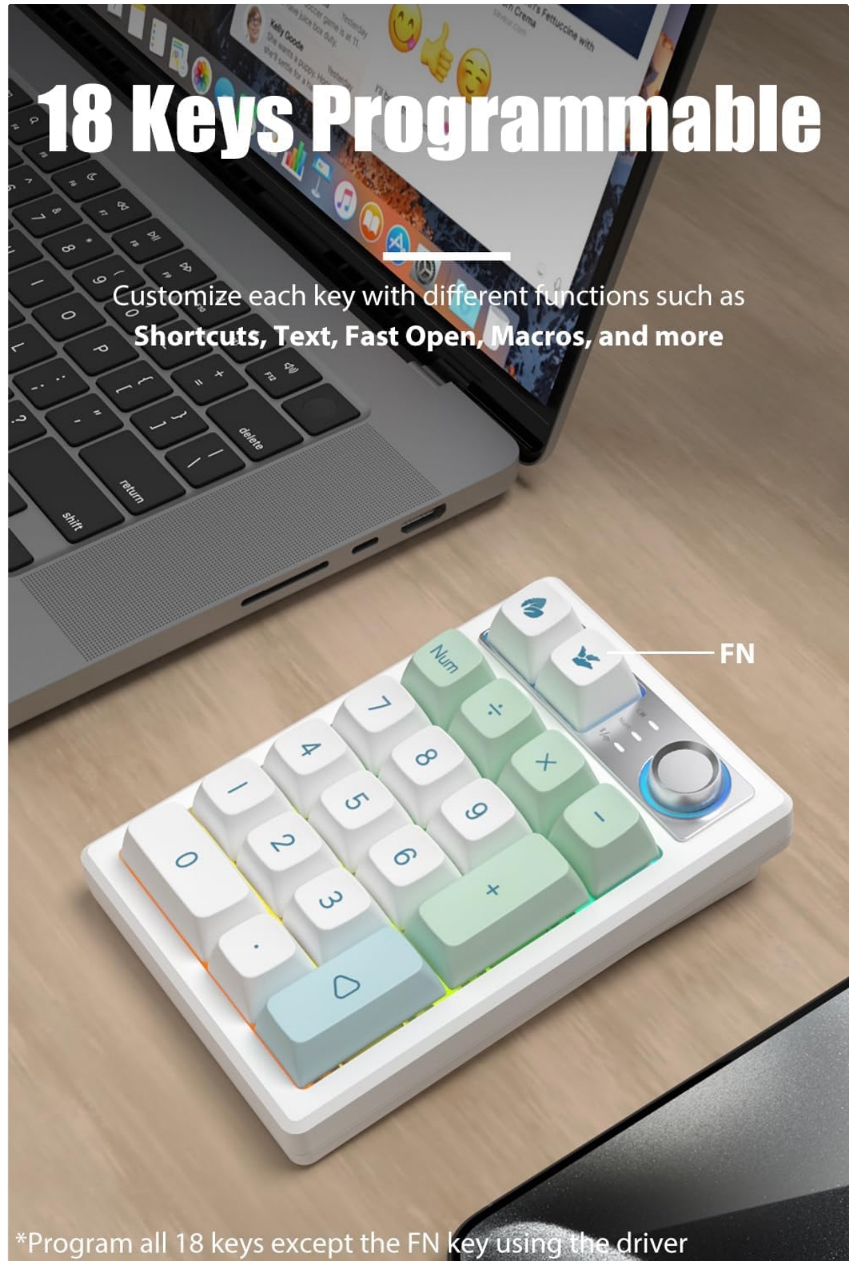
Image: The numpad with a laptop in the background, illustrating its 18 programmable keys.

All 18 keys, excluding the FN key, are programmable using the dedicated keypad driver. You can customize each key with various functions, including system shortcuts, multimedia shortcuts, text input, one-click access for files/folders/web pages, and macros. The numpad retains these settings even after power loss. The keypad driver can be downloaded from: bit.ly/K19-Driver .