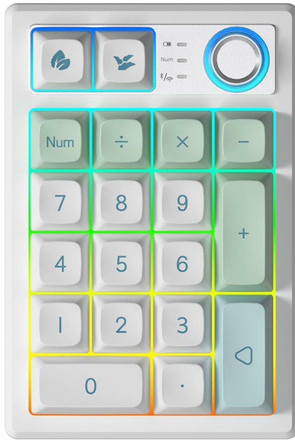
Image: The TISHLED K19-IS Gasket Creamy Mechanical Numpad in Mint color, showcasing its layout and design.