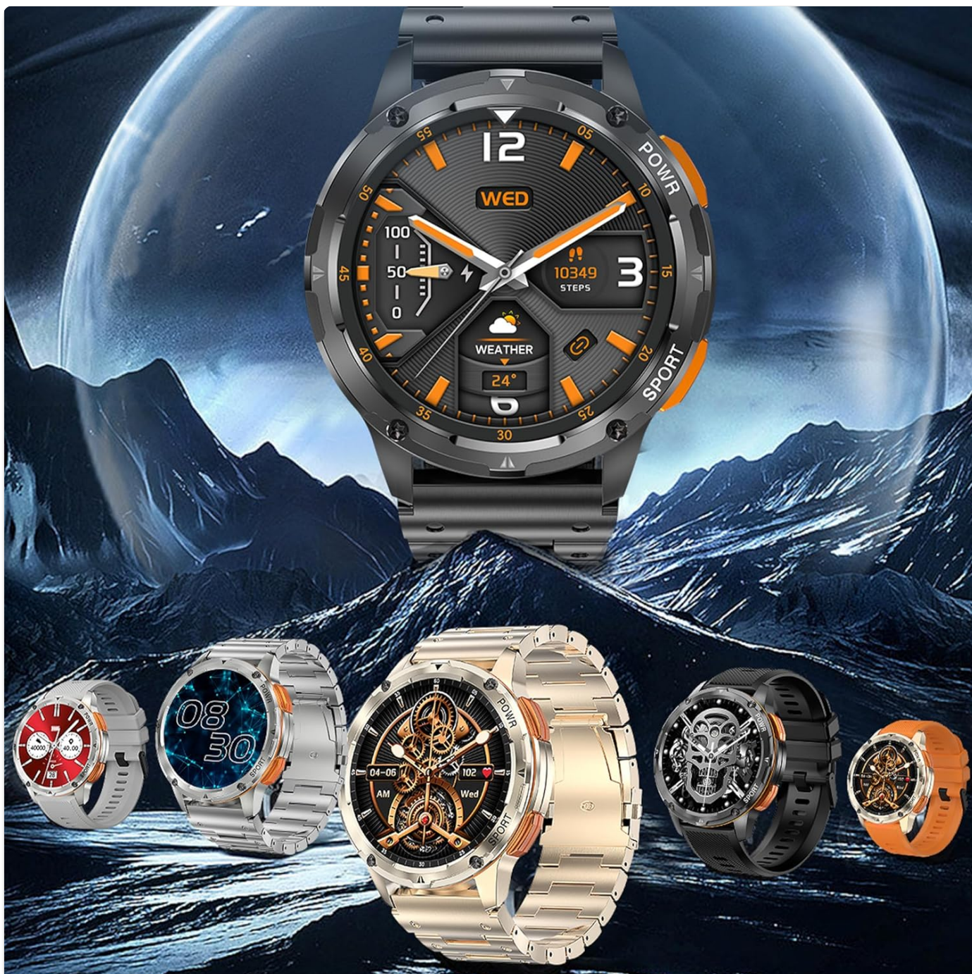
Figure 2: The ZPIMY smartwatch available in multiple styles and strap options.