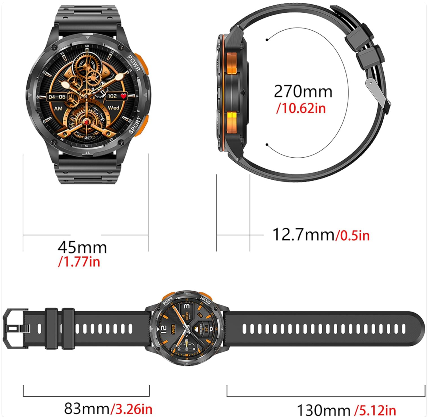
Figure 8: Smartwatch dimensions (45mm width, 12.7mm thickness, 270mm total strap length).