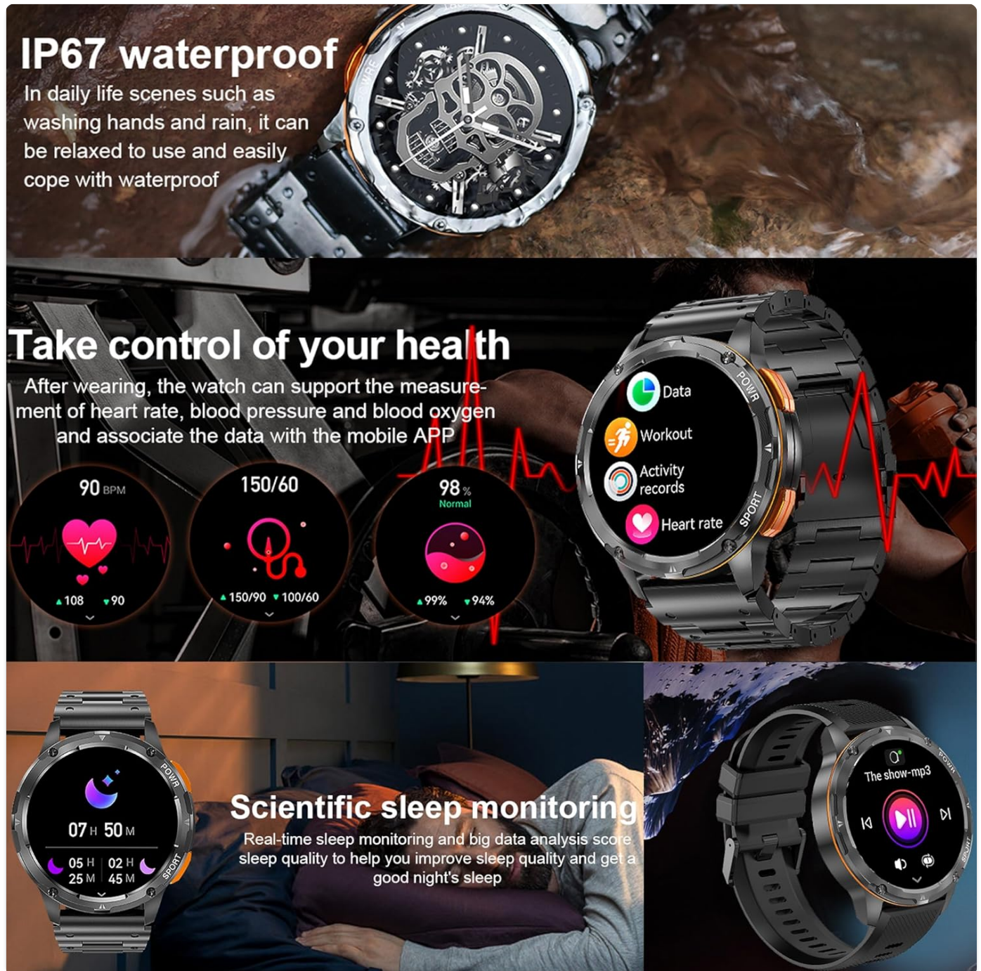
Figure 7: Health tracking features including heart rate, blood pressure, blood oxygen, and scientific sleep monitoring.

The ZPIMY smartwatch offers comprehensive health monitoring features to help you stay informed about your well-being.