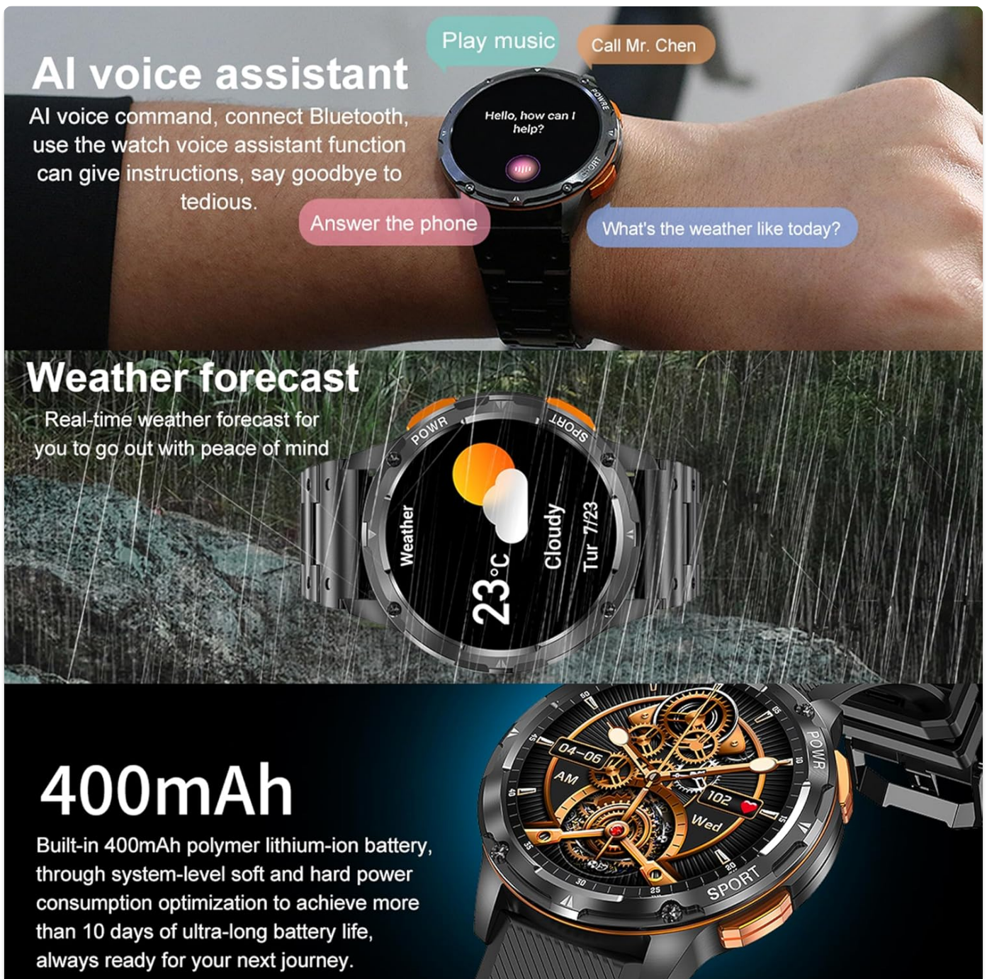
Figure 6: AI Voice Assistant, Weather Forecast, and 400mAh Battery features.