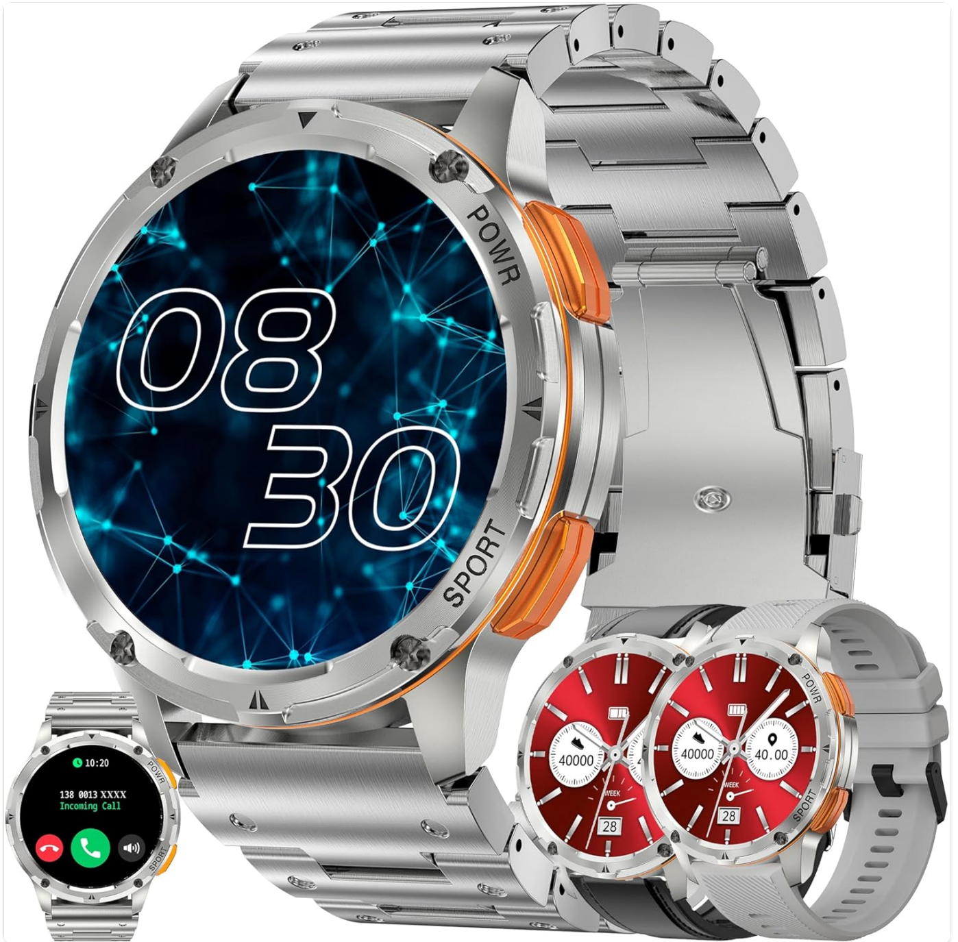
Figure 1: ZPIMY 1.43" AMOLED Smartwatch with its included silver metal band.